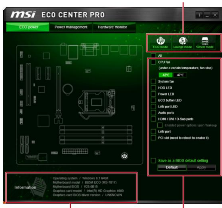
Figure 3 ECO power screen of ECO Center Pro

The MSI Board is shipped with the power configuration and monitoring utility ECO Center Pro. In the project this utility was used to conduct most of the experiments leading to better idle power. The researchers see such utilities as essential for tuning the power beyond the power option utilities integrated in the OS and therefore have conducted an analysis of the necessary engineering manpower for the design, implementation and distribution of such specialized utilities by the motherboard manufacturers.