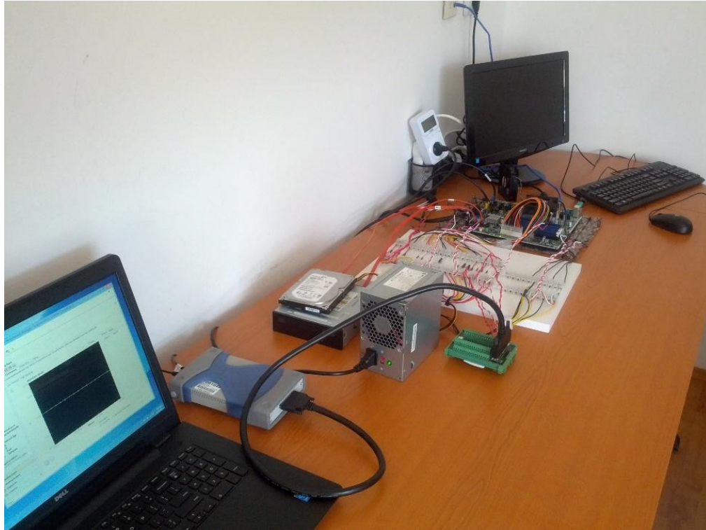
Figure 2. Complete setup for desktop power measurement

For measuring all the power supply rails used (motherboard, CPU, HDD and DVD) we would need a DAQ device with 18 channels. Since the available DAQ did not have that many channels, we assumed that the multiple power rails of the same voltage levels are used just for decreasing the overall currents, so the measurements were performed in a manner that the same voltage level rails were measured in the same group. This was achieved using all of the available DAQ channels at the sampling frequency of 1 kHz for each channel. The raw voltage measurements for each channel were converted to power data and then written to a file by the measurement software. We ran the acquisition for 5 minutes on each channel and calculated the average power consumption on each rail. The total DC power was calculated as the sum of the average rail power.