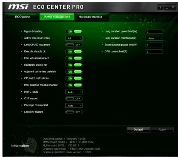
Figure 4 Power Management tab

Figure 4 shows the Power Management tab of the ECO Center Pro utility. We estimate the engineering effort to develop the underlying functionality to 8 man-weeks of a power software engineer if all required functionality is covered in provided documentation and 8-16 man-weeks if the information has to be extracted from distributed sources. The estimated effort for the GUI functionality is 1 week (for standard QT-style GUI) and 1-3 weeks for graphic design.