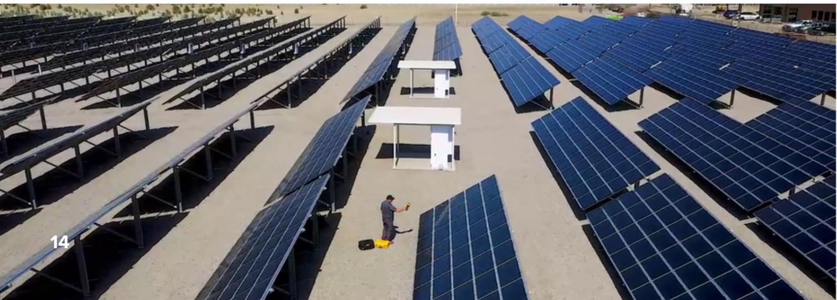
Photo: Utility-scale solar tour with Fluke