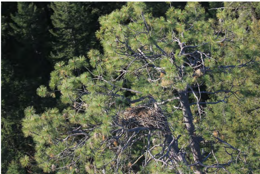
Nest 167c, located approximately 10.1 mi (16.3 km) north of the Fountain Wind Project.