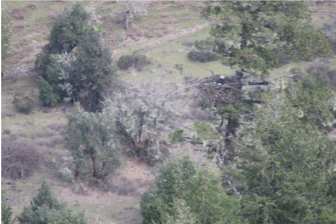
Nest 59, located approximately 6.5 miles northeast of the Fountain Wind Project.