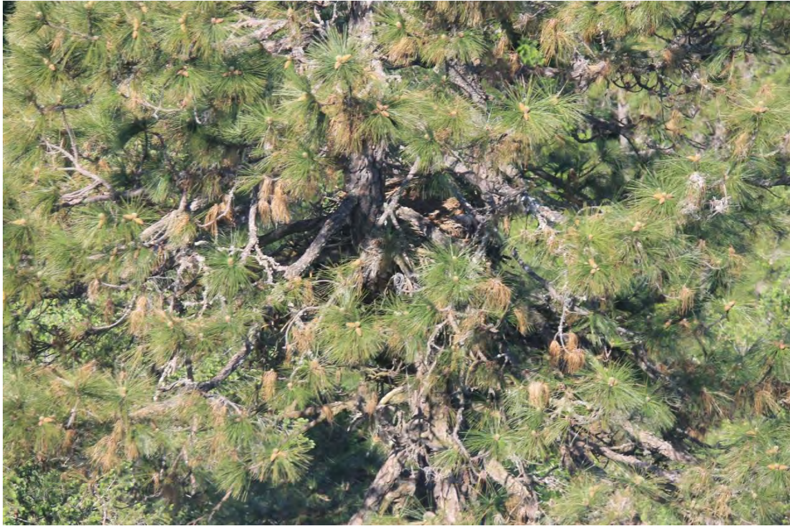
Nest 332, located approximately 9.1 miles west of the Fountain Wind Project.