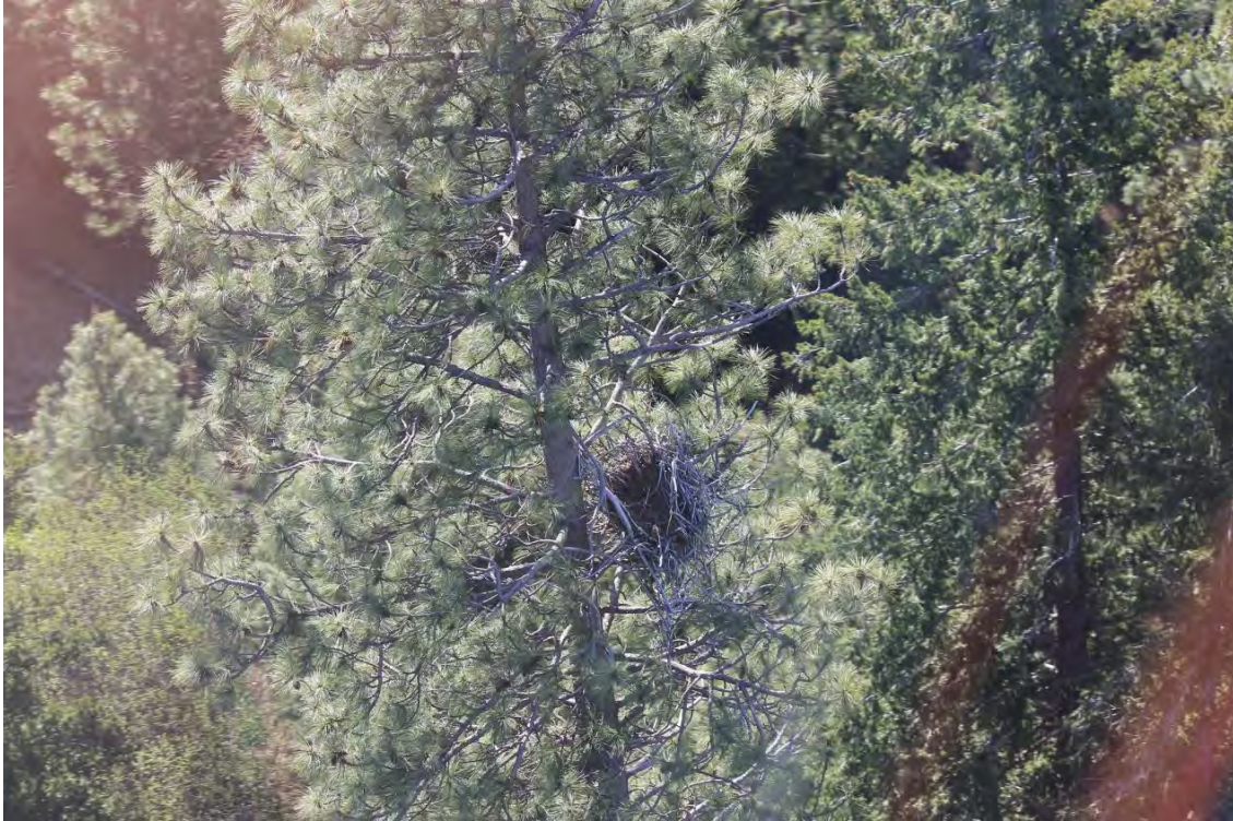
Nest 299, located approximately 2.9 miles east of the Fountain Wind Project.