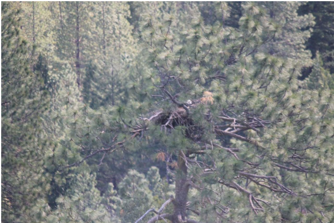
Nest 58, located approximately 4.2 miles north of the Fountain Wind Project.