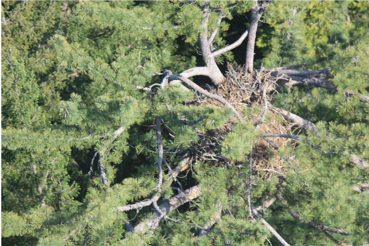
Nest 167b, located approximately 10.1 mi (16.3 km) north of the Fountain Wind Project.