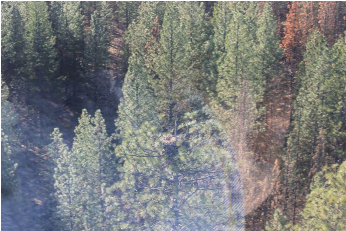
Nest W4, located approximately 6.7 miles northeast of the Fountain Wind Project.