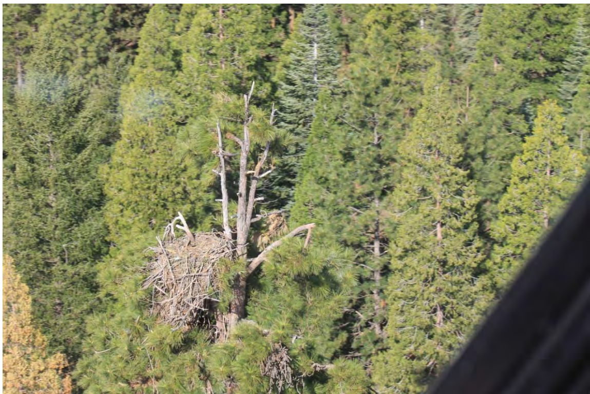
Nest W2, located approximately 8.8 miles northeast of the Fountain Wind Project.