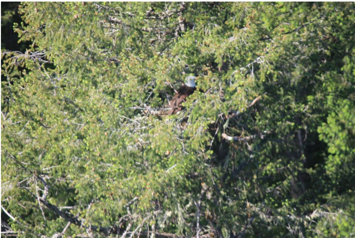
Nest 307, located approximately 5.5 miles northeast of the Fountain Wind Project.