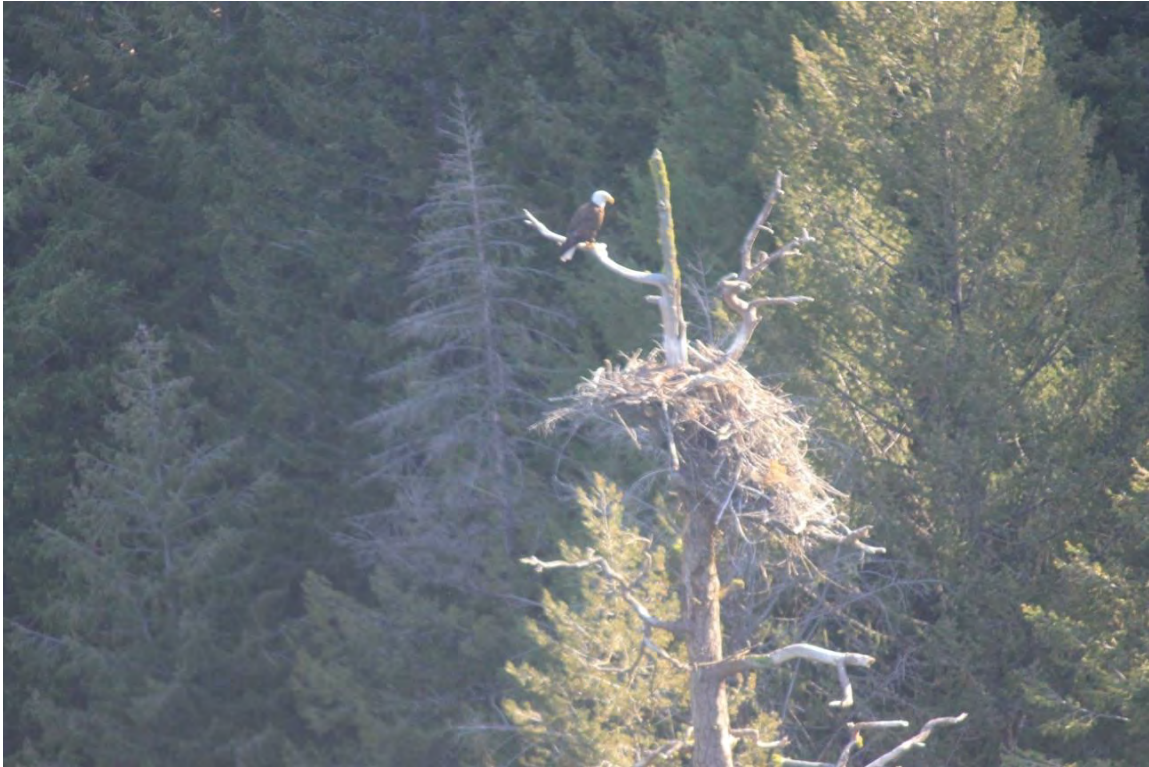
Nest 310, located approximately 5.5 miles northeast of the Fountain Wind Project.