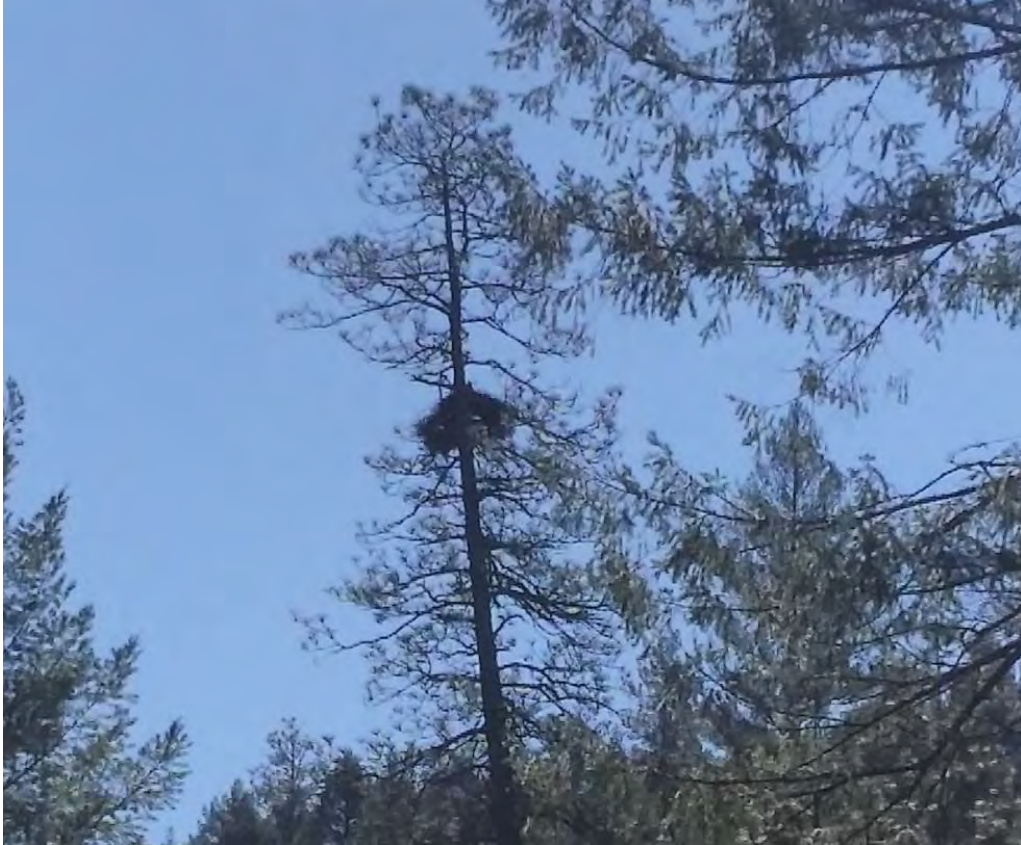
Nest 308, located approximately 5.0 mi (8.0 km) west of the Fountain Wind Project.