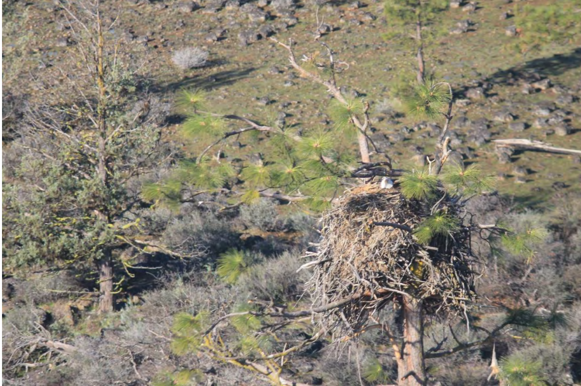
Nest 178, located approximately 6.0 miles east of the Fountain Wind Project.