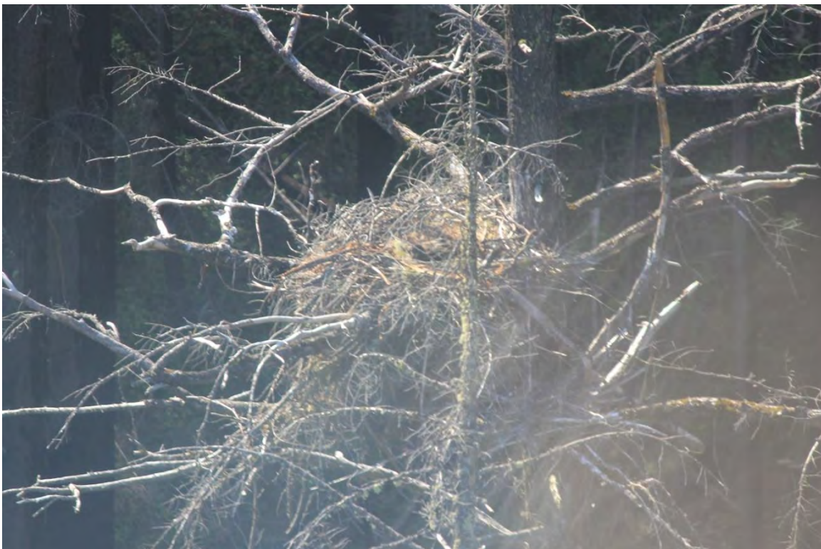
Nest 157, located approximately 6.2 miles northeast of the Fountain Wind Project.