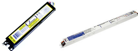
Figure 1. Typical Fluorescent Ballasts