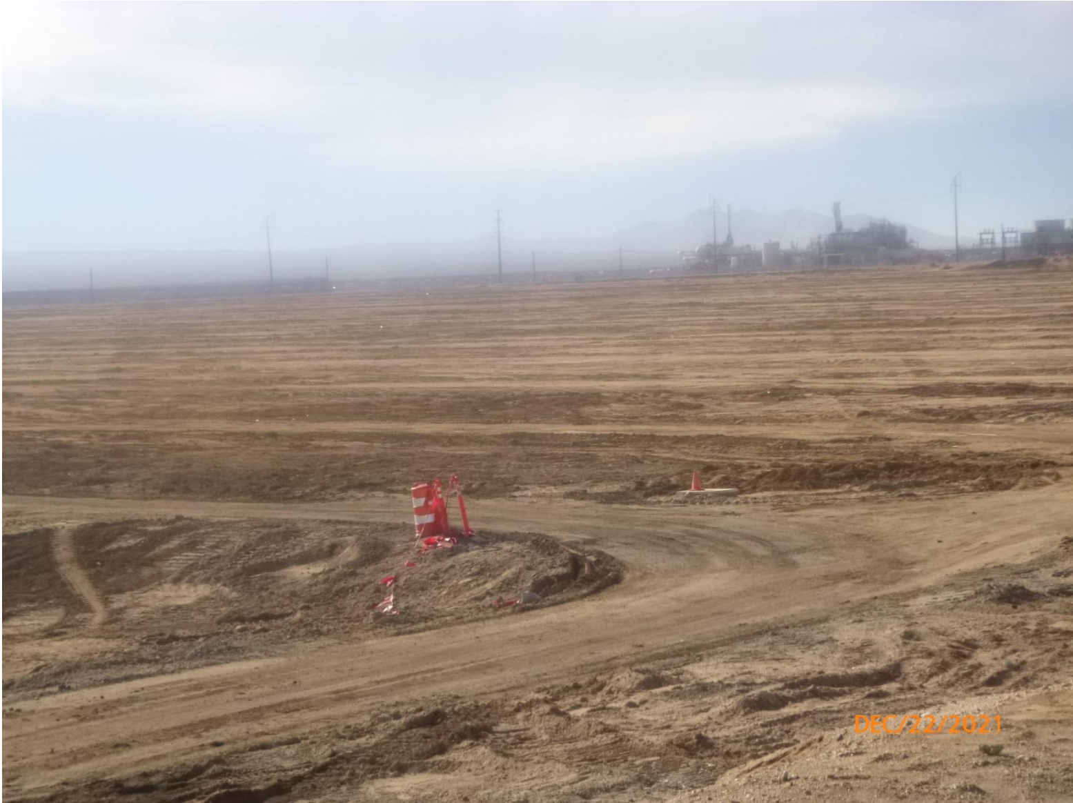
#5. SEGS IV viewed from south to north SEGS VI in distance