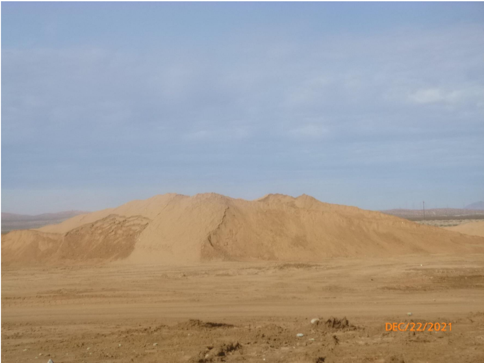
#7 SEGS V sand soil stockpile for future construction