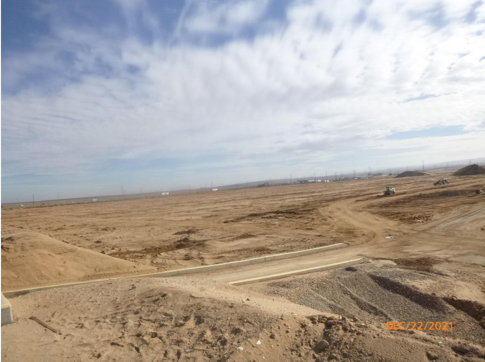
#6 SEGS V viewed from West to East US #395 in distance