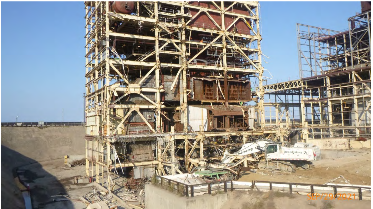
Photo #3: Unit #5 east, boiler unit still intact demo is ongoing of non-structural and structural frame.