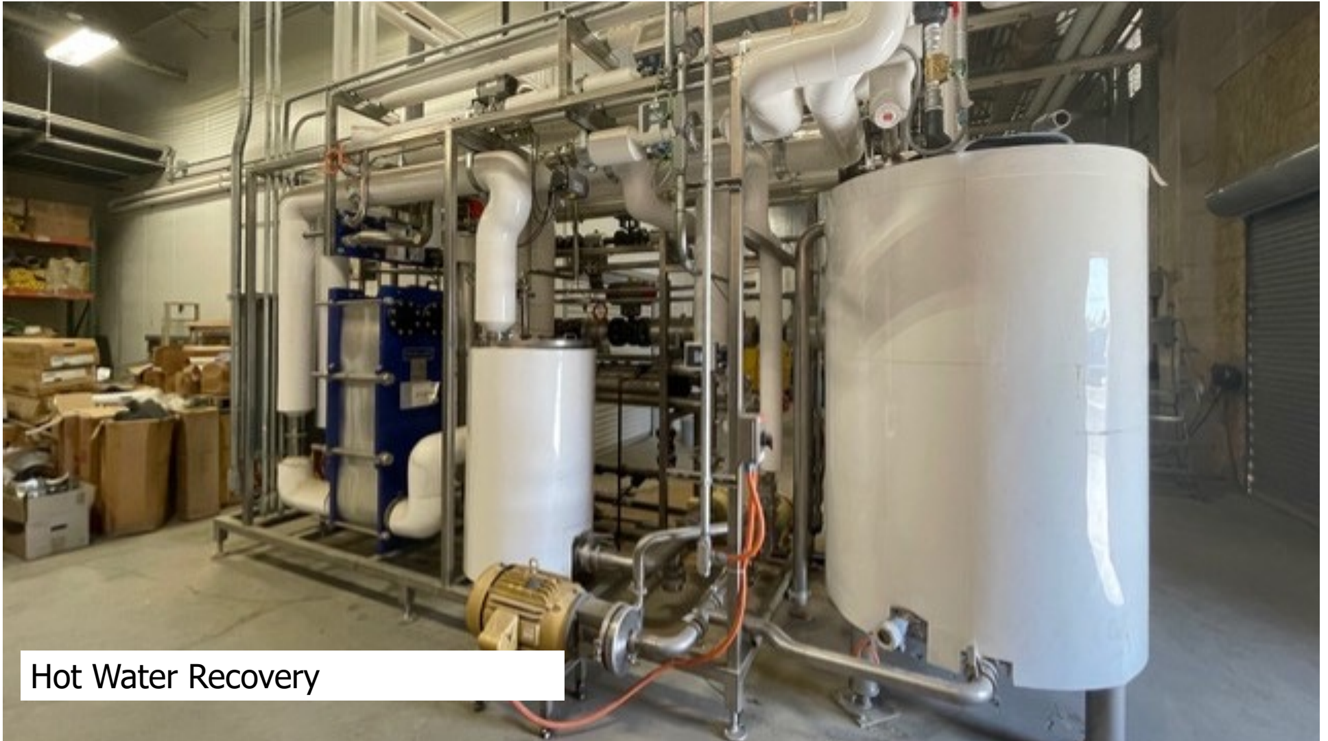
Hot Water Recovery