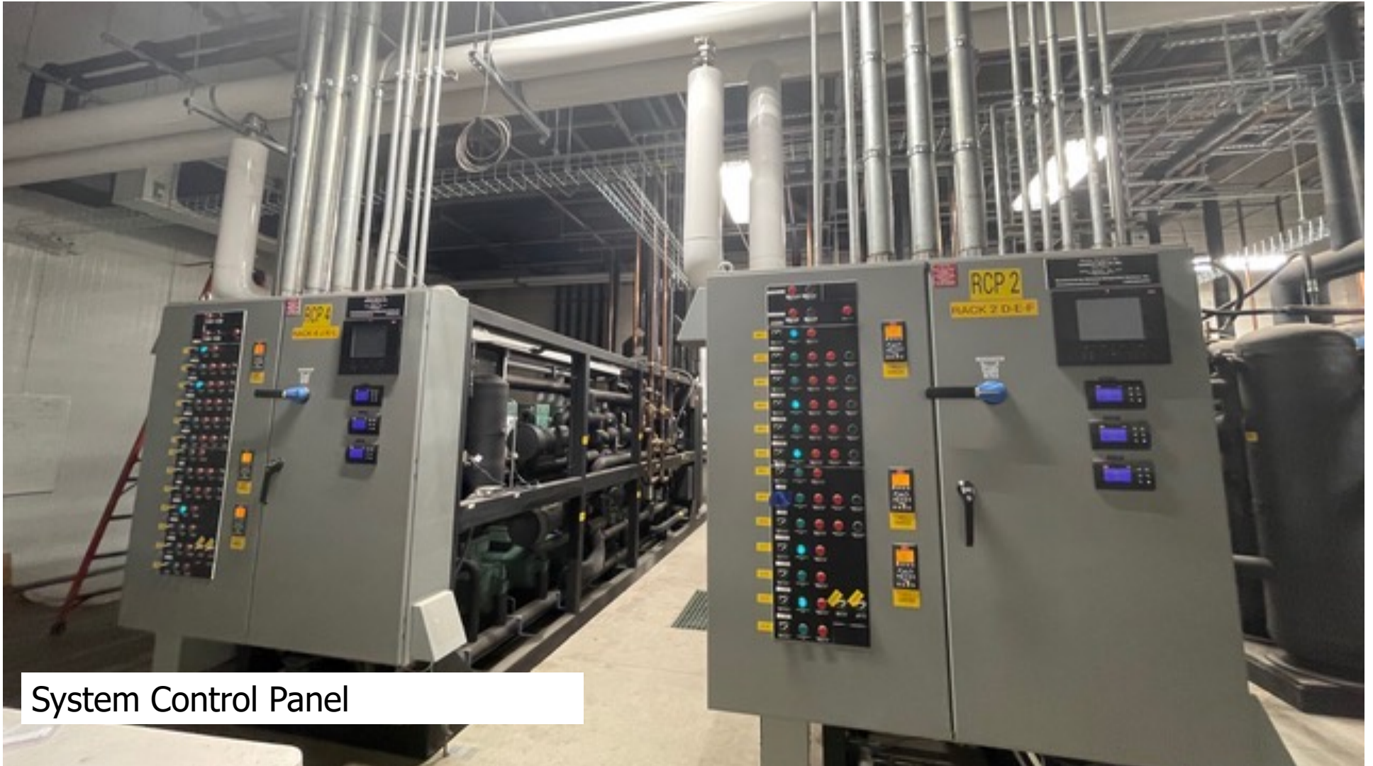
System Control Panel