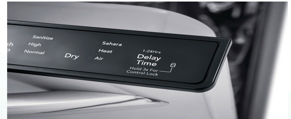
Frigidaire Dishwasher Delay Feature