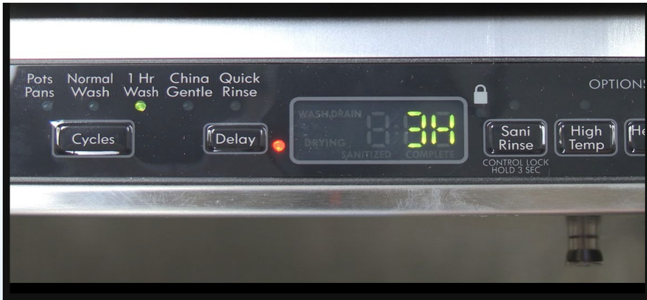
Whirlpool Electric Dishwasher Delay Feature