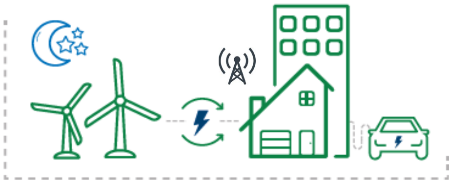
Business as usual night-time flex