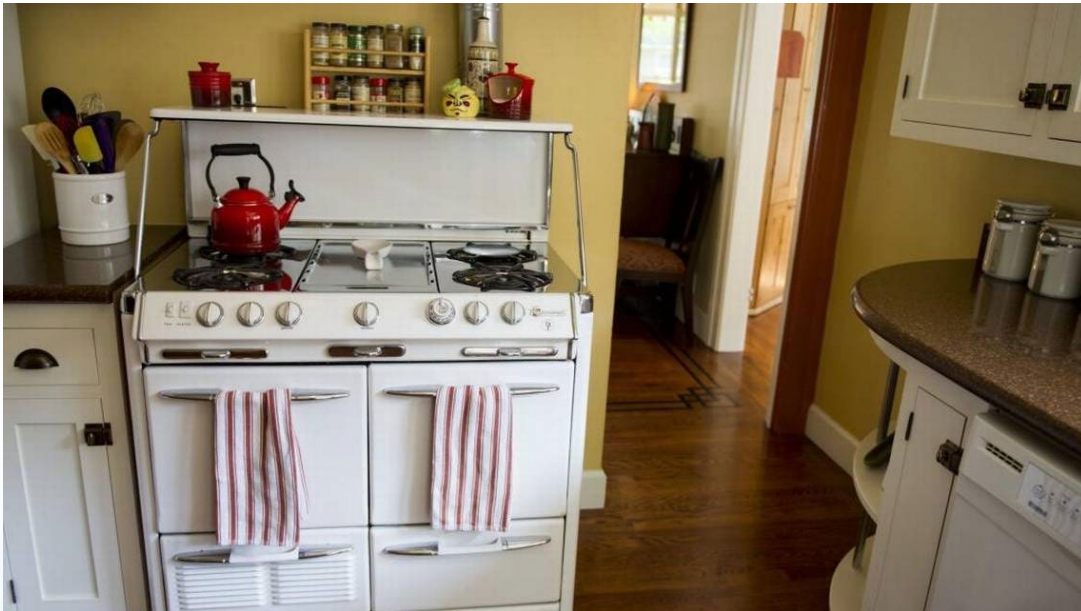
Residential ovens for San Joaquin Valley wood-burning, propane appliance replacement program