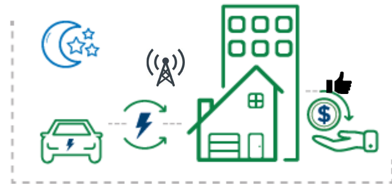
Combined strategy flex