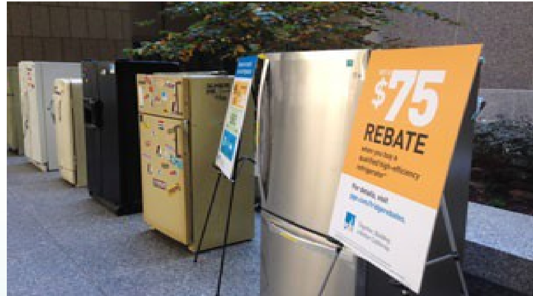
Display of older model and newer model refrigerators, and information on utility Appliance Rebate Programs.