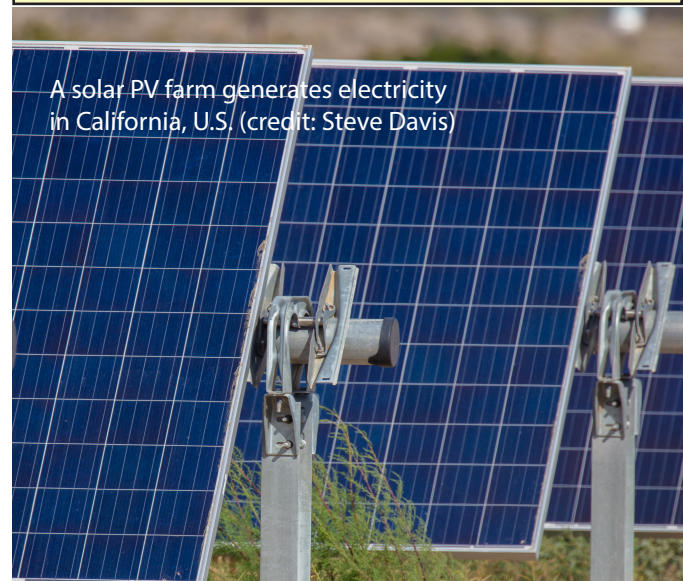
A solar PV farm generates electricity in California, U.S.

We acknowledge a gift from Gates Ventures LLC to the Carnegie Institution for Science.