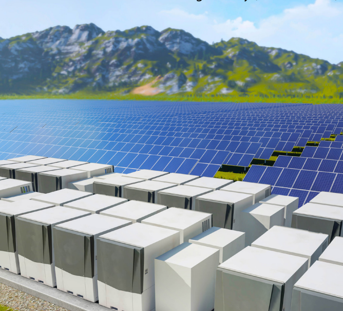
Co-located solar farm and energy storage facility (Primus Power)