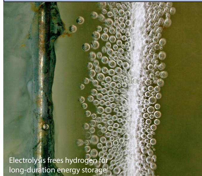
Electrolysis frees hydrogen for long-duration energy storage

We acknowledge fellowships from the Resnick Institute for Sustainability and SoCalGas, and a gift from Gates Ventures LLC to the Carnegie Institution for Science.