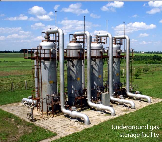
Underground gas storage facility

A 10% reduction in long-duration storage costs would reduce electricity system costs twice as much as would a 10% reduction in battery costs. As a complement to long-duration storage, Li-ion battery storage may be used for less than 10 hours, such as overnight. Costs of charging and discharging, rather than costs of storage facilities, dominate long-duration storage costs. One long-duration energy storage example, power-to-gas-to-power technology with renewable hydrogen gas, would benefit greatly from continued innovations in fuel cells, electrolyzers, and other conversion devices.