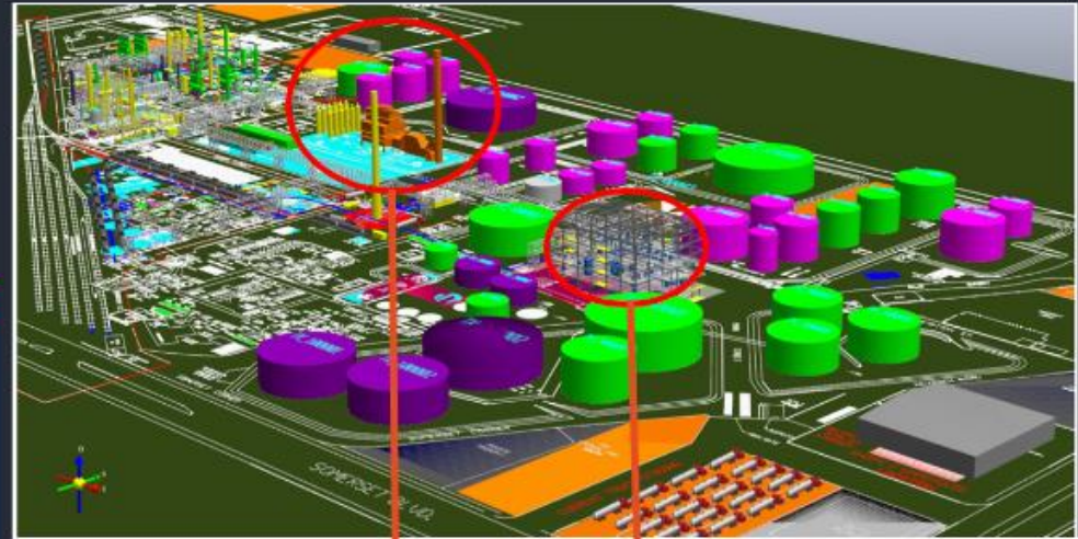
World Energy Conversion Project - Southern California