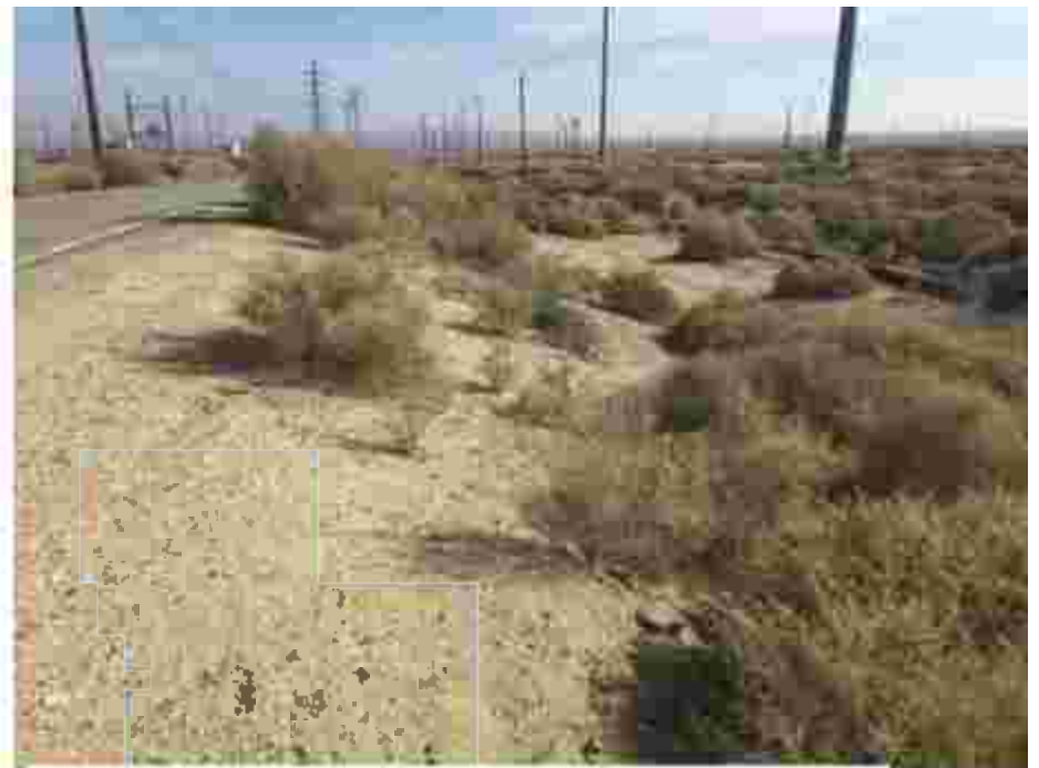
Figure 5: Vegetation community surrounding the outside perimeter of the facility is Valley Saltbush Scrub.