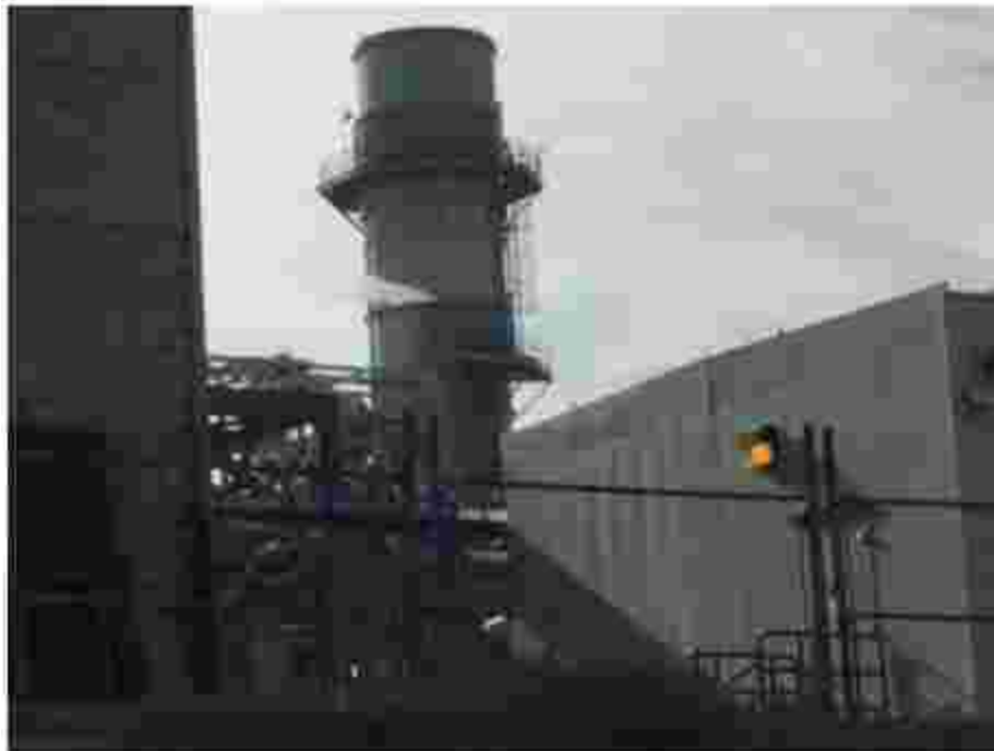
Figure 6: Facility was surveyed for nesting birds utilizing the plant. None were observed at the time of the survey.