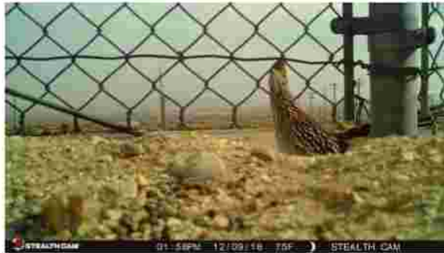
Attachment 2. Wildlife observed from remote sensing cameras.