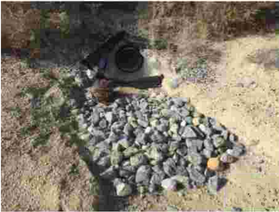
Figure 4: Another preventative measure, metal grates on storm drain culverts.