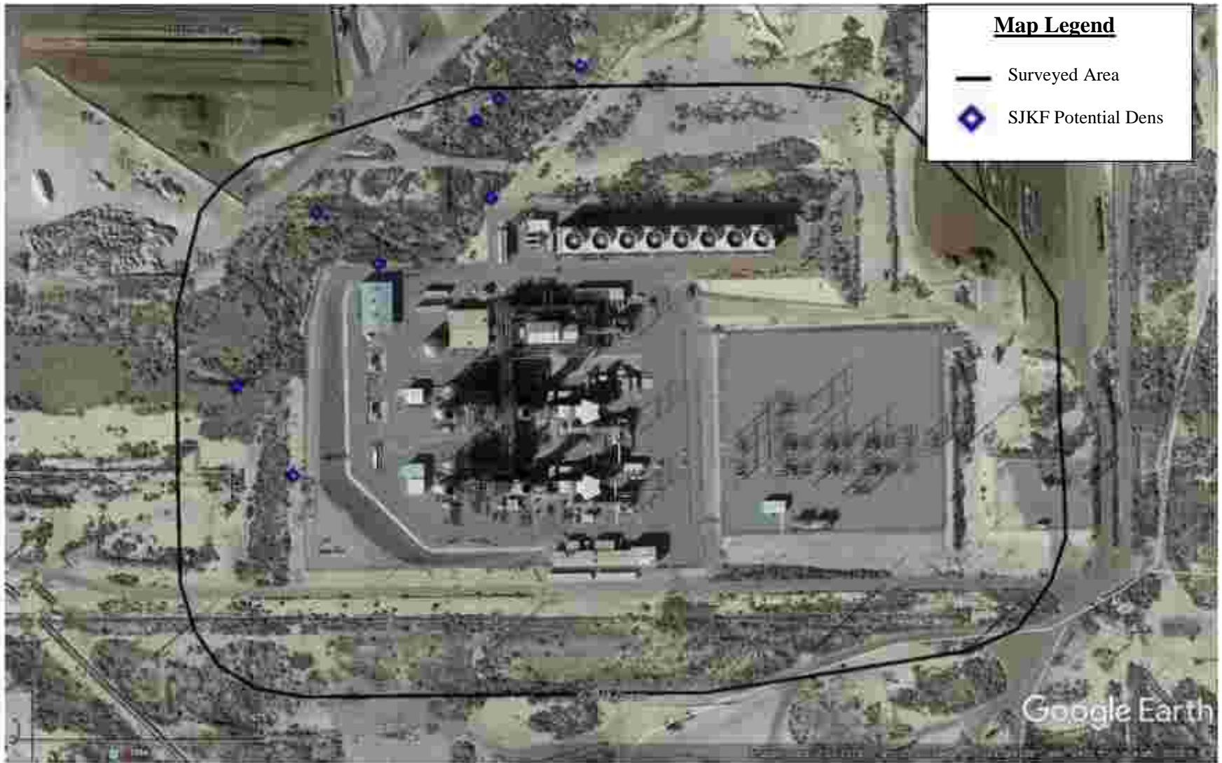
Attachment 1: Sunrise Generating Station Site