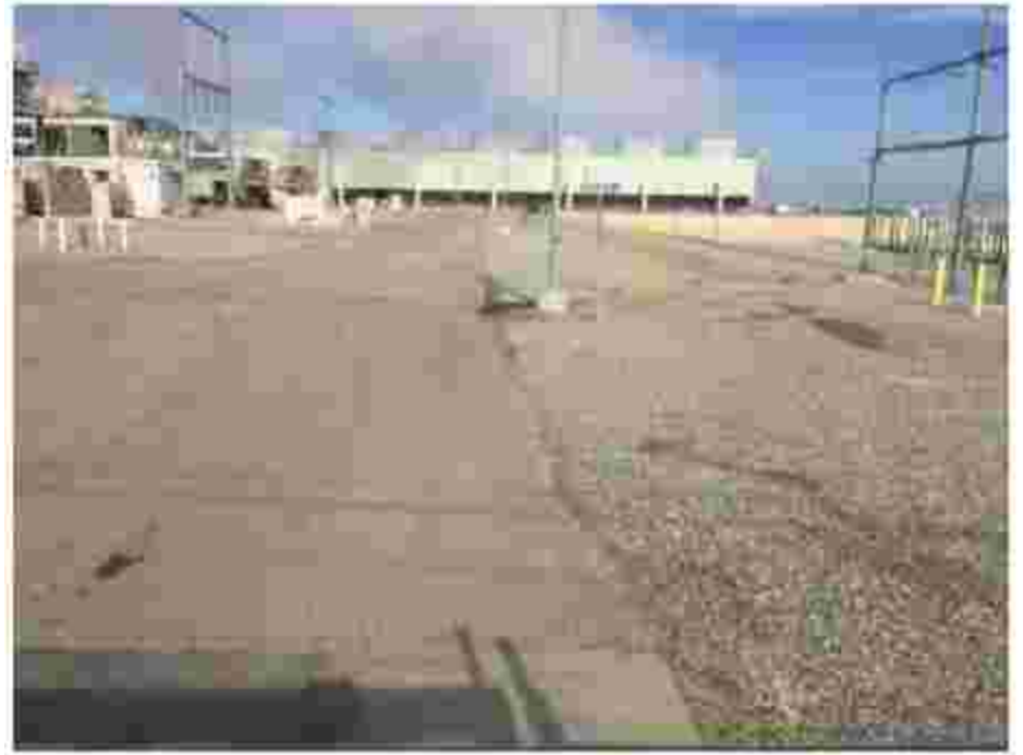
Figure 2: Plant site has been asphalted and graveled. No suitable undeveloped habitat is available on site.