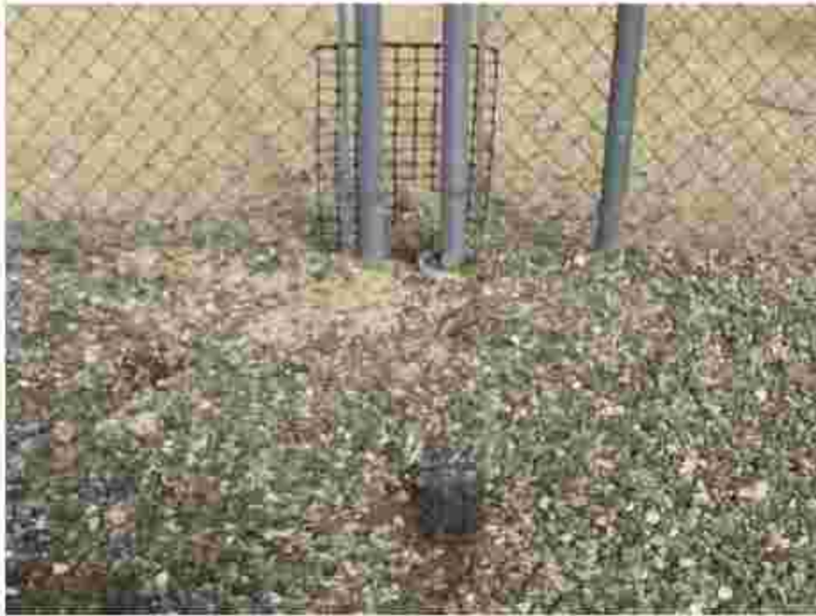
Figure 1: A typical example of a wildlife pass through. Plastic exclusionary mesh was chewed through.