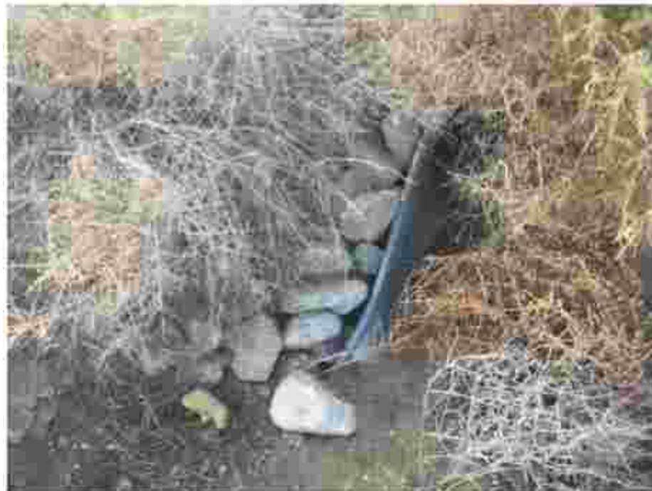
Figure 3: Rock exclusionary measures in storm drain culvert.