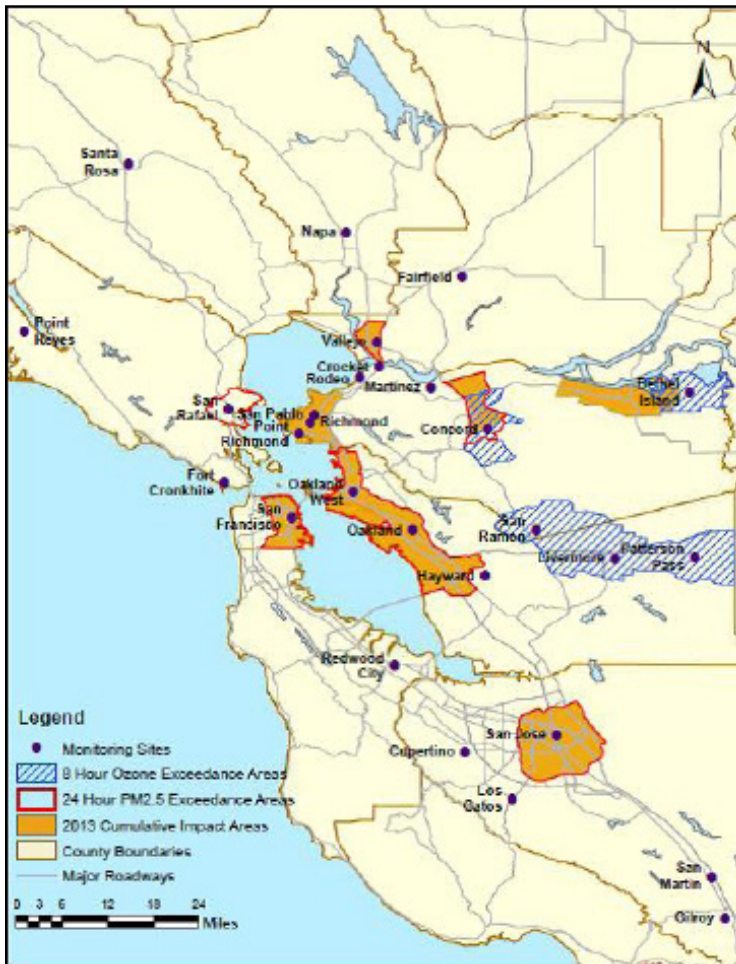
Figure 1: 2013 Impacted Communities

For over sixty years the Air District has been implementing programs to reduce air pollution and public exposure. Air District actions include: conducting air monitoring and modeling to identify locations of elevated pollution concentrations and to assess potential health impacts (see Figure 1); adopting regulations, plans and guidelines to reduce emissions from stationary (i.e. industrial) and mobile (i.e. cars) pollution sources; enforcing existing Air District regulations and the state's mobile source regulations; providing grants and incentives to reduce emissions from mobile sources (targeted in the Bay Area's most impacted communities); and outreach and education to Bay Area residents on air quality issues and trends. These efforts, in combination with the California Air Resources Board's (ARB)