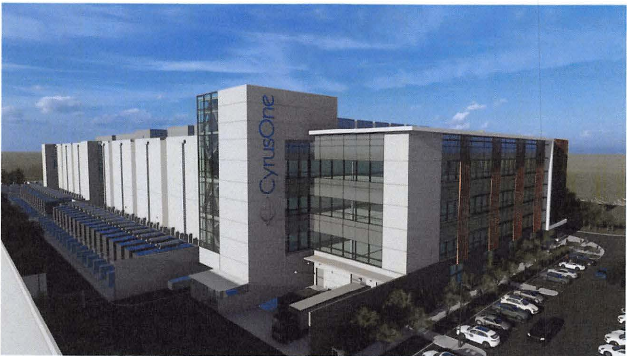
ELEVATED PERSPECTIVE – FROM SOUTH-EAST