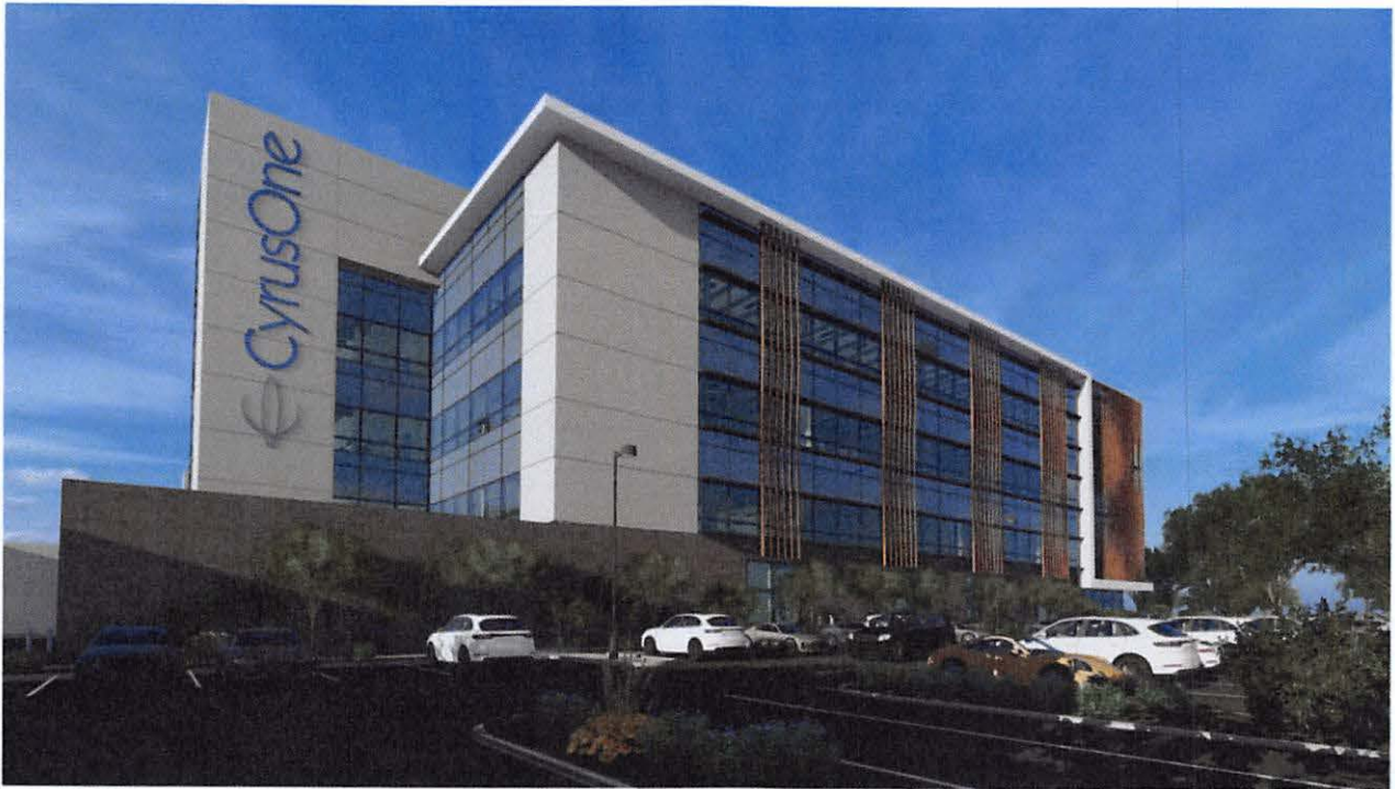
PERSPECTIVE – FROM EAST