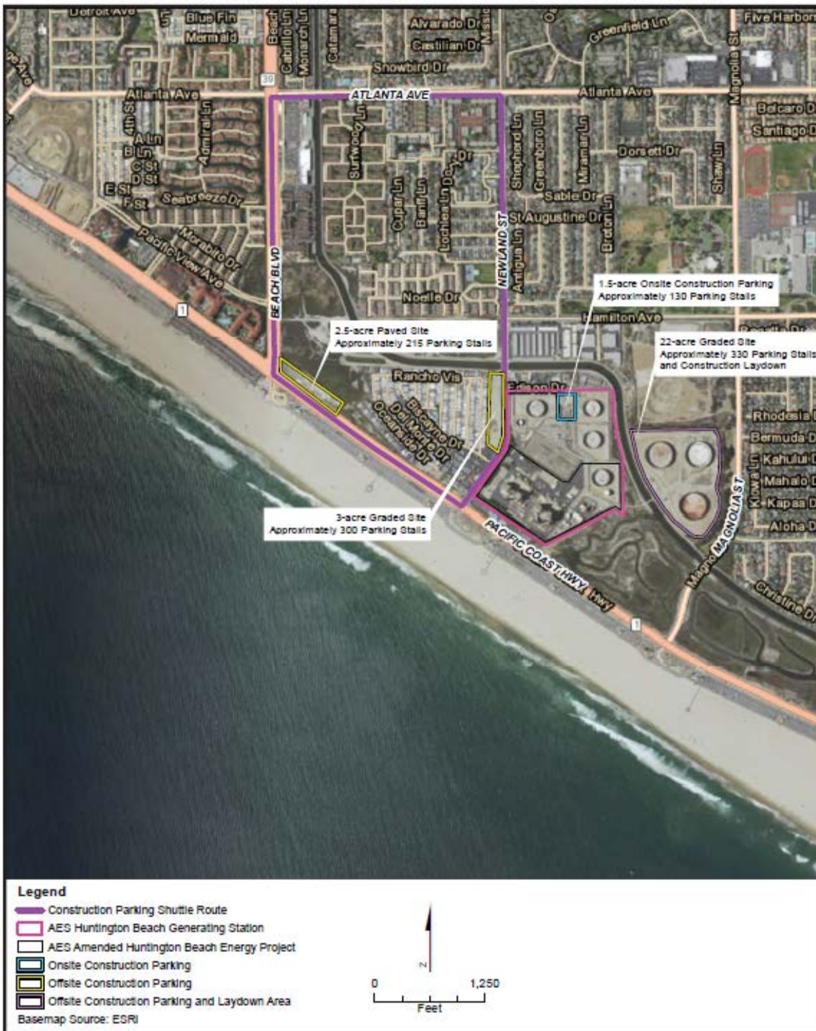
PROJECT DESCRIPTION - FIGURE 1 Amended Huntington Beach Energy Project - Construction / Laydown Parking Areas

CALIFORNIA ENERGY COMMISSION - SITING, TRANSMISSION AND ENVIRONMENTAL PROTECTION DIVISION