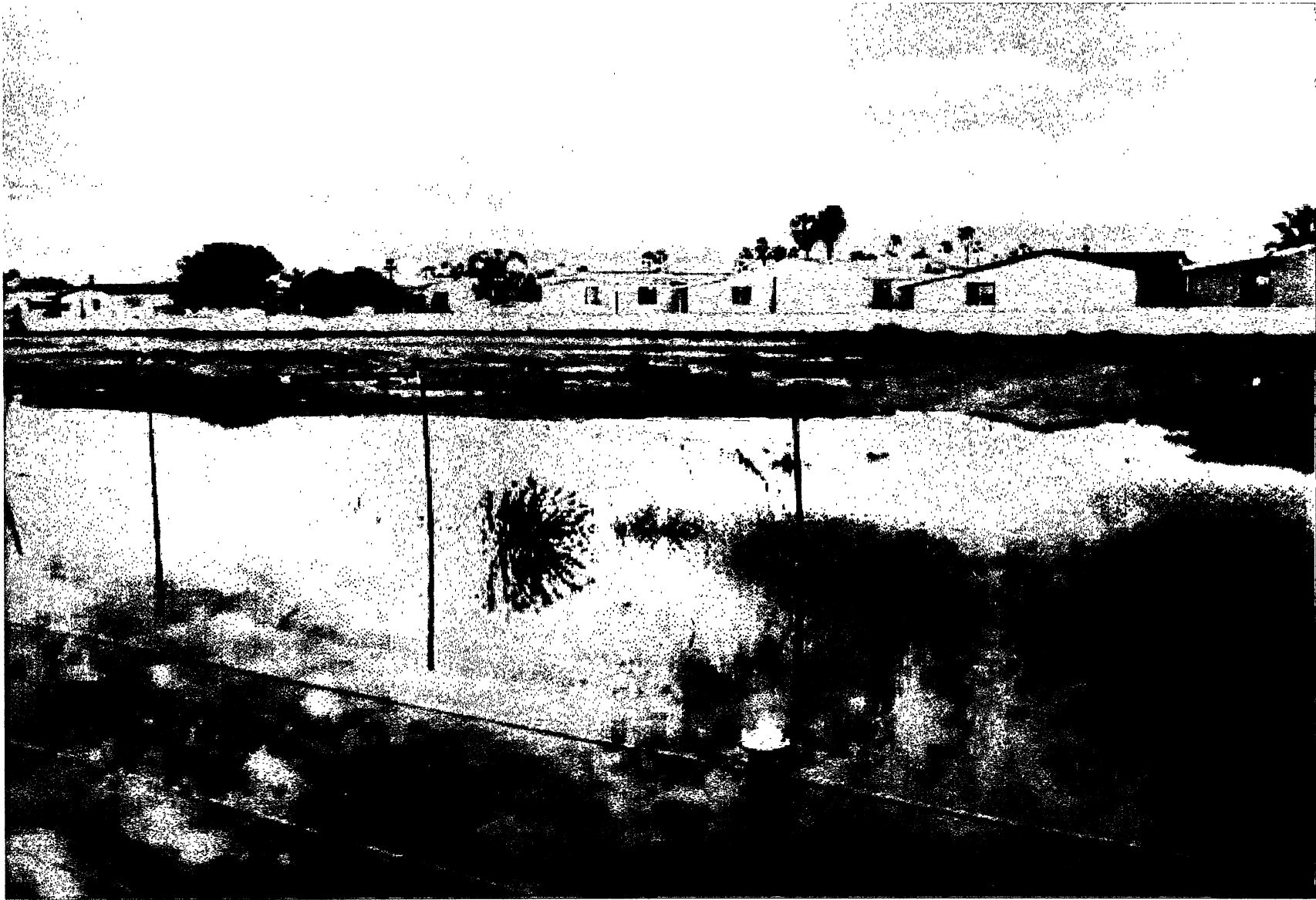
MILLS NEWLAND PROPERTY - WETLAND VEGETATION 02/06/2010 EXHIBIT F