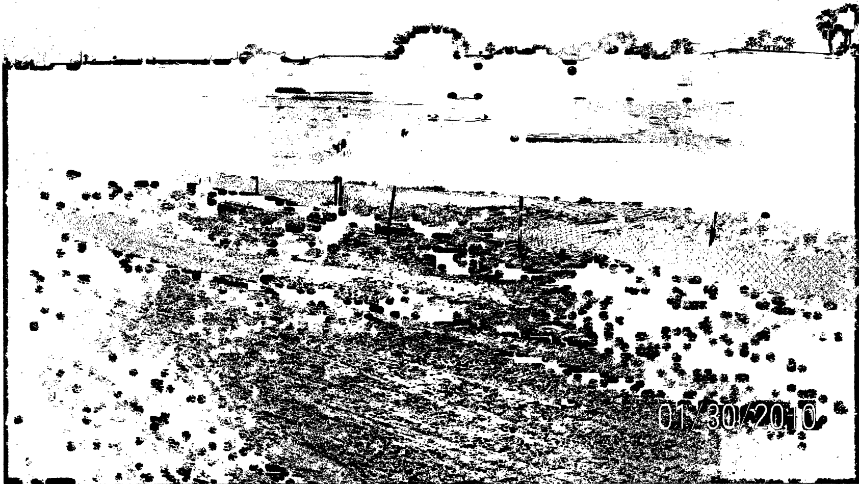
MILLS NEWLAND PROPERTY - WETLAND VEGETATION 01/30/2010 - NOTICE PONDING - LAST RAINFALL 01/23/2010 EXHIBIT D