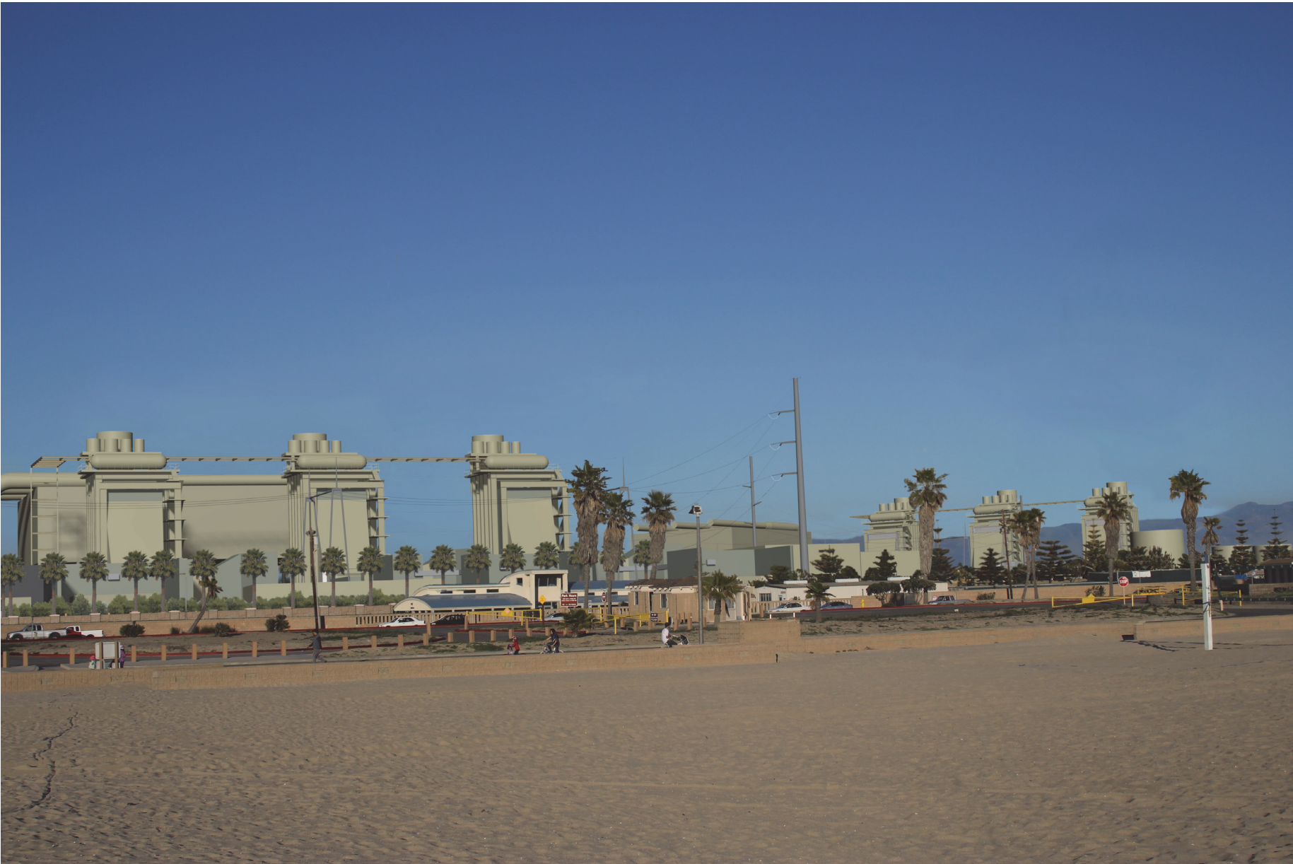
B. Simulated view depicting appearance five years after completion of project development