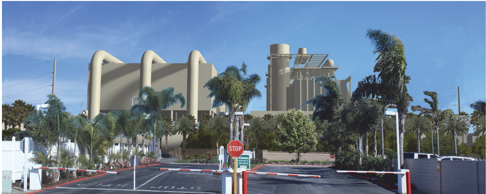
B. Simulated view depicting appearance five years after completion of project development