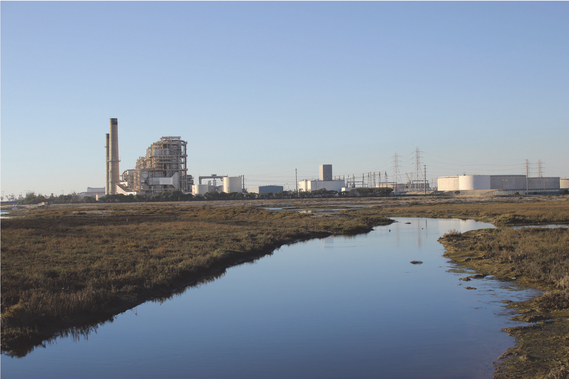
A. Existing View