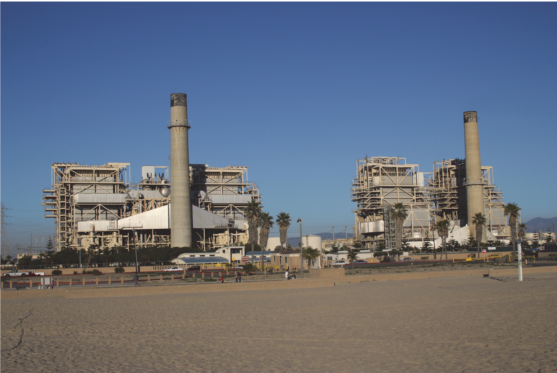
A. Existing View