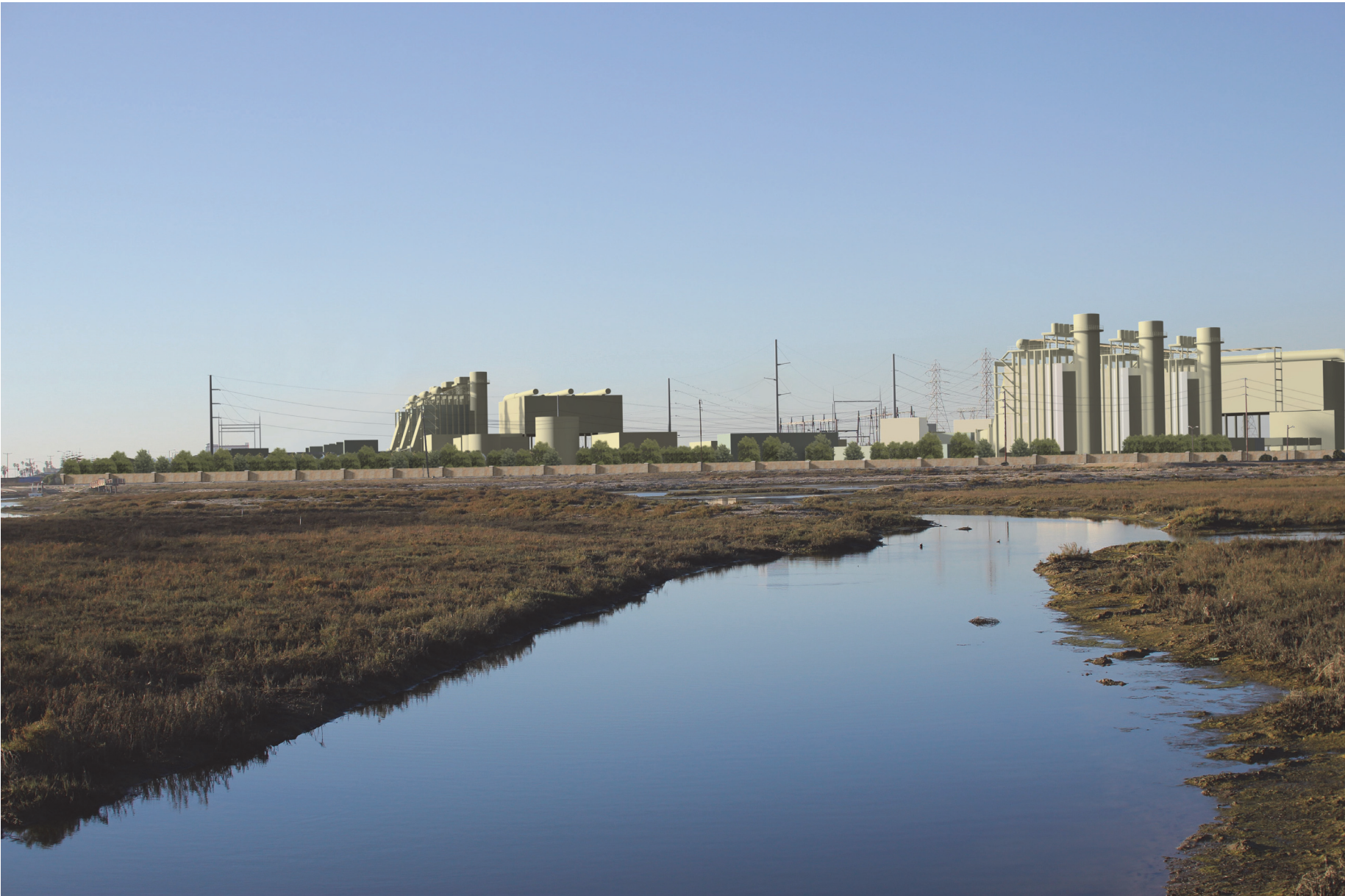
B. Simulated view depicting appearance five years after completion of project development