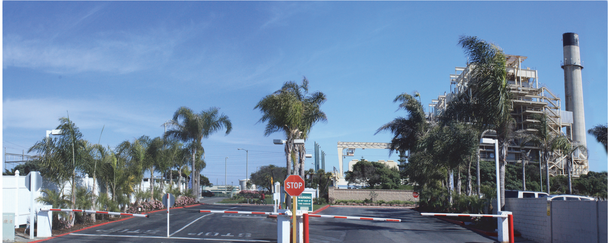
A. Existing View