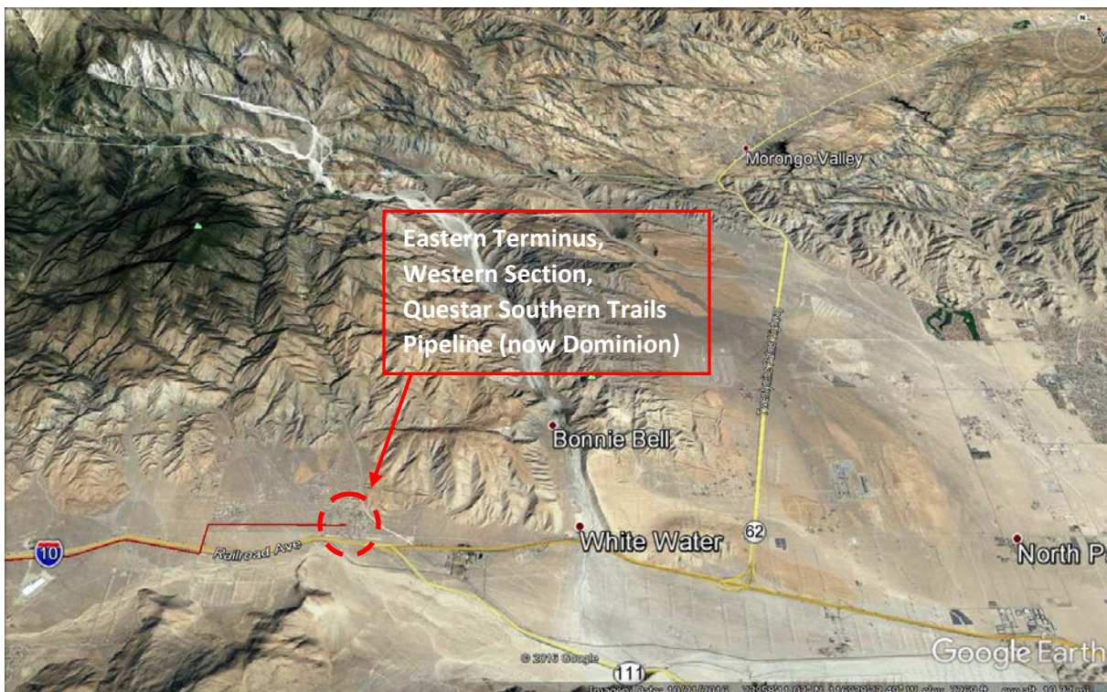
Figure 1. Eastern terminus, 16" Questar pipeline west of Palm Springs, near junction of I-10 and state highway 62

"Hydrogen" is languishing in obscurity behind the rush to BEV's as "transportation electrification". The Hydrogen industry needs a prudent, visible, medium-to-large-scale project as a pioneering "beacon" to demonstrate Hydrogen's long-term advantages as a complete, integrated, optimized, renewable energy system and strategy, to recapture our imagination for the deep-decarbonization task ahead. This might be it. I have no economic interest in this potential opportunity.