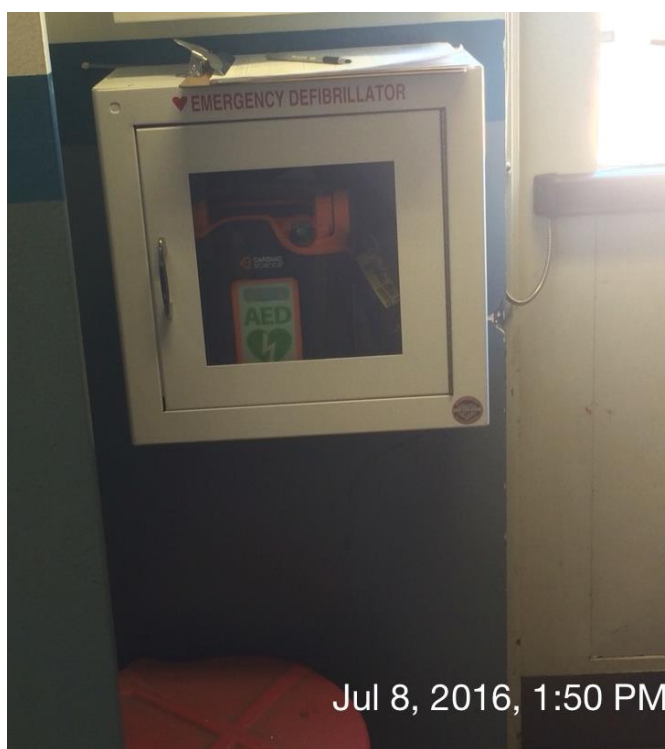
AED Located in Unit 1 and 2 Control Room

The following 3 AED's are located on the AES Huntington Beach Facility and were available for use during the month of June