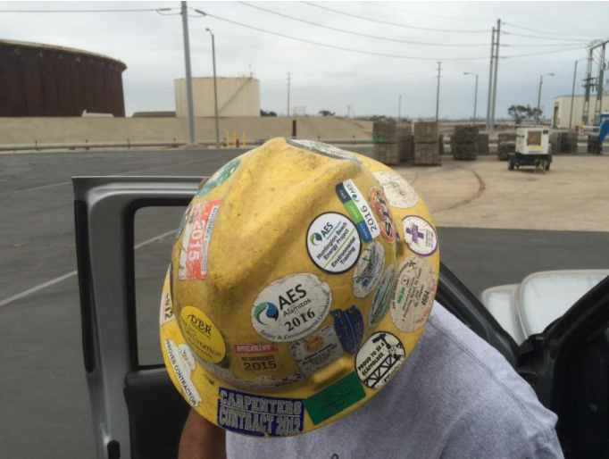
Billy Landaverde - Safeway