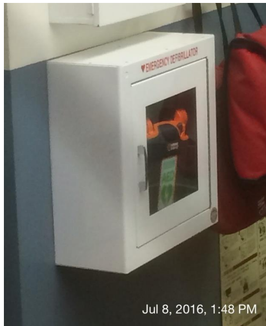
Unit 3 and 4 Control Room