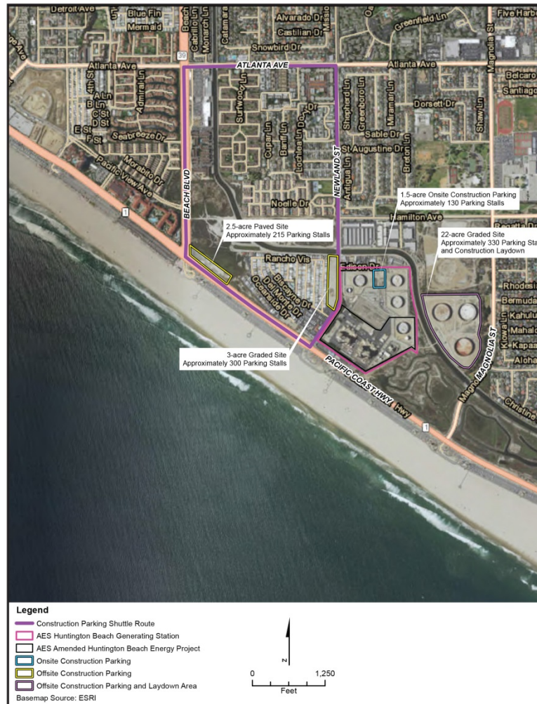
PROJECT DESCRIPTION - FIGURE 2 Amended Huntington Beach Energy Project - Construction / Laydown Parking Areas

CALIFORNIA ENERGY COMMISSION - SITING, TRANSMISSION AND ENVIRONMENTAL PROTECTION DIVISION SOURCE: CH2M - Figure 2.3-3 (Rev 1)