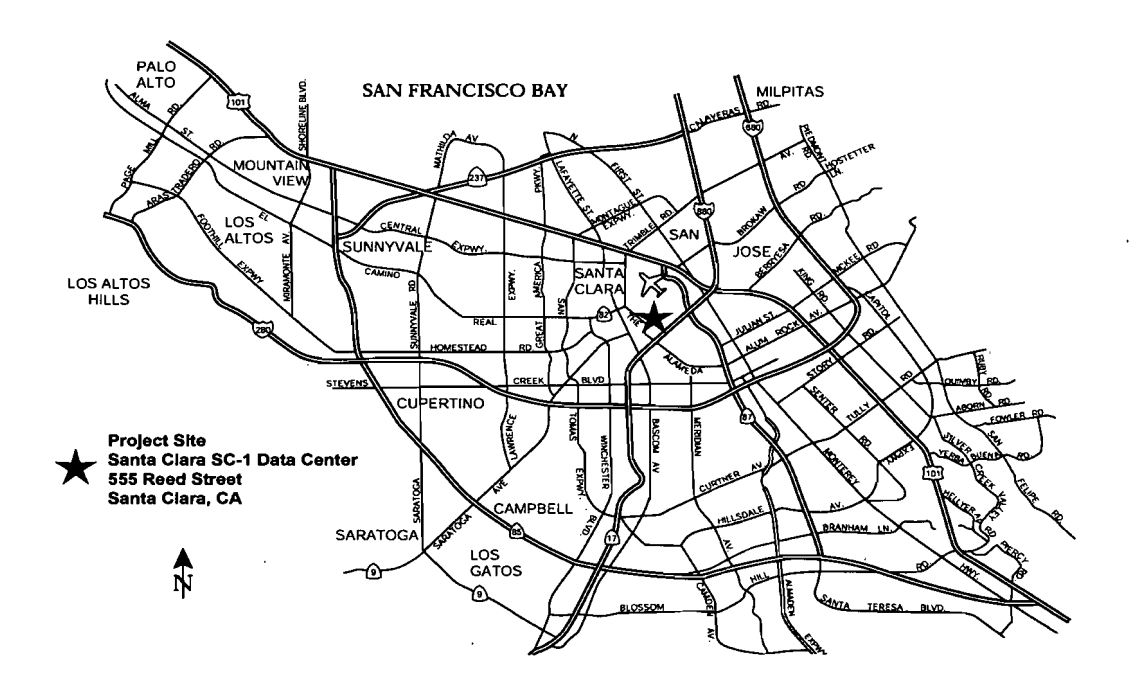
Santa Clara SC-1 Data Center Notice of Intent to File a Negative Declaration Page 4