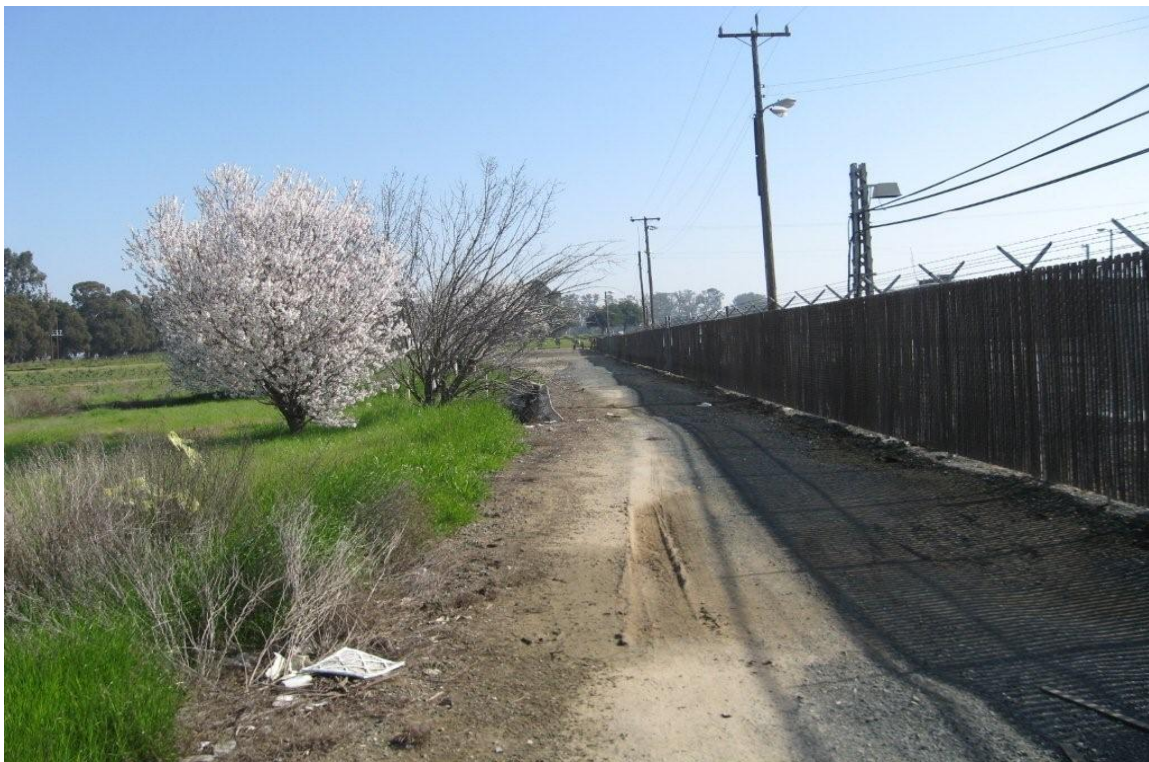
Almond trees to be removed along future project access road, 2/17/10.