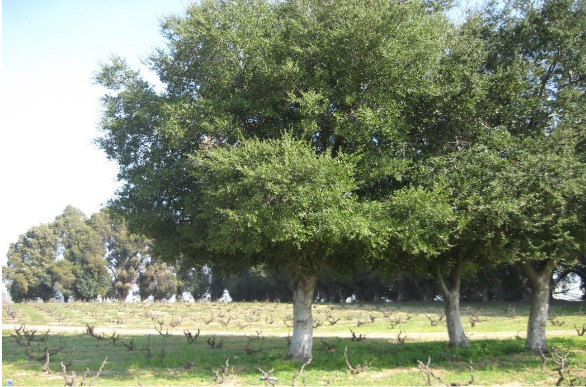
Photo of 3 of the 6 Interior Live Oaks to be removed in ACC area, 2/17/10.