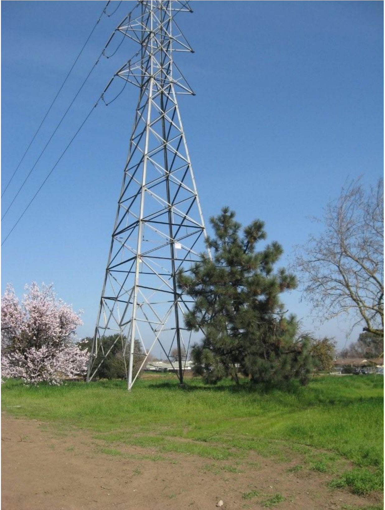
Tower #7 with Ponderosa Pine and Almond tree that will be removed, 2/17/10