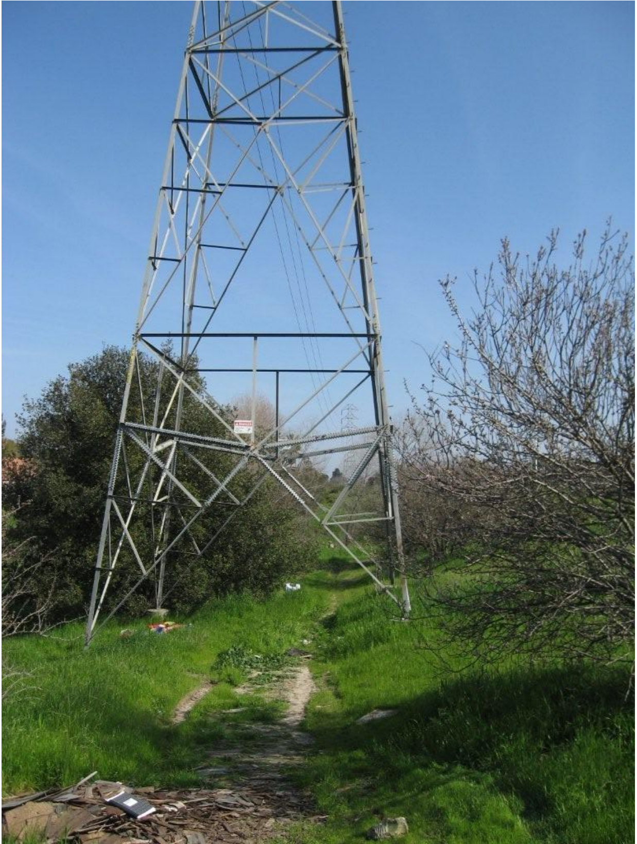
Tower #16 with Interior Live Oak to be removed, 2/17/10