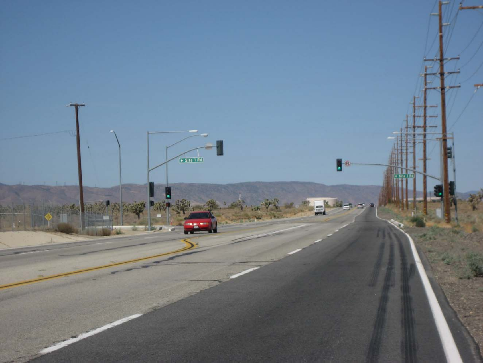
View from KOP-1 Looking West Along E. Avenue M Toward PHPP – Existing Conditions