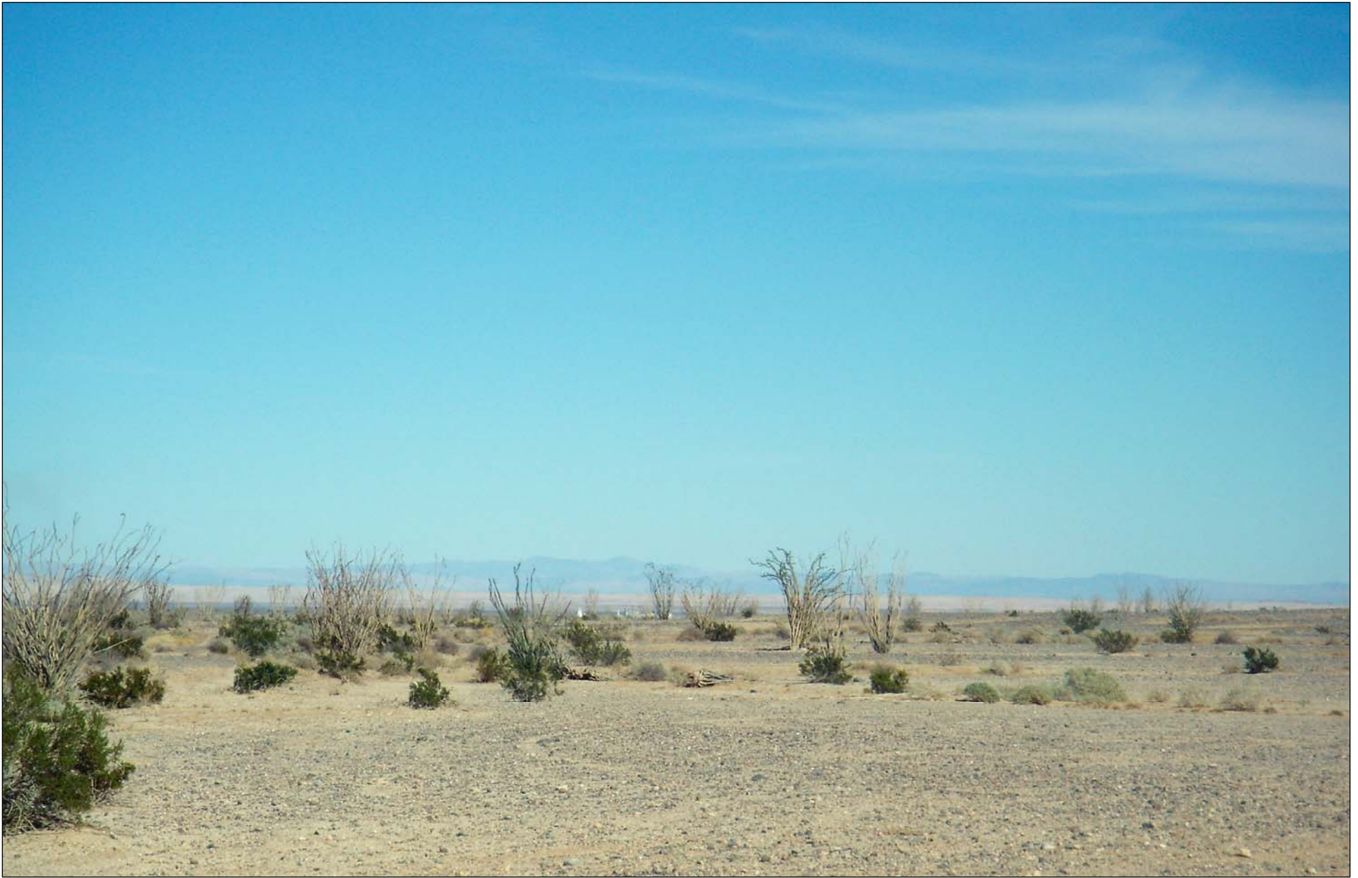
KOP 2: Existing view from Yuha Geoglyph Monument along De Anza Trail (approximately 2.5 miles south of Project).