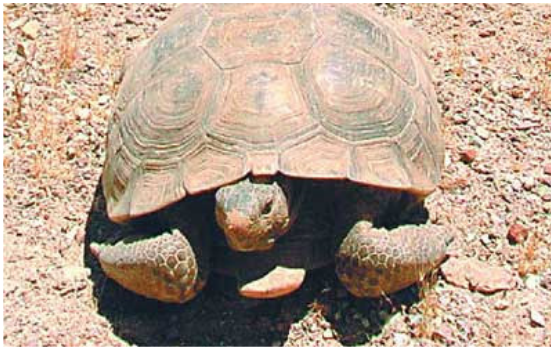
Biologists expected the whole solar site to have some 32 tortoises, but 17 have already been found one just one small portion of the land.