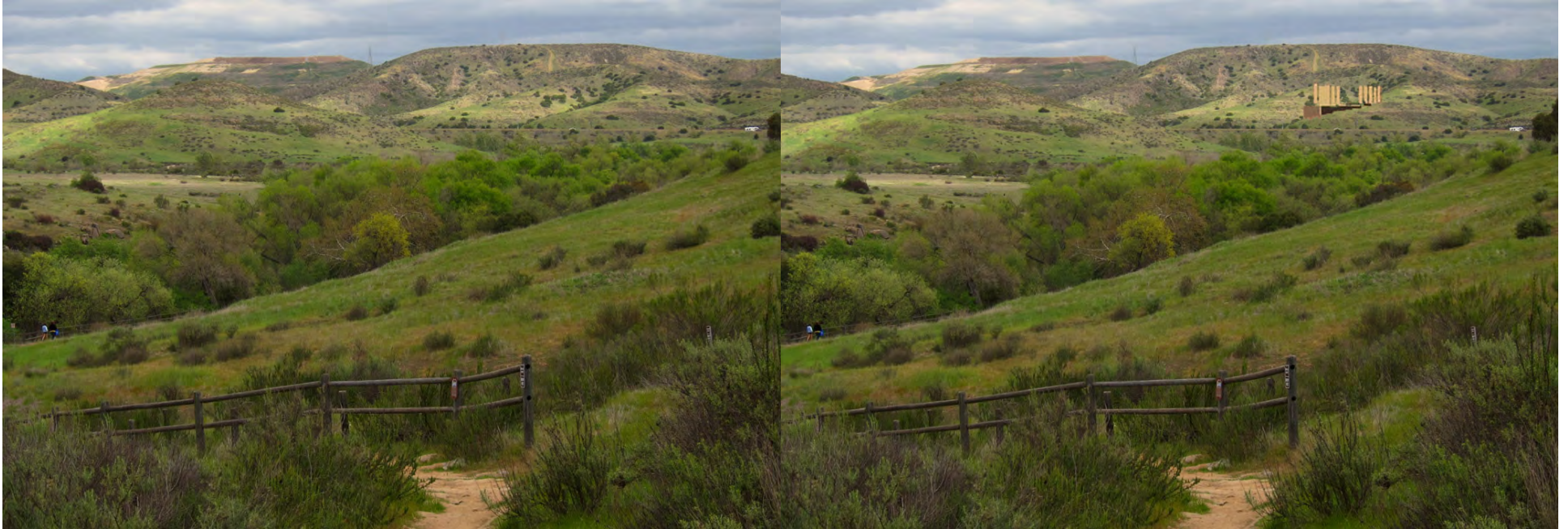
Elevated View, Photo 4205: along Kwaay Paay trail, near Mission Dam trailhead (current view on left, view with simulated plant on right)