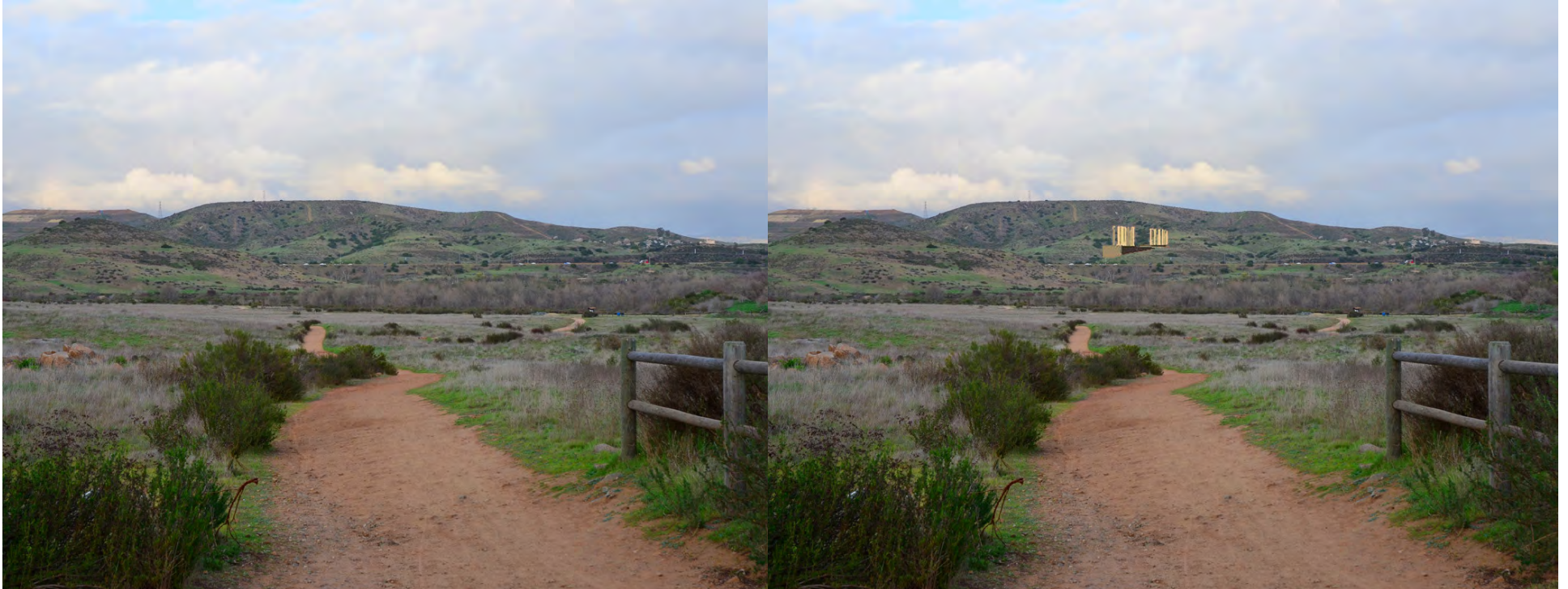
Grasslands Area , Photo 2606, direct-line of sight view of the plant along nearly this entire section of the grasslands loop trail

(current view on left, view with simulated plant on right)