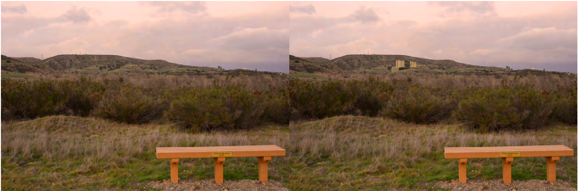
Grasslands Area , Photo 2620, park bench; direct view across San Diego River to the plant (current view on left, view with simulated plant on right)