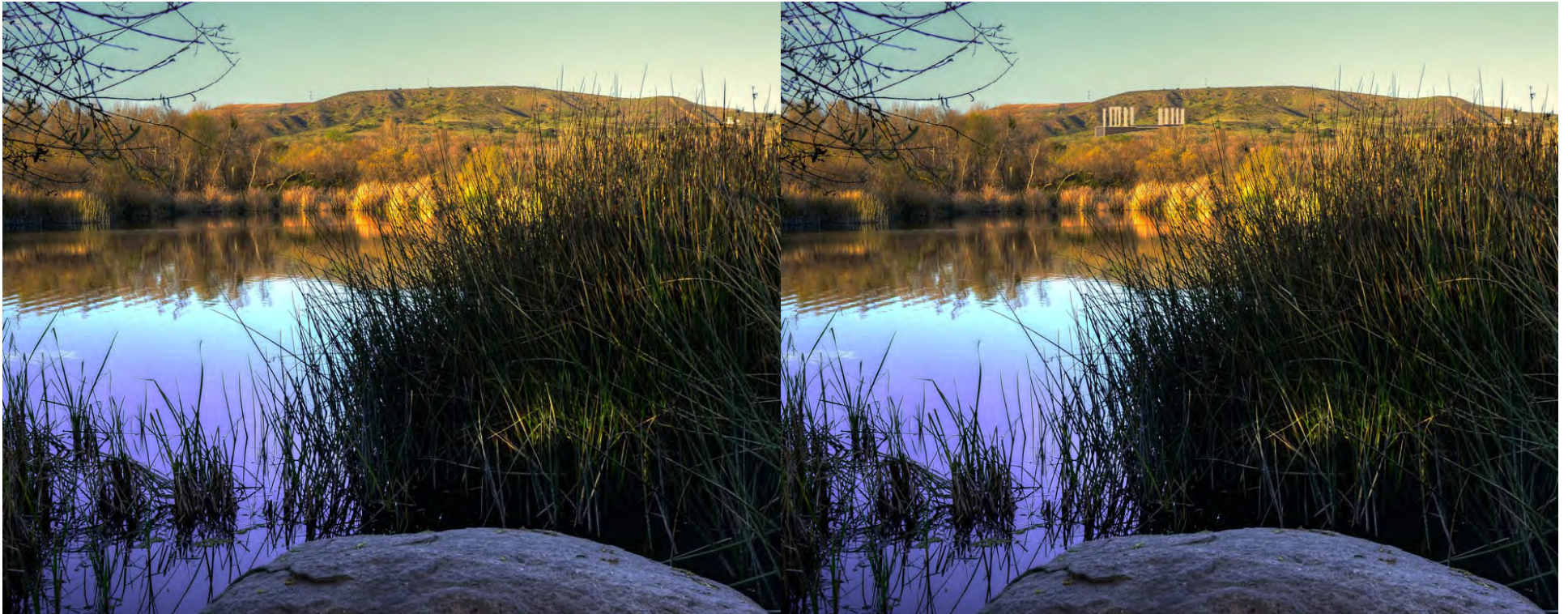
Campground and Kumeyaay Lake Area, Photo 2565: Kumeyaay Nature Trail, view from a park bench across the lake would have direct line of sight to the plant (see next photo of bench location)

(current view on left, view with simulated plant on right)