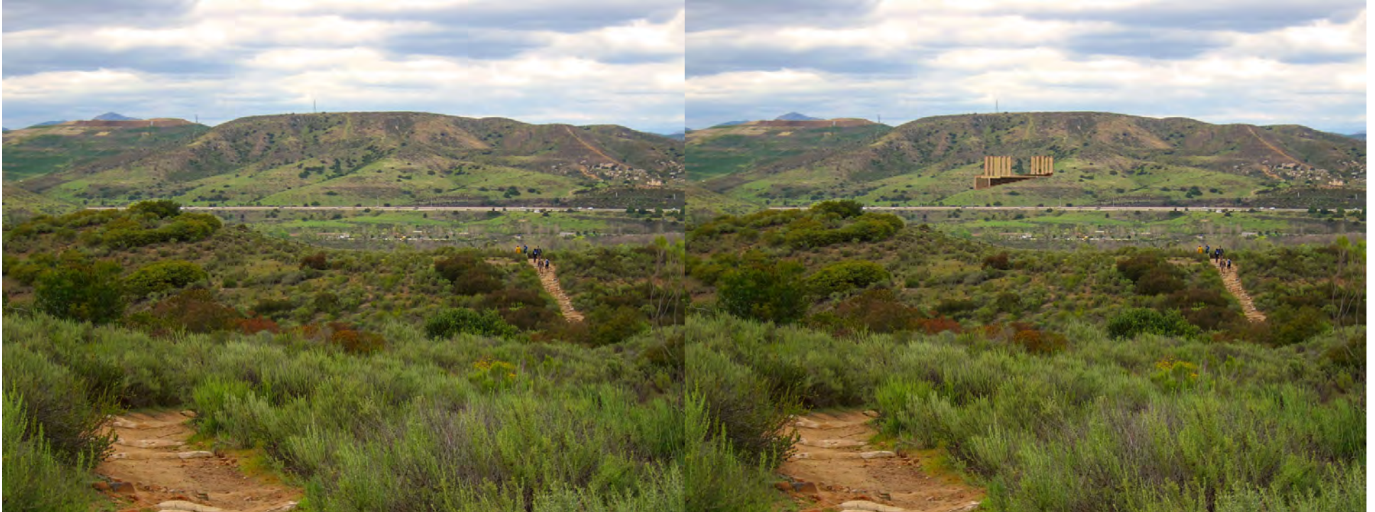
Elevated View, Photo 4209: along Kwaay Paay trail, junction of two trails (note hikers; they are about at photo location 2547)

(current view on left, view with simulated plant on right)