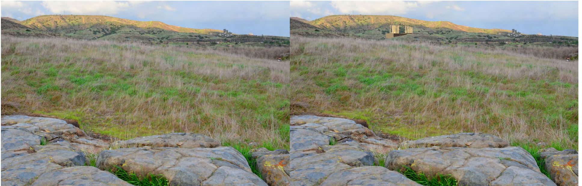
Grasslands Area, Photo 2604, view from Kumeyaay Grinding Stones; the plant will be clearly visible from this historical site

(current view on left, view with simulated plant on right)