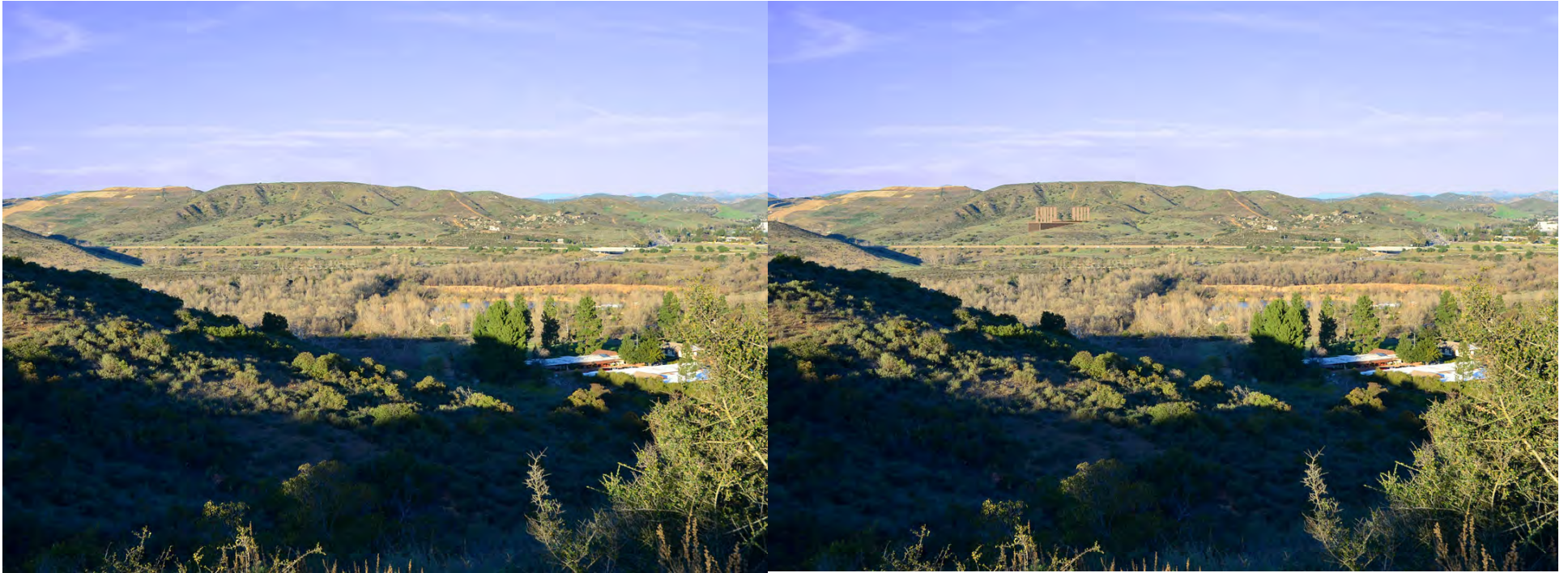
Elevated View, Photo 2534: along Kwaay Paay trail (current view on left, view with simulated plant on right)