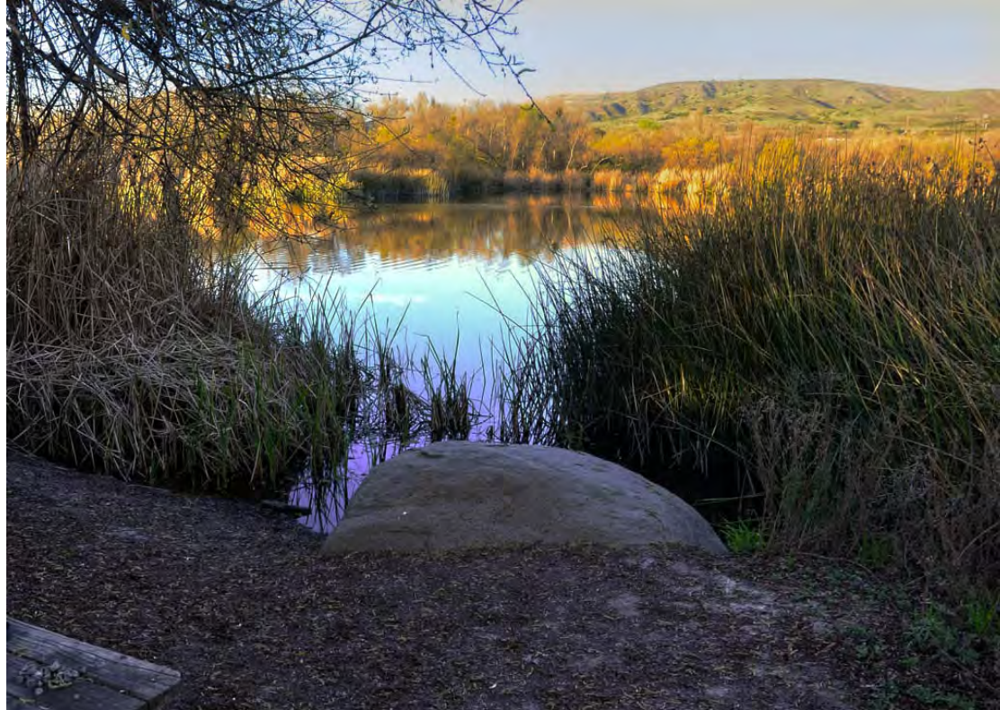
Campground and Kumeyaay Lake Area, Photo 2566: Kumeyaay Nature Trail, companion photo to 2565, showing park bench lower left; direct line of sight to the plant