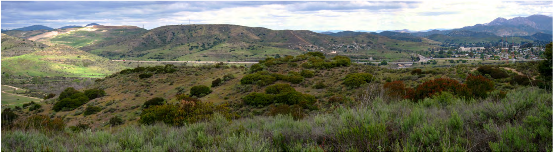
Elevated View, Photo 4189-92 panorama, along Kwaay Paay trail (current view; see next slide for simulated plant)