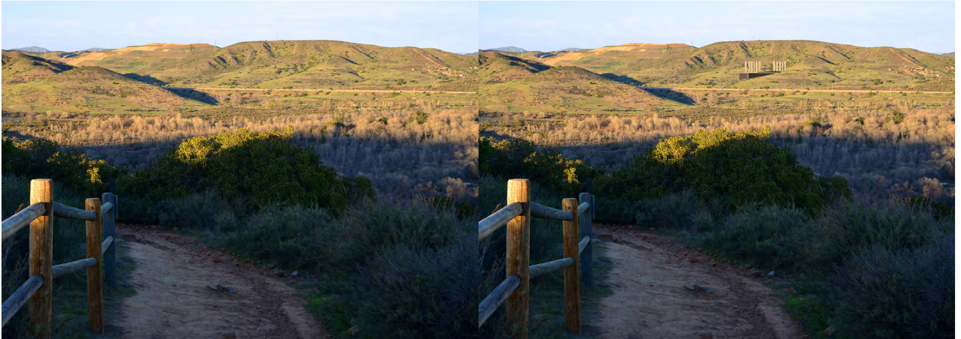
Elevated View, Photo 2550: along Kwaay Paay trail (current view on left, view with simulated plant on right)