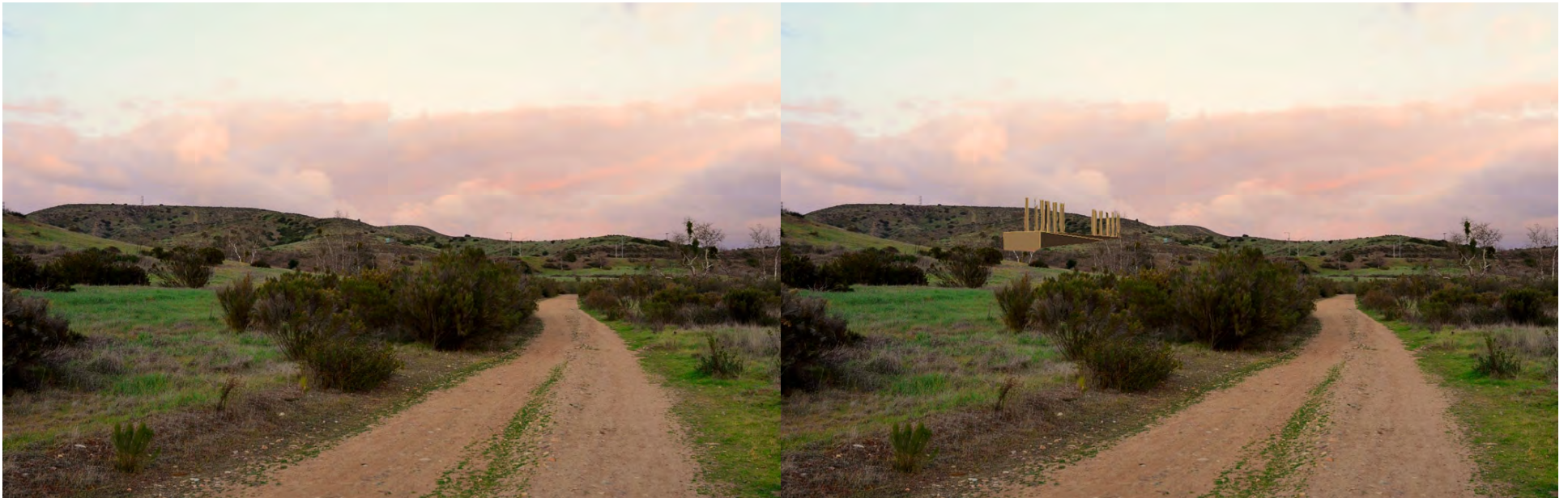
Near Equestrian Staging Area , Photo 2615 (current view on left, view with simulated plant on right)