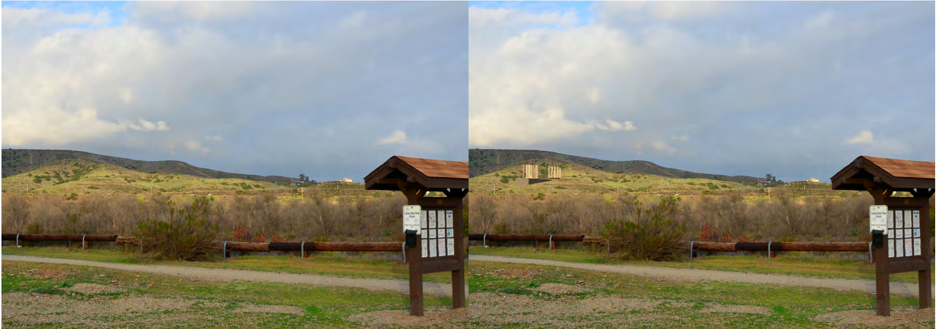
Grasslands Area , Photo 2602, park information panel (current view on left, view with simulated plant on right)