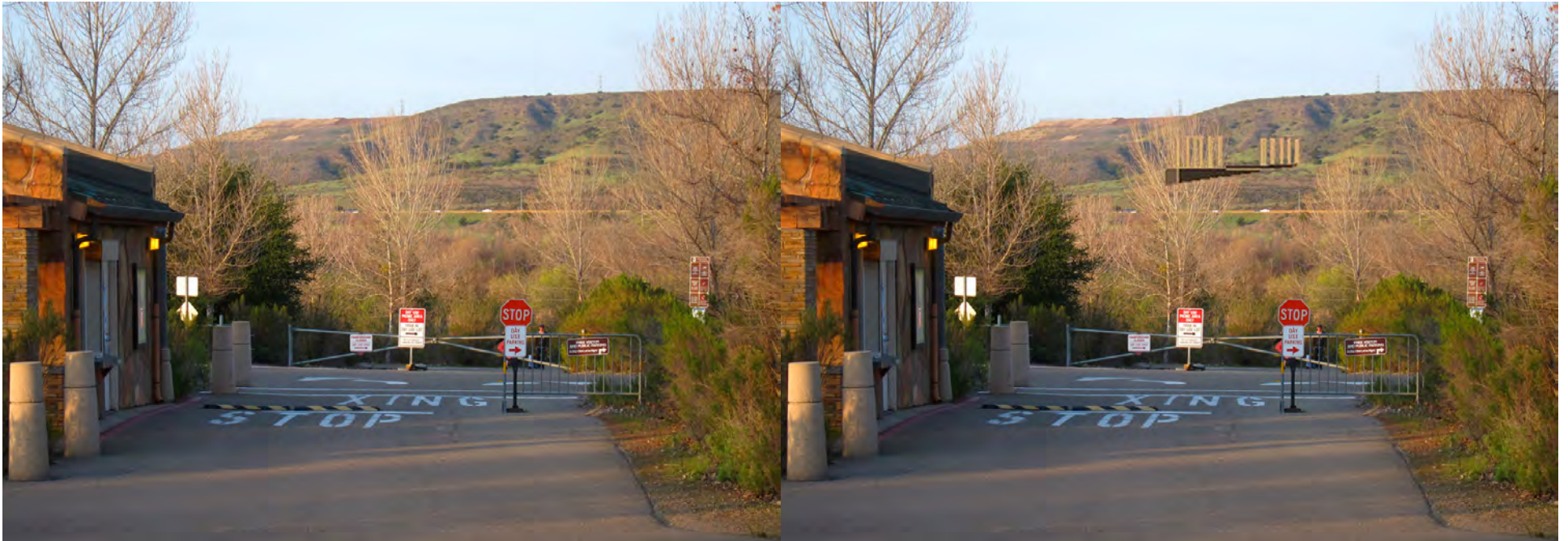
Campground and Kumeyaay Lake Area, Photo 4073: entrance station; direct line of sight to the plant for all visitors entering this area (it is noted that from this perspective the plant would be partly covered by a small tree)

(current view on left, view with simulated plant on right)