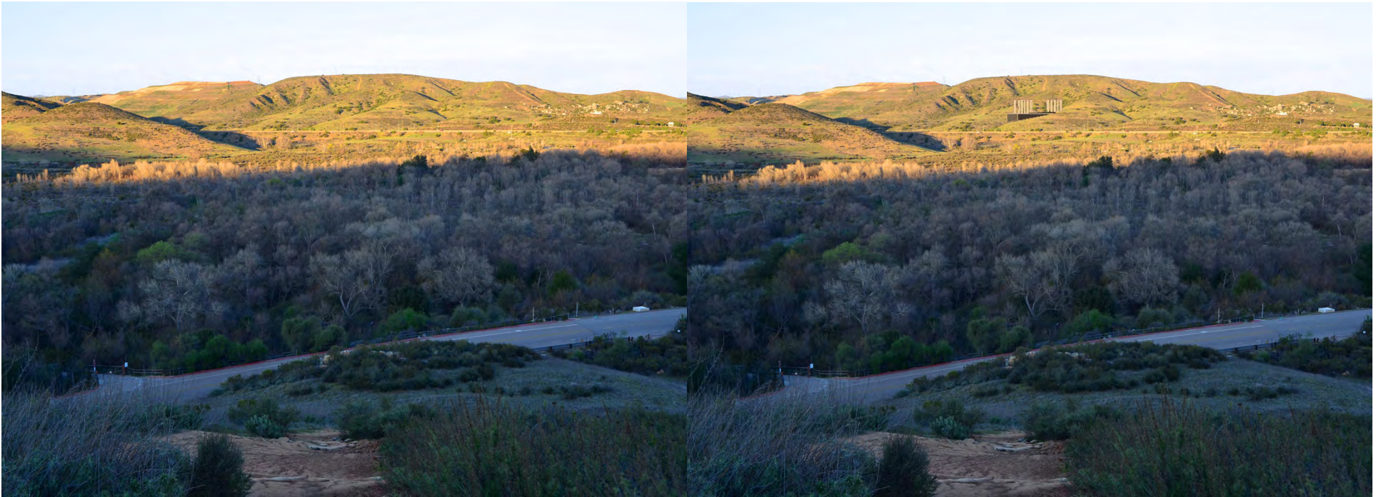
Elevated View, Photo 2554: along Kwaay Paay trail, near Bushy Hill trailhead (current view on left, view with simulated plant on right)