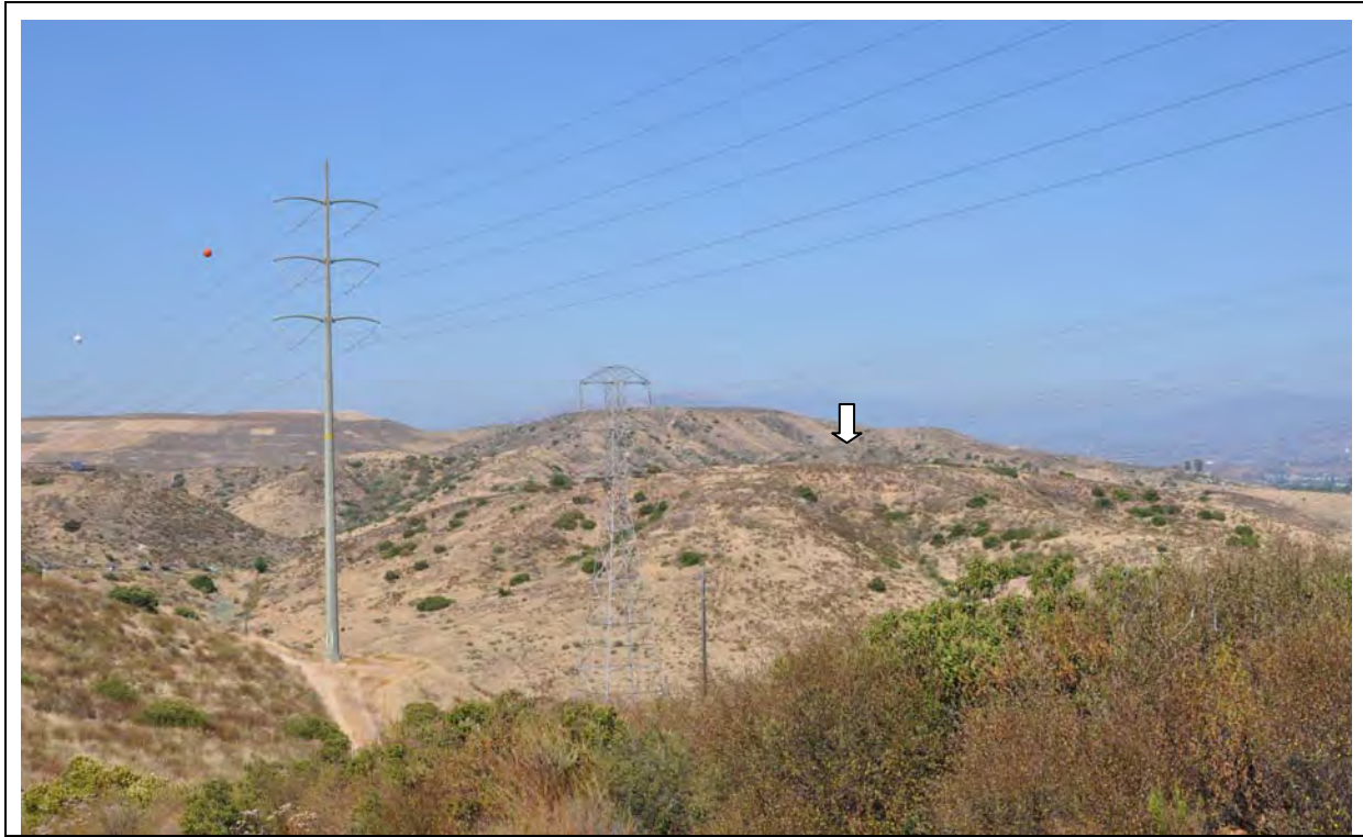
FIGURE 4.5-9 Viewpoint 7: MTRP, Fortuna Mountain Existing Conditions (looking east)