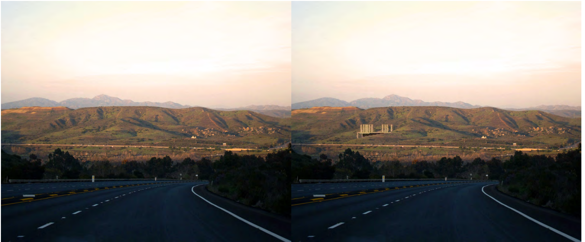
Major travel route, Photo 4053: Mission Gorge Road is one of two major east/west routes into Santee. The plant would be obvious to commuters on this road with a direct line of sight (current view on left, view with simulated plant on right)