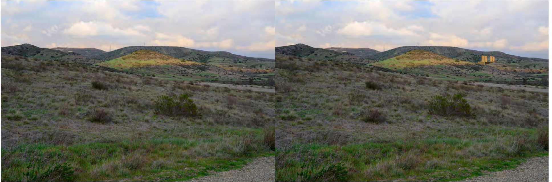
Grasslands Area , Photo 2608, at least a partial plant view (current view on left, view with simulated plant on right)