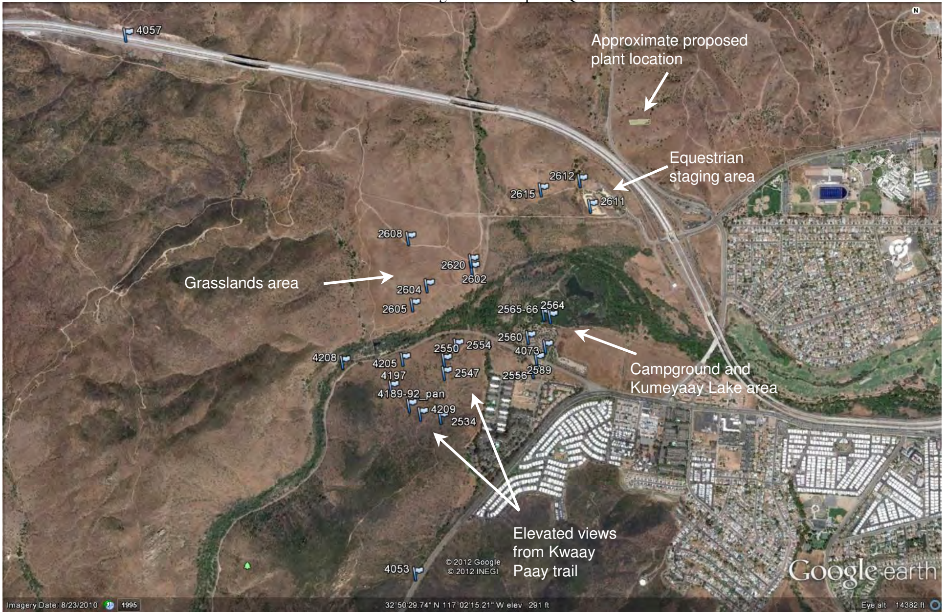
Photo Locations from MTRP Looking Toward Proposed Quail Brush Power Plant