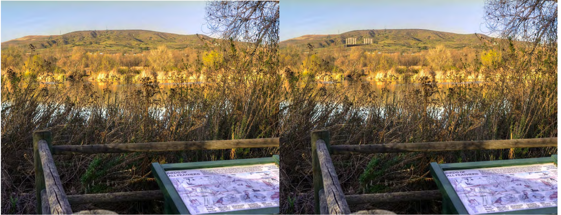
Campground and Kumeyaay Lake Area, Photo 2564: Kumeyaay Nature Trail; direct line of sight to the plant across the lake from information panel. This lake and trail is noted as being a “favorite with birders” on the MTRP website (this wide-angle image makes the plant appear smaller than it actually would appear)

(current view on left, view with simulated plant on right)