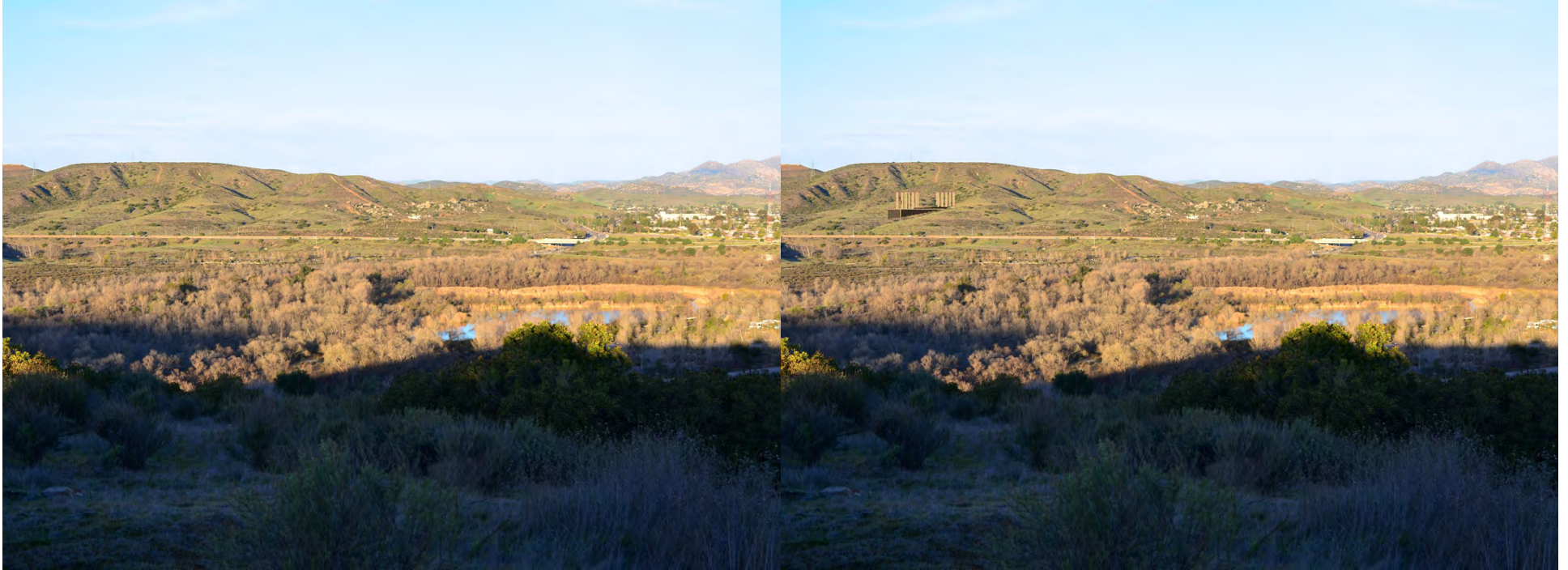
Elevated View, Photo 2547: along Kwaay Paay trail, Kumeyaay Lake visible center right (current view on left, view with simulated plant on right)