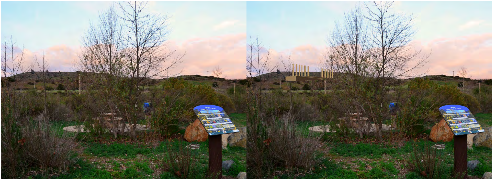
Equestrian (multi-use) staging area Photo 2612: picnic area and park information panels; the plant will be clearly visible from picnic tables

(current view on left, view with simulated plant on right)