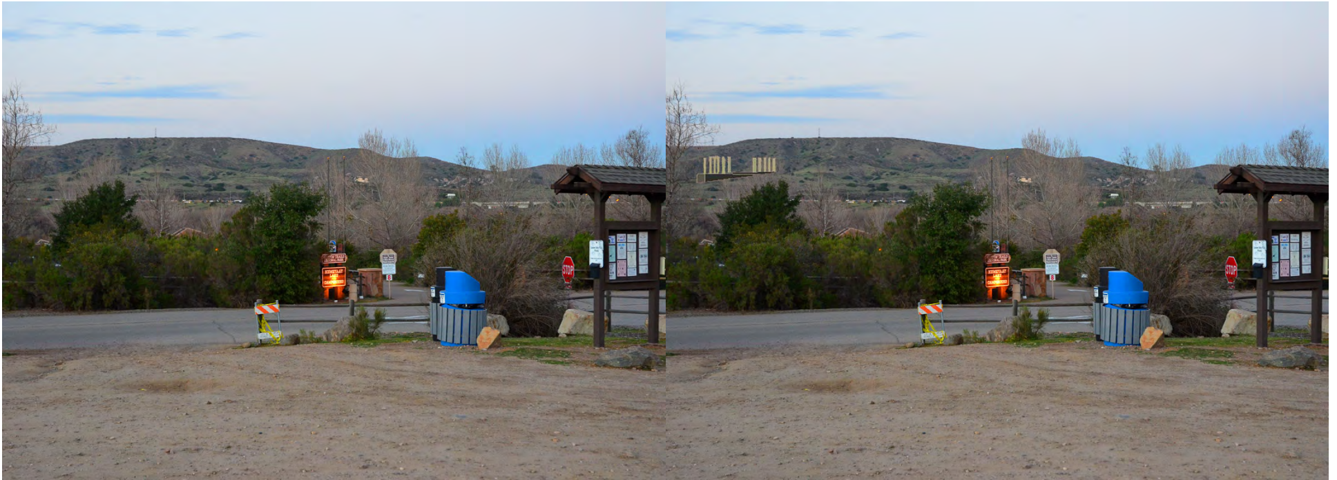
Campground and Kumeyaay Lake Area, Photo 2589: parking area and park information panel (current view on left, view with simulated plant on right)