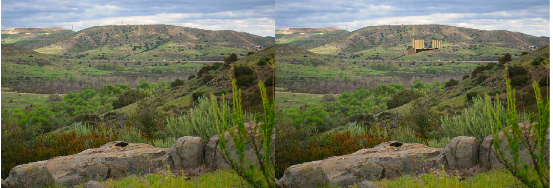
Elevated View, Photo 4197: along Kwaay Paay trail (current view on left, view with simulated plant on right)