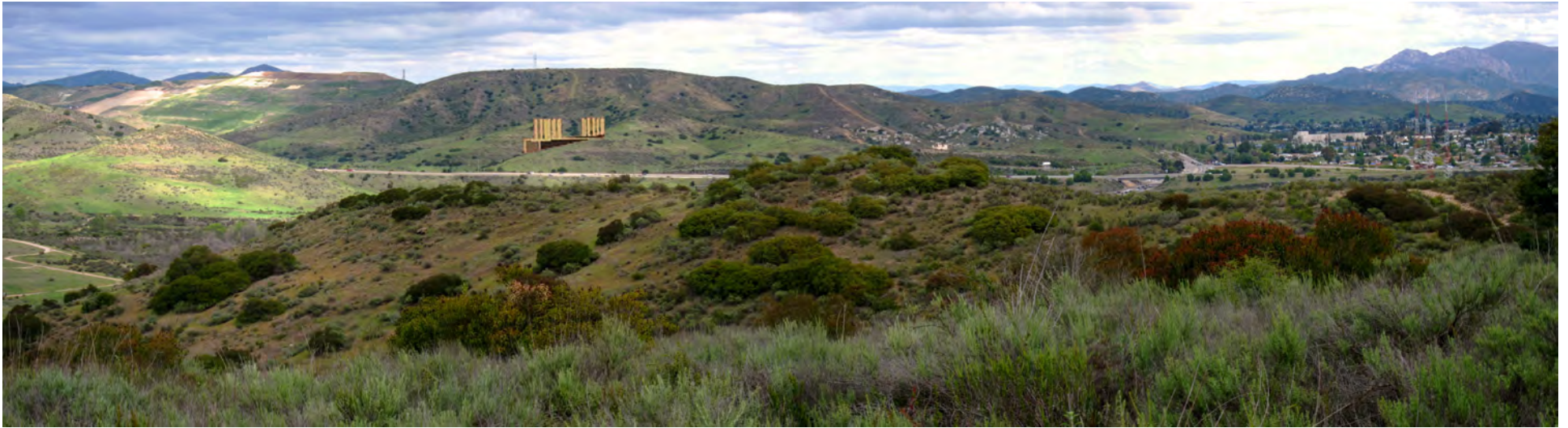
Elevated View, Photo 4189-92 panorama, along Kwaay Paay trail (view with simulated plant)