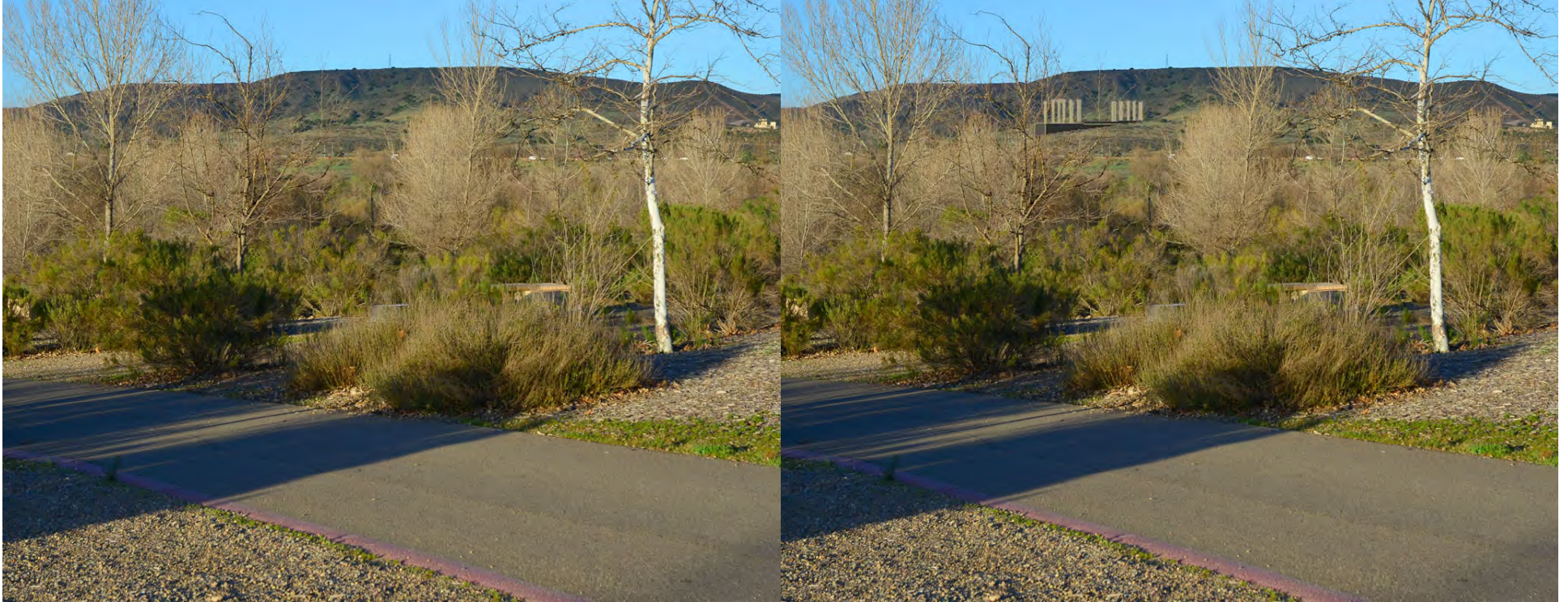
Campground and Kumeyaay Lake Area, Photo 2560: view from a campsite (current view on left, view with simulated plant on right)