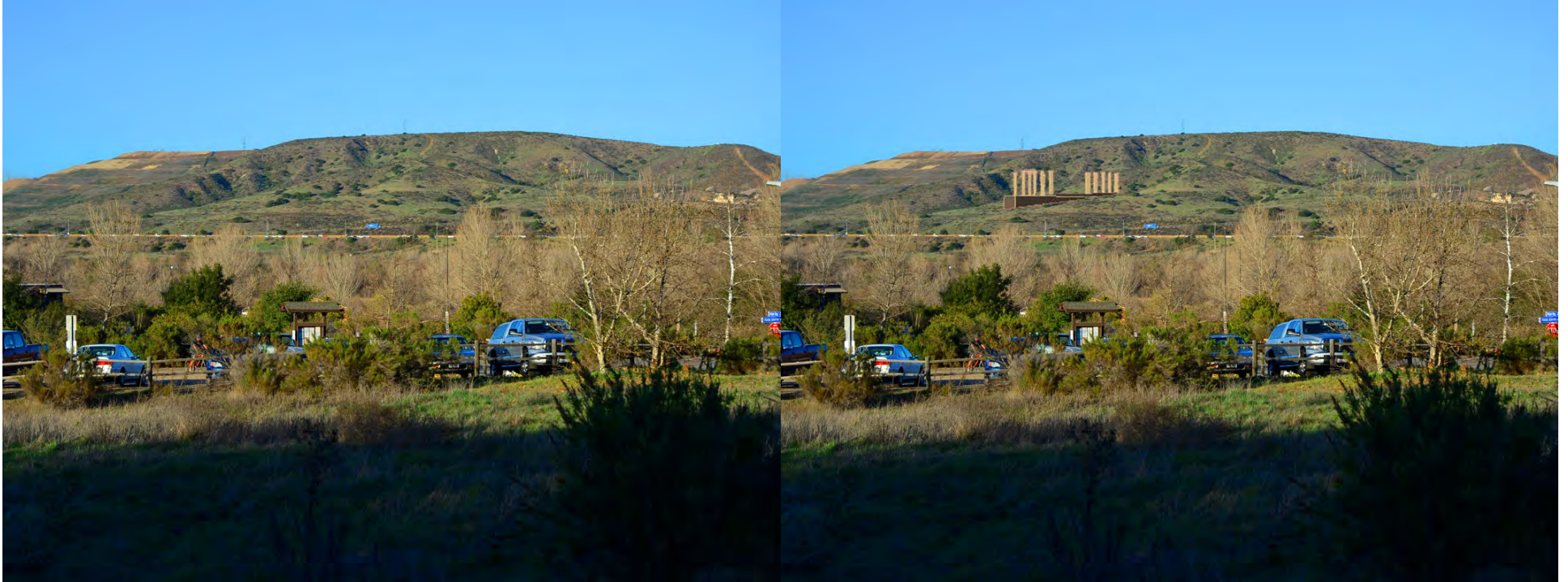
Campground and Kumeyaay Lake Area, Photo 2556: parking area (current view on left, view with simulated plant on right)