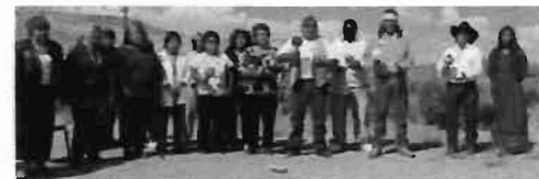
Salt Song singers at the Stewart Indian Boarding School in Carson City, Nevada.