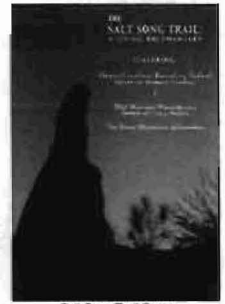
Salt Song Trail Cover

The Salt Songs begin their journey at Avi Nava/Ting-ai-ay (Rock House), a sacred cave at the confluence of the Bill Williams and Colorado Rivers. The songs travel north along the Colorado River to the Kaibab and Colorado Plateau, into Southern Utah, and then west to the great mountain Nuva Kaiv (Mt. Charleston) -- the place of origination of the Nuwuvi people - and then further west to rise above the Pacific Ocean before arcing back east through the Mojave desert to their origin at Avi Nava. The ghosted arrows on the map show the direction of the songs as they travel through a physical and spiritual landscape.