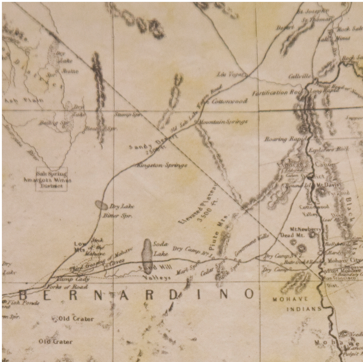
Detail from Bancroft's 1868 map of California and Nevada. Bancroft shows the Old Salt Lake Wagon Road following the Kingston cut-off. Stump Spring appears to the north of the wagon road, but there is no indication of the Old Spanish Trail or the wagon route leading to it.