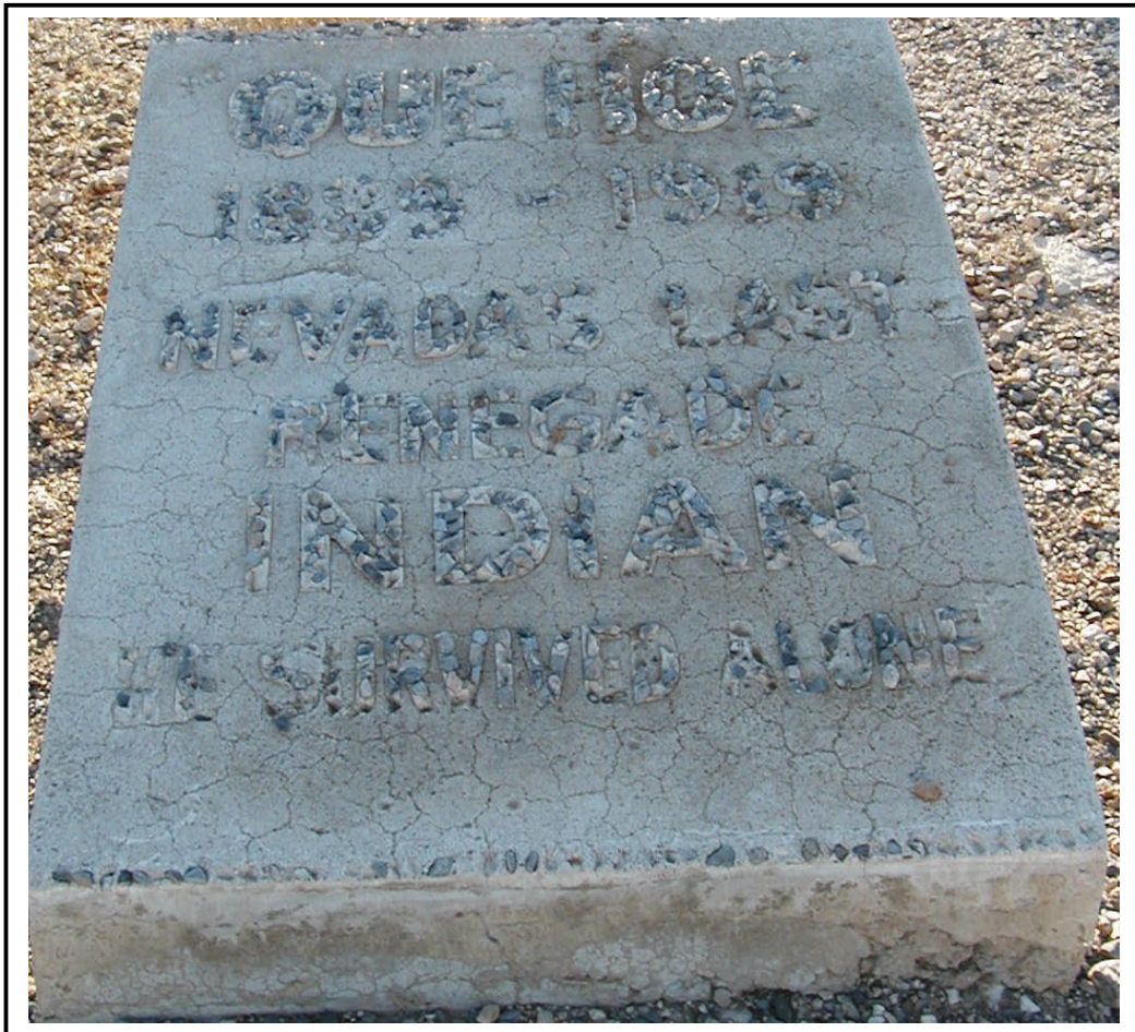
QUE HOE 1889 – 1919 NEVADA'S LAST RENEGADE INDIAN HE SURVIVED ALONE