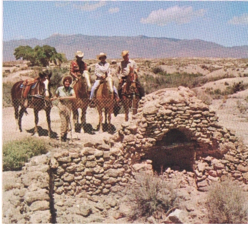
One of the many Historical Landmarks along the "Path of the Pioneers"—dated about 1820 — old adobe Indian ruins.