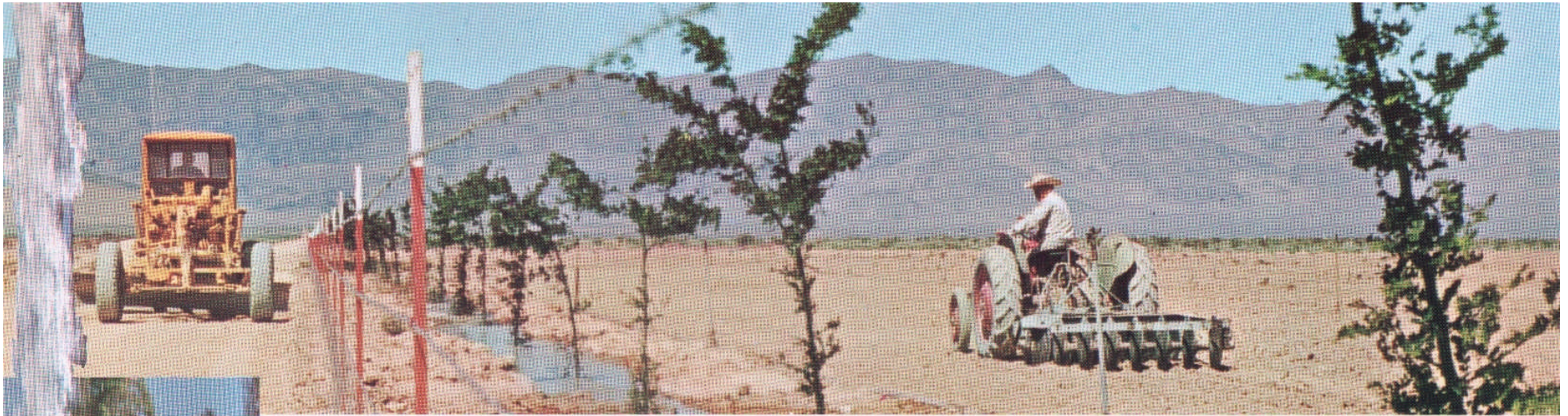
Ten acre Hoot Gibson Rancho under development.

Buy fertile land as wise men do... And let inflation work for you.