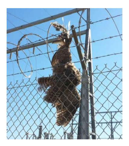
Photo 1 . A great-horned owl died after becoming entangled on the razor wire placed on top of this cyclone fence.

Cyclone fencing can entangle and kill wildlife (Photo 1). Care should be taken when planning and installing fencing. More details about fence construction should be provided in the environmental review documentation.