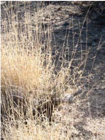
Big galleta ( Hilaria [ Pleuraphis ] rigida )