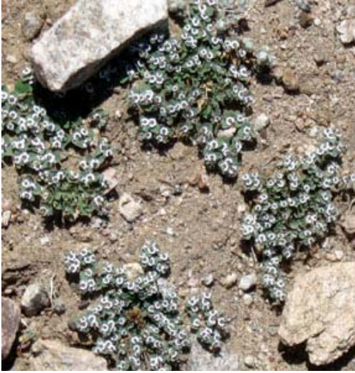
Rattlesnakeweed ( Chamaesyce albomarginata ).