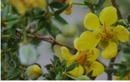
Creosote bush flowers ( Larrea tridentata )