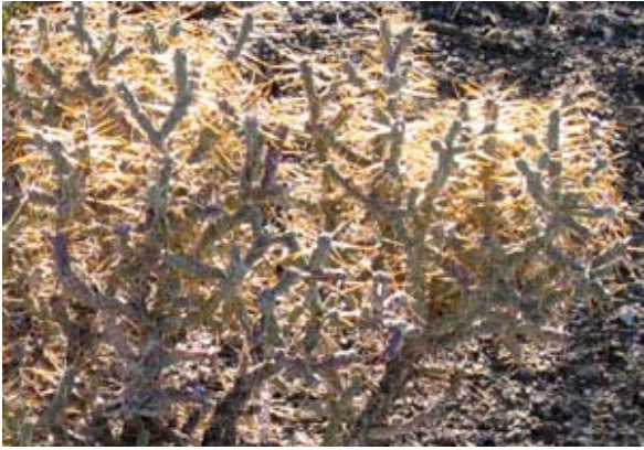
Pencil cholla ( Cylindropuntia ramosissima )