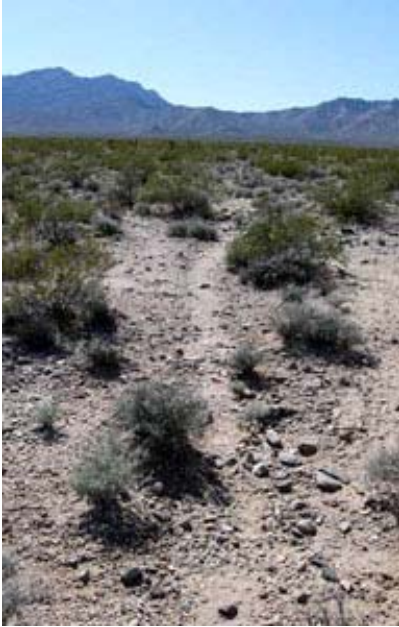
Possible prehistoric trail