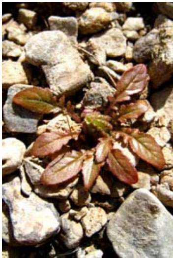
Cave-dwelling evening primrose ( Oenothera cavernae )