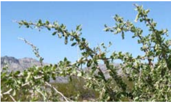
Copper's desert thorn ( Lycium cooperi )