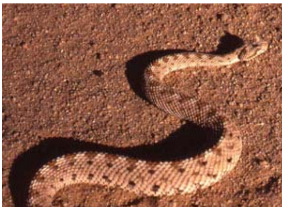
Sidewinder ( Crotalus cerastes )