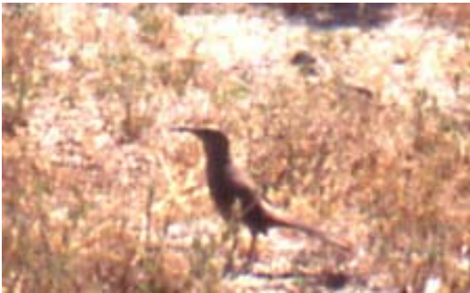
Le Conte's Thrasher ( Toxostoma lecontei )