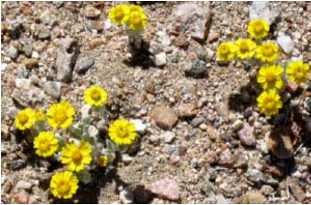
Woolly daisy ( Eriophyllum wallacei )