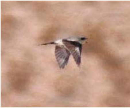
Loggerhead shrike in flight ( Lanius ludovicianus )