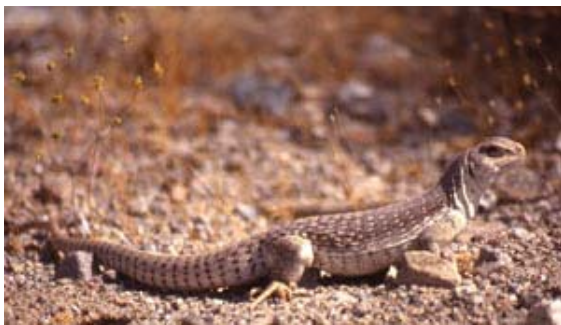
Desert iguana ( Dipsosaurus dorsalis )