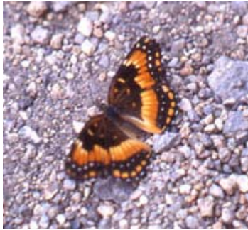
California patch ( Chlosyne californica )