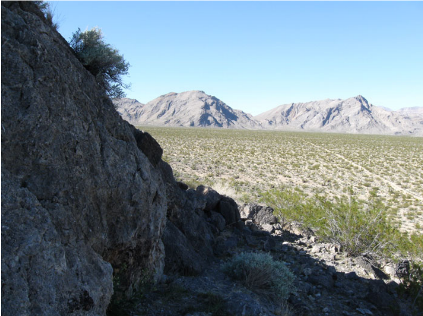
Large bajada looking north towards Stateline Wilderness Area.