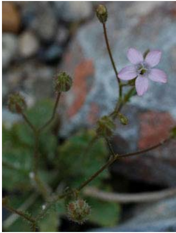
Gilia ( Gilia sp.)