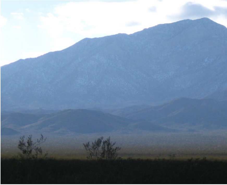
Clark Mountain, Mojave National Preserve looking west from proposed site.