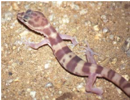
Western banded gecko ( Coleonyx variegatus )