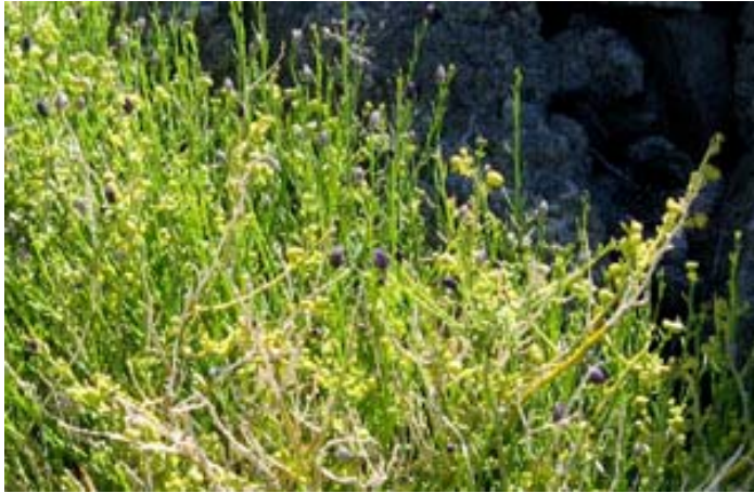
Turpentine broom ( Thamnosma montana )

Common checkered beetle ( Trichodes ornatus ) on flowers of Mojave aster ( Xylorhiza tortifolia )