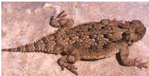
Desert horned lizard ( Phrynosoma platyrhinos )