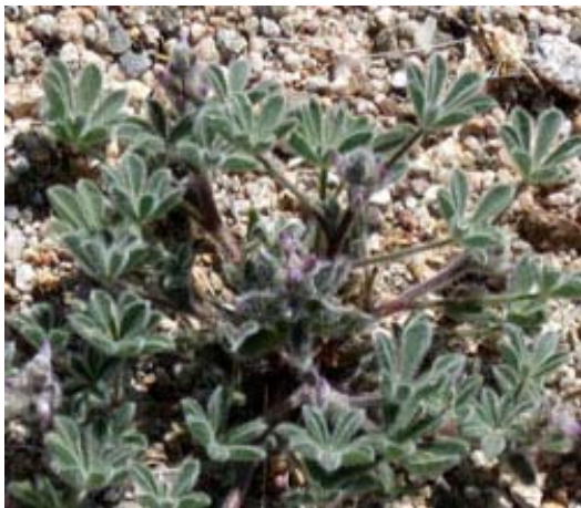
Elegant lupines ( Lupinus concinnus )