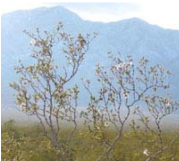
Creosote bush ( Larrea tridentata )