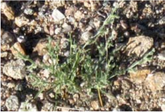
Tiny Comb-burs ( Pectocarya sp.)