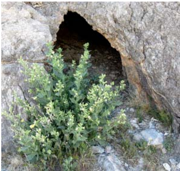
Coyote tobacco ( Nicotiana obtusifolia )