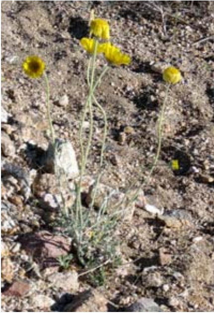
Desert marigold ( Baileya multiradiata )