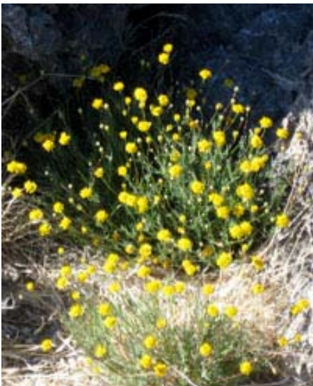
Threadleaf groundsel ( Senecio flaccidus )