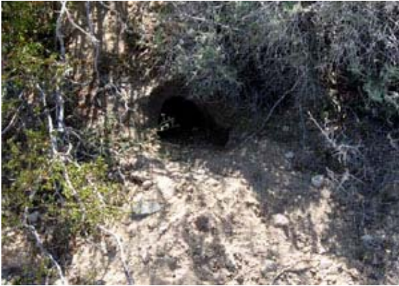
Desert tortoise ( Gopherus agassizii ) burrow