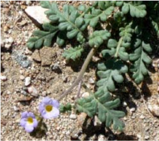
Fremont phacelia ( Phacelia fremontii )