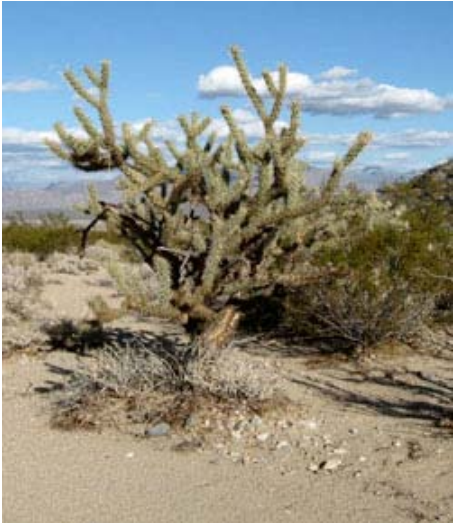
Buckhorn cholla ( Cylindropuntia acanthocarpa var. coloradensis )