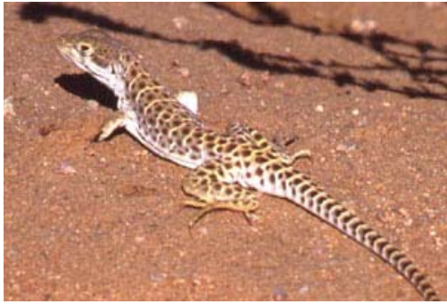
Long-nosed leopard lizard ( Gambelia wislizenii )