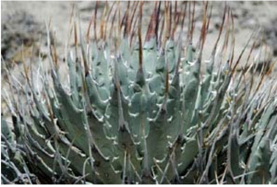
Clark Mountain agave ( Agave utahensis var. nevadensis )