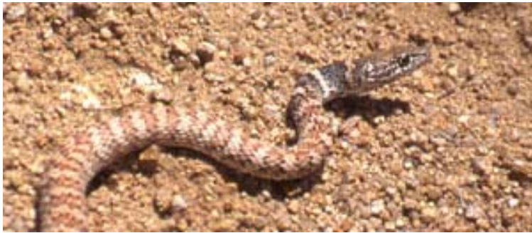
Coachwhip ( Masticophis flagellum )