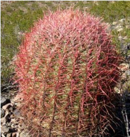
Desert barrel cactus ( Ferocactus cylindraceus )