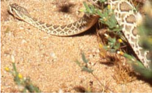
Mojave rattlesnake ( Crotalus scutulatus )