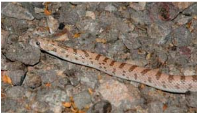
Leaf-nosed snake ( Phyllorhynchus decurtatus )