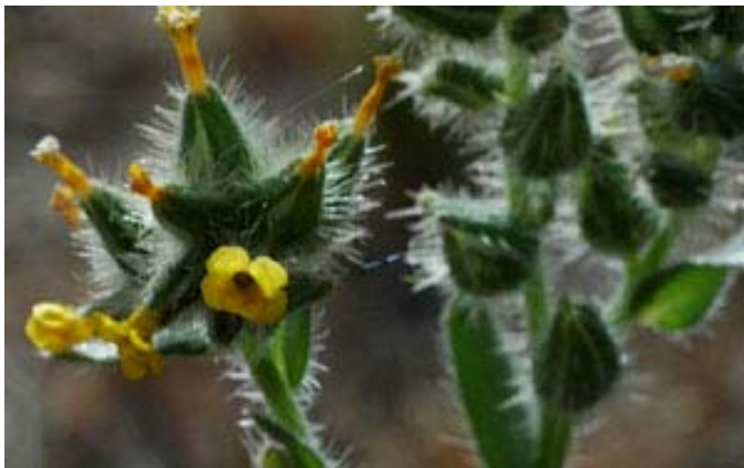
Fiddleneck flower ( Amsinckia tessellata )