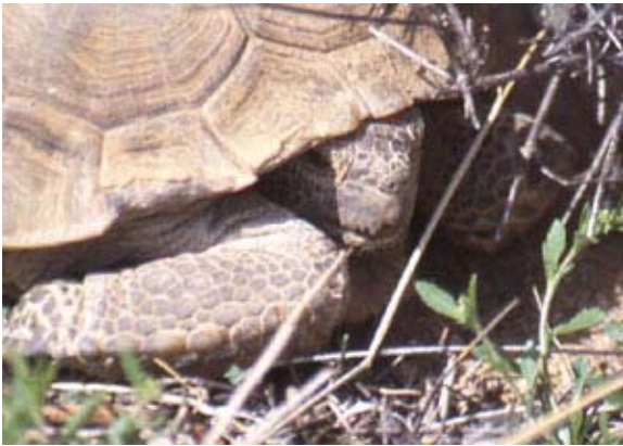
Desert tortoise ( Gopherus agassizii )