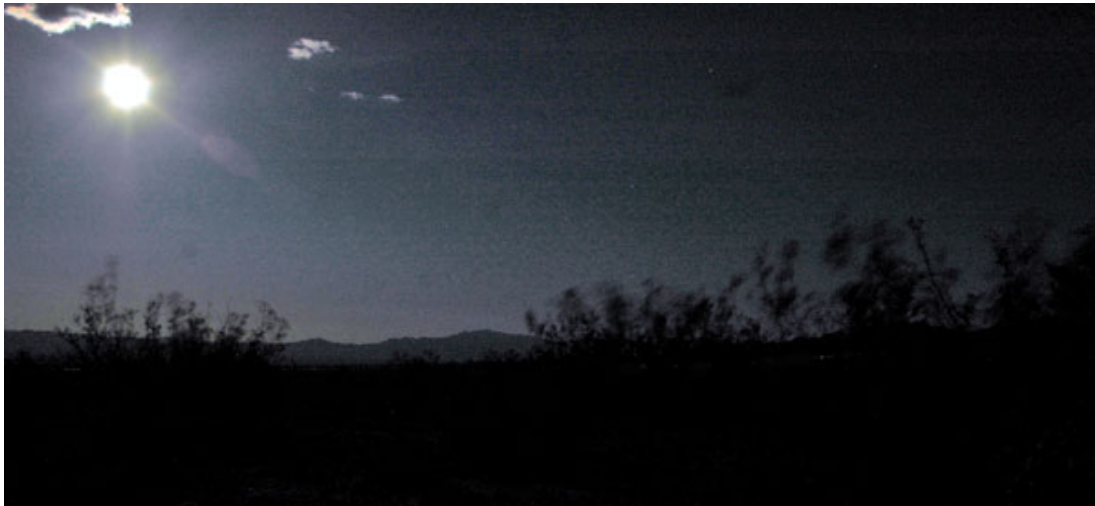
Relatively undisturbed night sky, looking south from proposed site during the full moon. June, 2009. This would change dramatically if the facility is constructed.