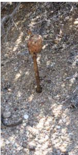
Desert puffball ( Podaxis pistillaris )