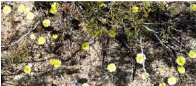
Desert dandelion ( Malacothrix glabrata )