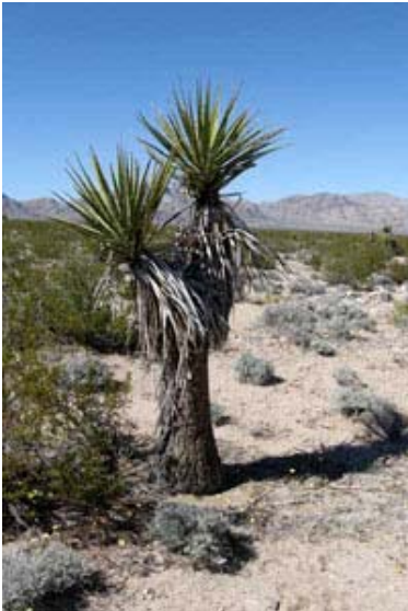
Mojave yucca ( Yucca schidigera )