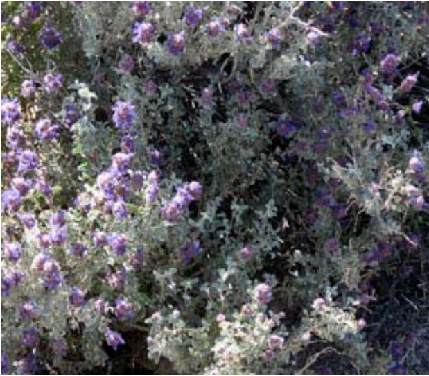
Flowering Purple sage ( Salvia dorrii )