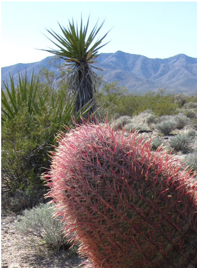
Old Growth Mojave Desert

Biological resources provide scenic characteristics that the Mojave Desert is famous for. Old growth desert ecosystems also act as carbon sinks. Many scientists believe that removal of these ecosystems could contribute to carbon buildup in the atmosphere; making the problem of climate change even worse.