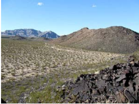
View of ephemeral wash from hill looking north.