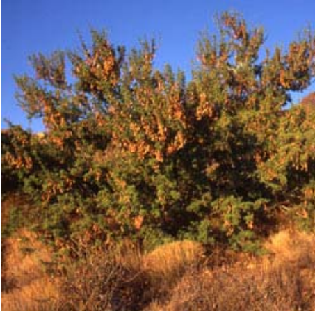
Catclaw acacia ( Acacia greggii )