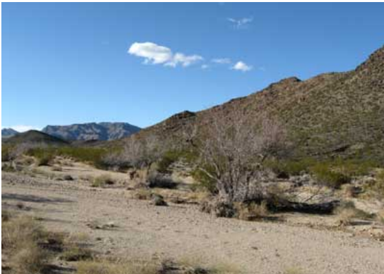
One of the many ephemeral desert washes that crosses the proposed project site.