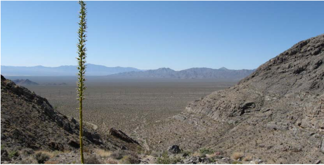
View of proposed ISEGS site from the Stateline Wilderness Area.