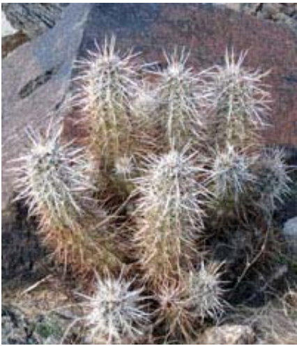
Calico cactus ( Echinocereus engelmannii )