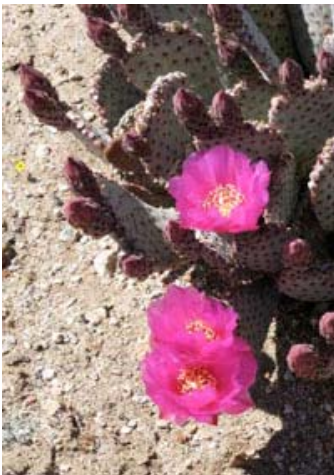
Beavertail ( Opuntia basilaris )