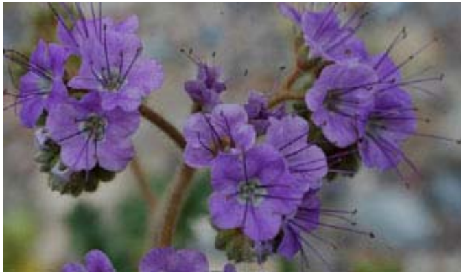
Notch-leaf phacelia ( Phacelia crenulata )