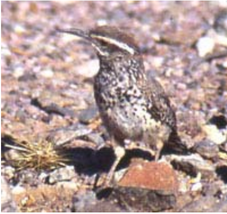
Cactus Wren ( Campylorhynchus brunneicapillus )