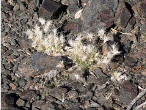
Fluffgrass ( Erioneuron pulchellum )