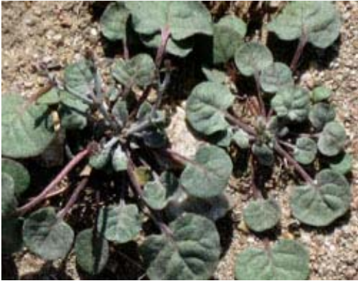
Annual buckwheat ( Eriogonum sp.)