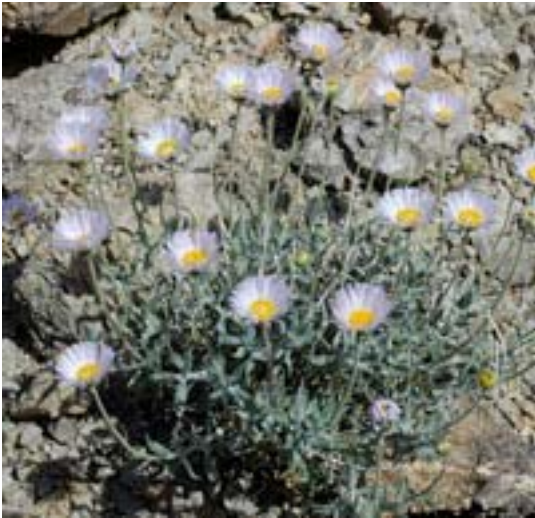
Mojave Aster ( Xylorhiza tortifolia )