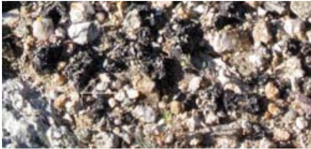
Cyanobacteria: Cryptogamic crust in soil