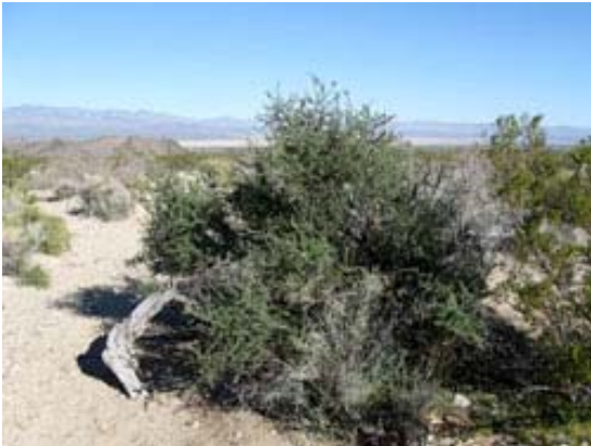
Desert almond ( Prunus fasciculata )