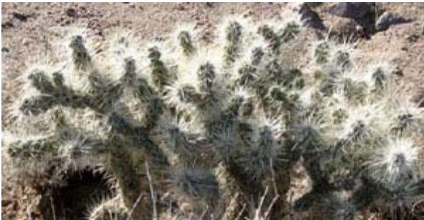
Silver cholla ( Cylindropuntia echinocarpa )