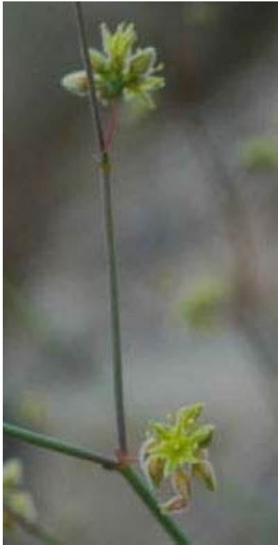
Trumpet buckwheat ( Eriogonum inflatum )