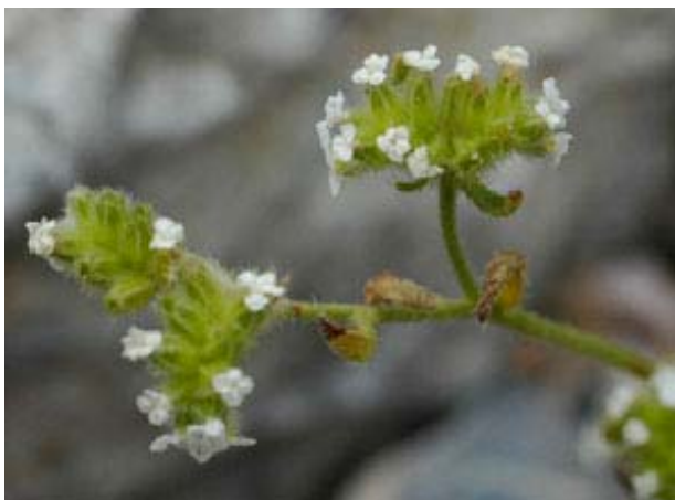
Forget-me-not ( Cryptantha sp.)