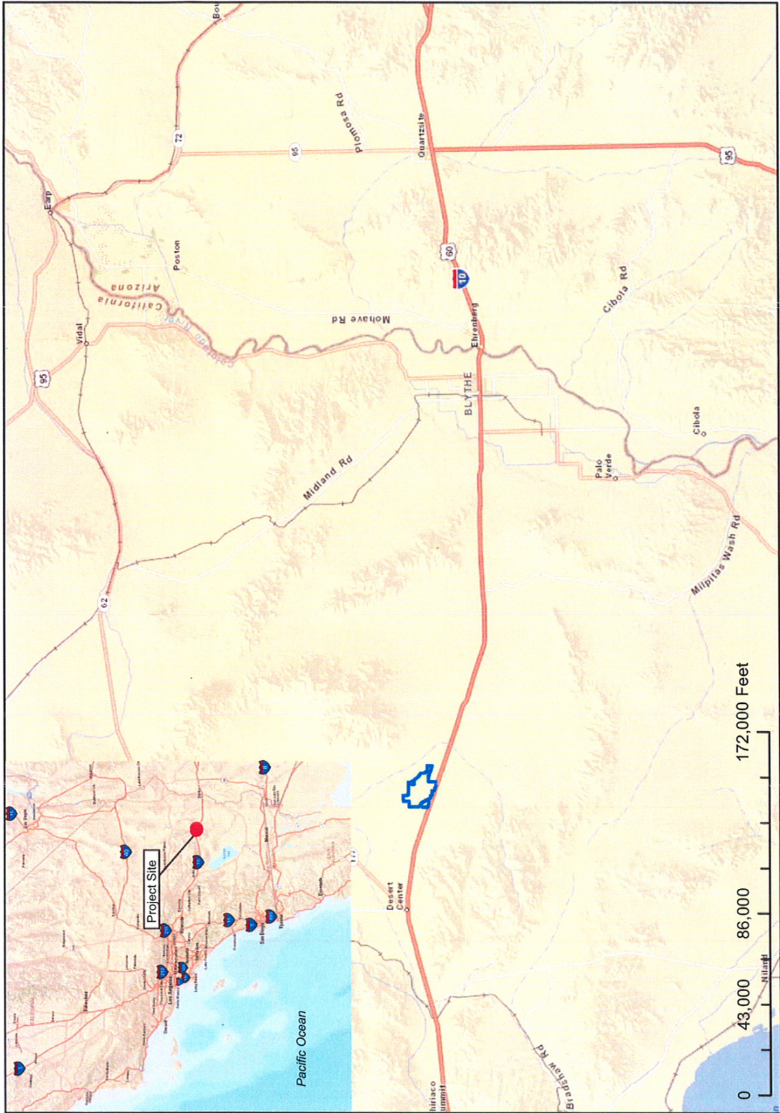
FIGURE NO. 2.1-1 SITE VICINITY MAP