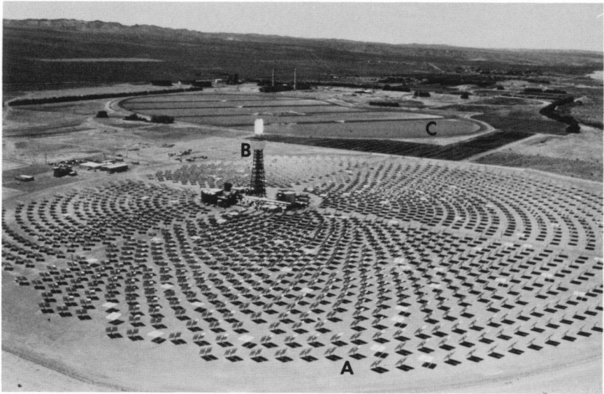
FIGURE 1. Aerial view of Solar One: (A) heliostat field, (B) central receiver tower, (C) evaporation ponds. Tower height = 86 m, diameter of field = 765 m.

To determine the impact of bird mortality on local populations, 1–2 observers conducted surveys of relative avian abundance within an area of approximately 150 ha surrounding Solar One, concentrating on the facility grounds (32 ha), evaporation ponds, and agricultural fields. These surveys were conducted on at least 2 d per visit for 3–4 h/d.