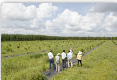
A field of young pongamia trees in southern Florida, which will produce an oil feedstock.

In response to litigation from interest groups, court decisions issued in the first half of 2013 have generally upheld the LCFS. However, these challenges have resulted in some delays in implementation of parts of the LCFS, including a recent delay of the increased 2014 target. The LCFS will remain at the one percent reduction level (the 2013 target) through 2014. Despite the marketplace uncertainty caused by such changes, the LCFS has delivered a fuel mix with lower carbon intensity. In 2012, Cali-