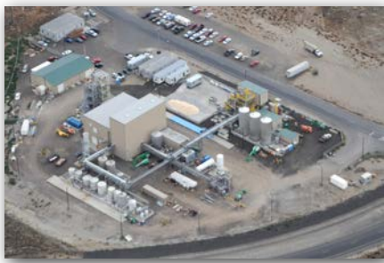
ZeaChem's demonstration-scale facility in Boardman, OR, processing woodchips for conversion to ethanol.

Advanced biofuel production is key to compliance with two important policies: the federal Renewable Fuel Standard (RFS) and California's Low Carbon Fuel Standard (LCFS). RFS is a volumetric mandate that requires specific levels of a variety of renewable fuels each year and includes an advanced biofuels mandate. The LCFS is a performance standard that requires a gradual reduction in the carbon intensity of California's fuel mix between 2011 and 2020. We use our domestic capacity projections to assess the industry's potential to meet these standards and discuss the policies themselves in section V. For both standards, it is possible there will be additional capacity beyond projects tracked by E2.