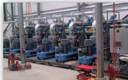
Edeniq's Cellunator mill produces sugar from plant materials.

Although there are not any announced plans for cellulosic butanol production in the coming years, this could be an attractive alternative for some companies exploring the alcohol-as-fuel market, as butanol may be blended with gasoline up to 16% without modification to vehicles.