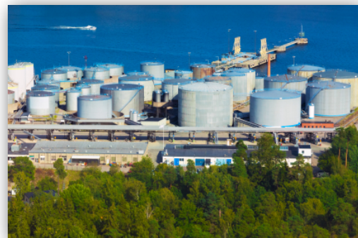
Fuel storage facility in Stockholm, Sweden.

E2 compiled a list of 24 companies working internationally on advanced biofuel projects of particular interest to the U.S. This does not reflect the full scale or capacity of the global market, but should be understood as a survey of international activity that could be imported to the United States or technologies that may be licensed domestically. See Appendix D for a list of these companies.