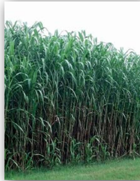
NexSteppe's Palo Alto High Biomass Sorghum.

fornia displaced 1.06 billion gallons of traditional fuels with lower-carbon fuels, thus lowering the carbon intensity of the overall fuel mix. 21 The policy is providing reduced greenhouse gas emissions from the transportation sector, and overall is working as intended.