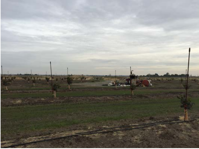
Photo 1. Project Area View West