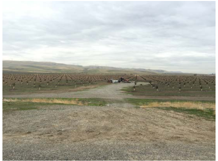
Photo 4. Project Area View East