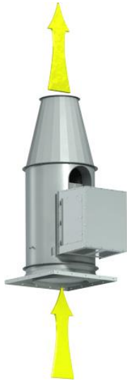
Mixed Flow High Plume