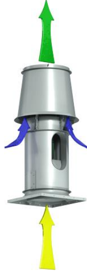
Mixed Flow Induced Flow