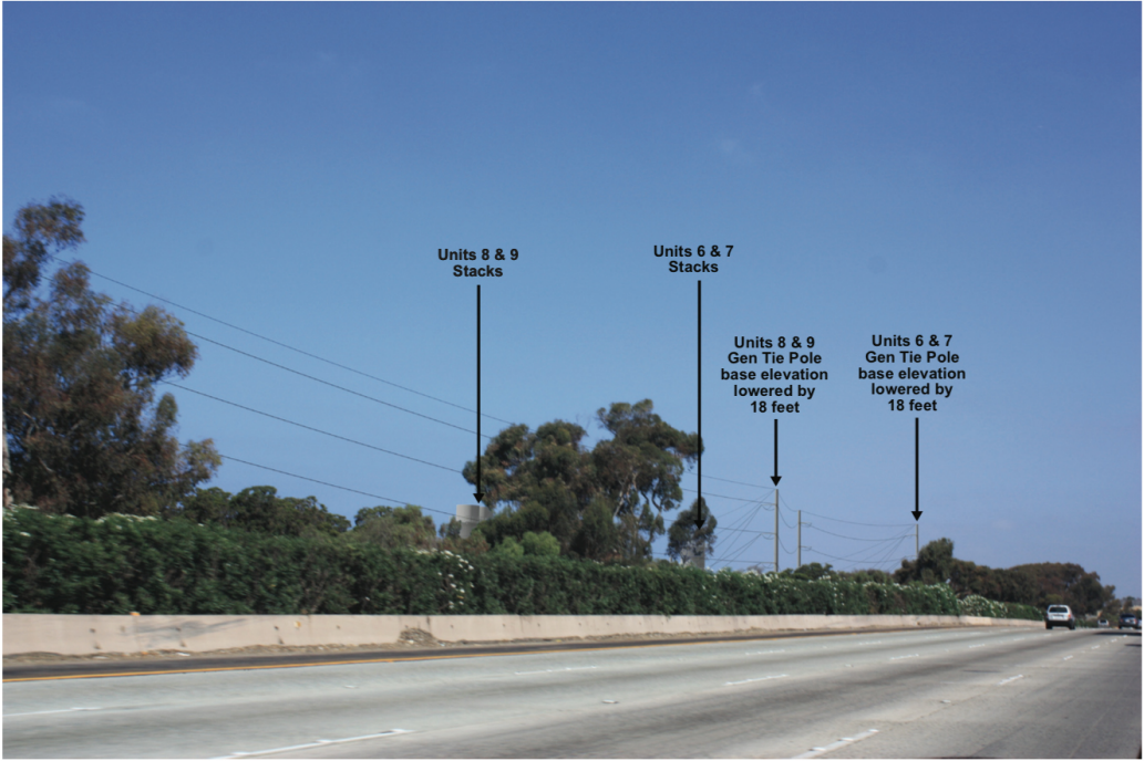
Simulated with-project view looking northbound on I-5, south of the proposed transmission structure associated with the proposed Units 8 and 9 transformers depicting the revised design of the project transmission system.