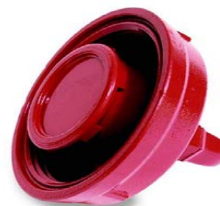
Communication device and CCAM sensor inside hydrant cap