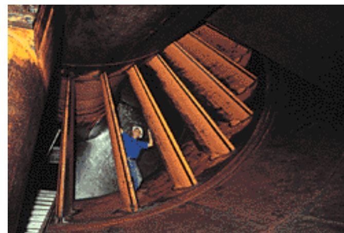
Young's Creek Hydro Project - SnoPUD

More power will be generated from same amount of water via $120 million project – Daily Journal of Commerce