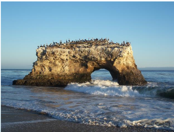
Natural Bridges Fall 2016