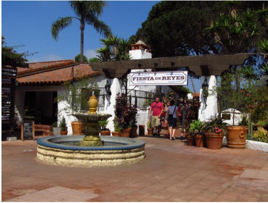
Old Town San Diego State Historic Park May 2016