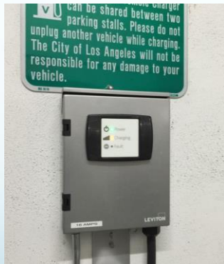
Leviton - LADOT Hollywood & Highland $750