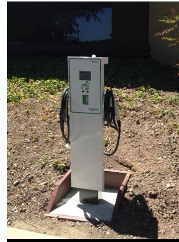
Red Cross San Jose Schneider $9,400 ChargePoint $1.00/hour