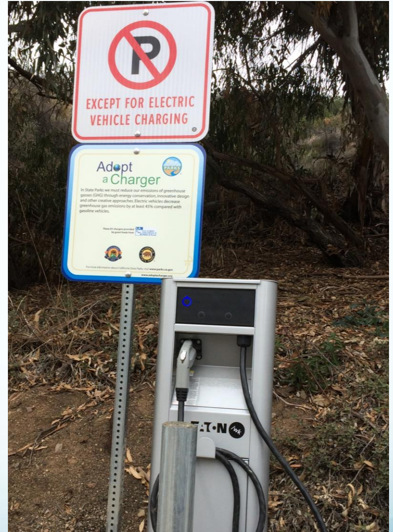
Google donated Eaton EVSE