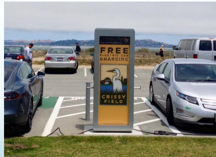
Crissy Field Volta donated