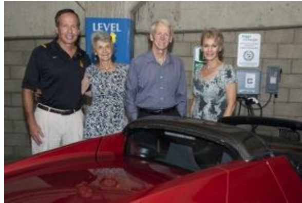
Cal State Long Beach