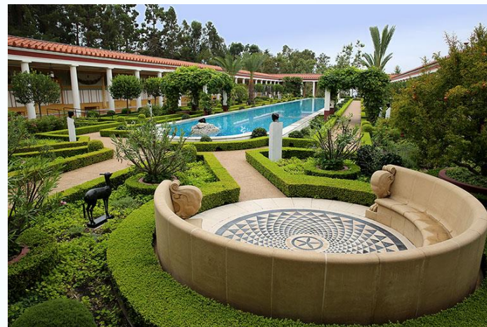
South: 2-L2, 2-120 v Central: 2-L2