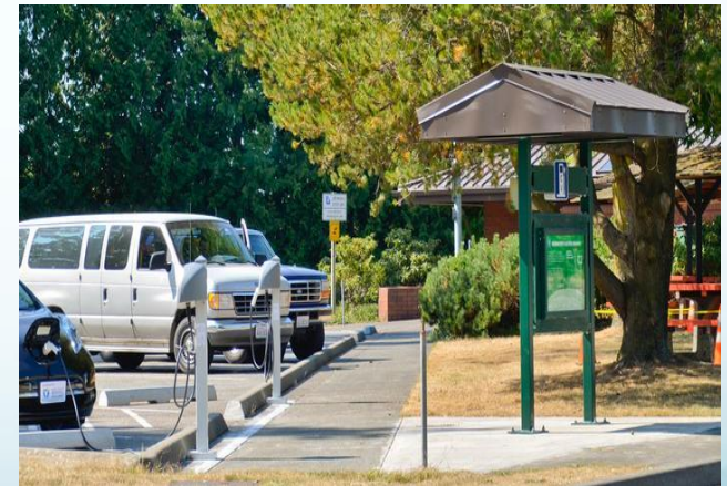
West Coast Electric Highway