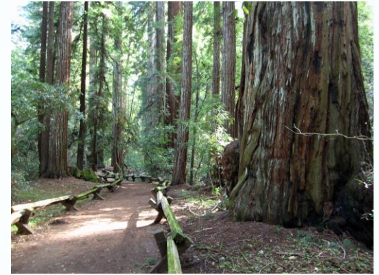
Armstrong Woods Fall 2016