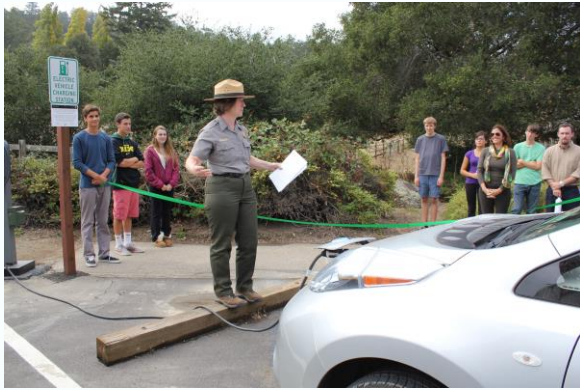
Point Reyes National Seashore