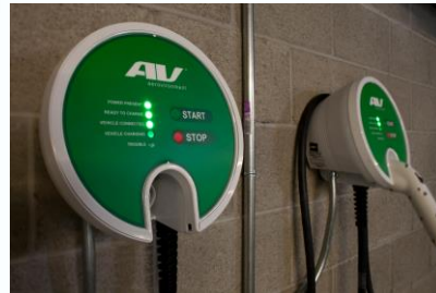
LACMA AV donated