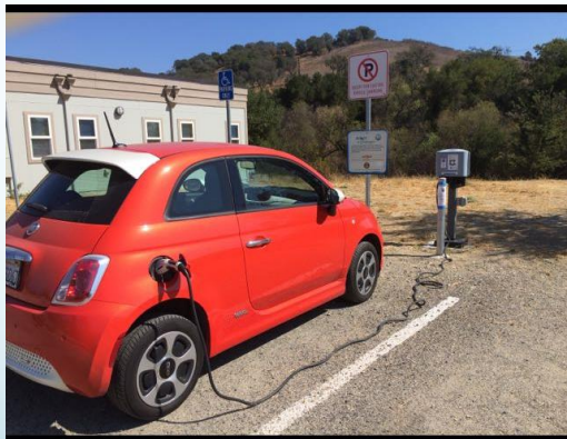
Malibu Creek State Park