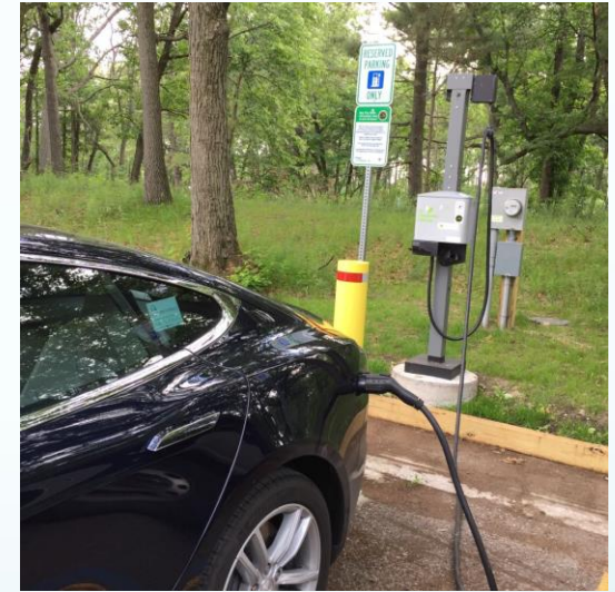
Bay City State Park, MI