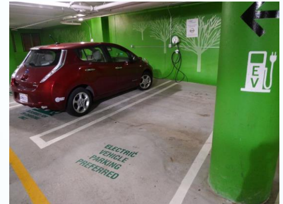
Music Concourse Garage Golden Gate Park