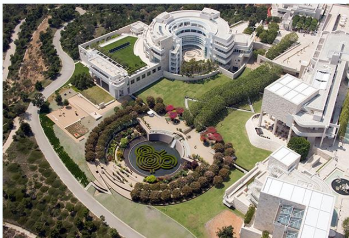
Main Lot: 4 – L2, 4-120v TOH: 8 – L2, 7-120 v