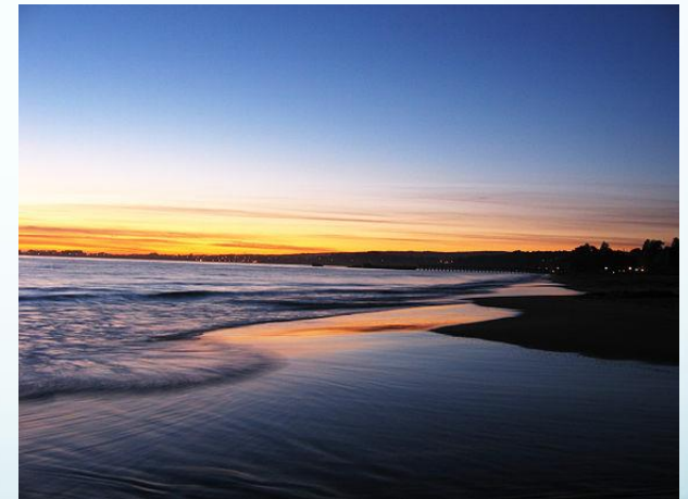
Seacliff State Beach Fall 2016