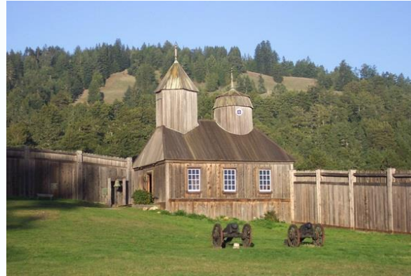
Fort Ross May 2016