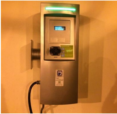
LADOT Robertson Garage GE w/ RFID $750 close out