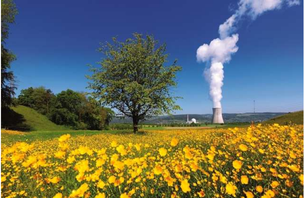
Photo Caption: Pure water vapor rises from the cooling tower of the Leibstadt nuclear power plant in Switzerland. MAXATOMSTROM buys power from this plant as part of their 100% nuclear power purchase plan in Germany.

Pflug attributes this to the nuclear phase-out in 2011. “Coal got a big boost from the nuclear phase-out. Despite all claims to the contrary, we simply cannot quit both coal and nuclear at the same time.”