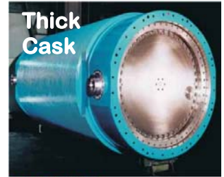
CASTOR® - Type V19 cask

A 2-year old Holtec Diablo Canyon canister has all the conditions for salt corrosion cracking, yet Edison plans to spend almost $1.3 billion to install Holtec thin canisters at San Onofre! http://bit.ly/1uJQhLr A through-wall crack can release millions of curies of radiation into the atmosphere, according to Holtec President, Dr. Singh. ( http://youtu.be/euaFZtOYPi4 )