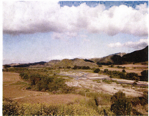
Figure 1. The Santa Clara River in Ventura County, CA, USA.

Within the field of restoration ecology, this approach has been referred to as the "string-of-pearls" approach, where protected sites along riparian corridors or terrestrial habitat that is surrounded by urban areas or agricultural lands are ecologically restored to produce an integrated system of