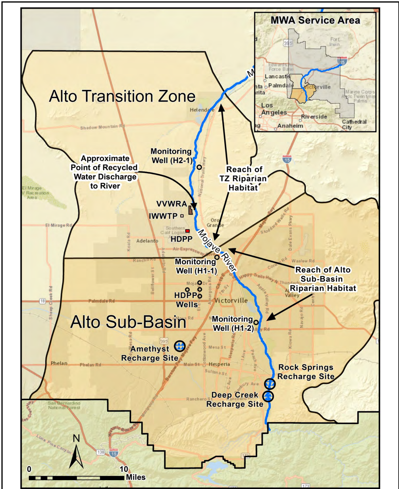
Figure 1 - High Desert Power Plant (HDPP) and associated water resource features including: Victor Valley Wastewater Reclamation Authority Shay Road Plant (VVWRA) and Industrial Wastewater Treatment Plant (IWWTP), HDPP Wells for project water supply, Riparian Zone monitoring wells for both the Transition Zone (TZ) and Alto Sub-basin, and groundwater recharge sites in the TZ and Alto Sub-Basin. Inset map shows Mojave Water Agency (MWA) service area and relative location of TZ and Alto Sub-Basin.