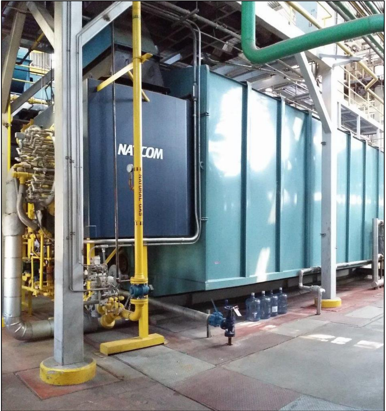
Figure 12-2. Boiler 1B