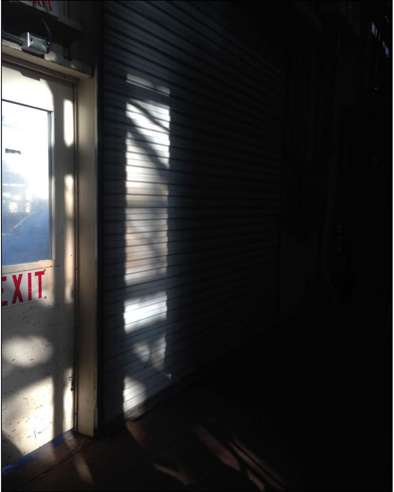
Figure 12-6. Inside Entry Door & Left-side Roll-up Door