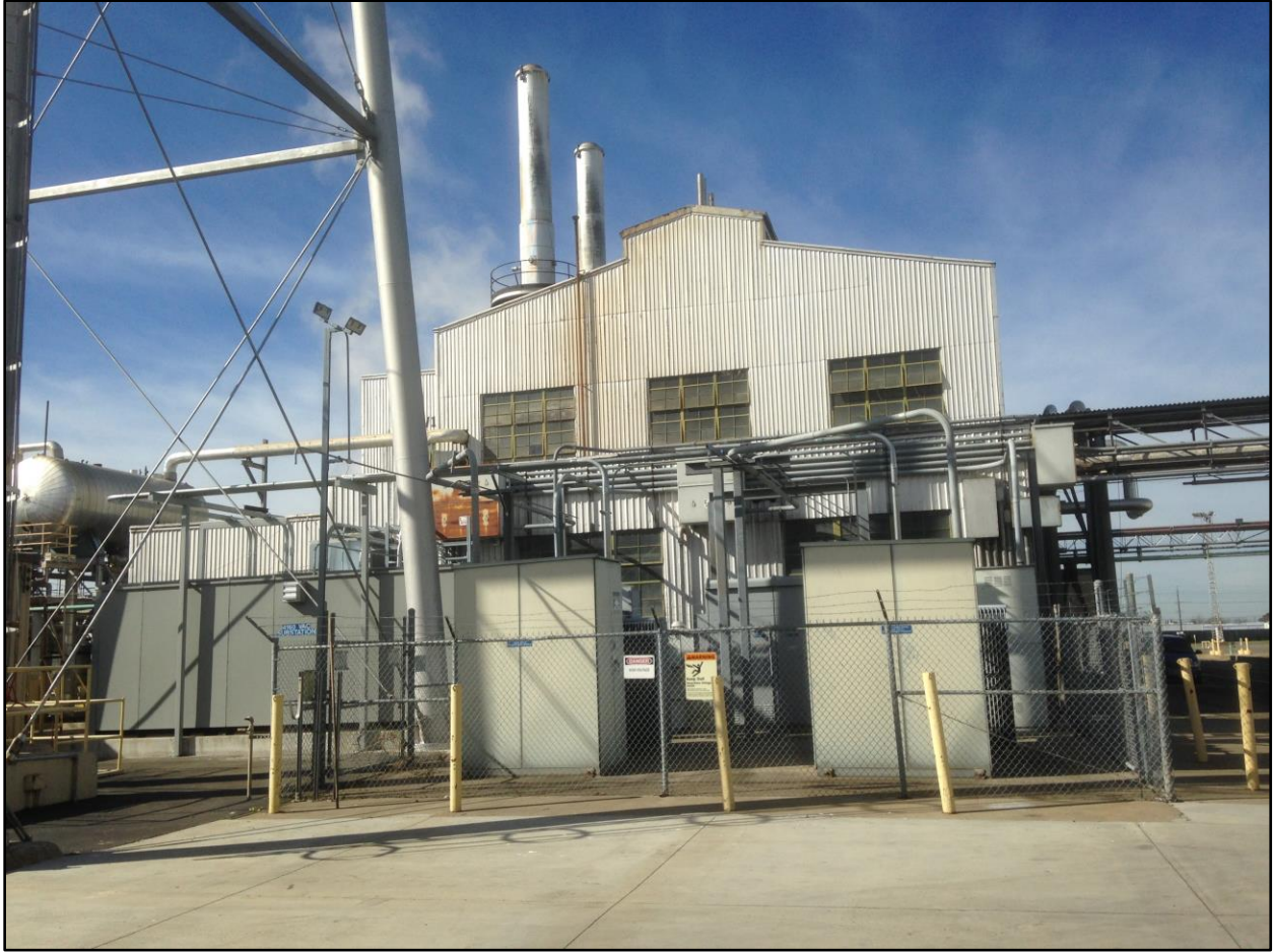
Figure 12-3E. Boiler Room - East Elevation