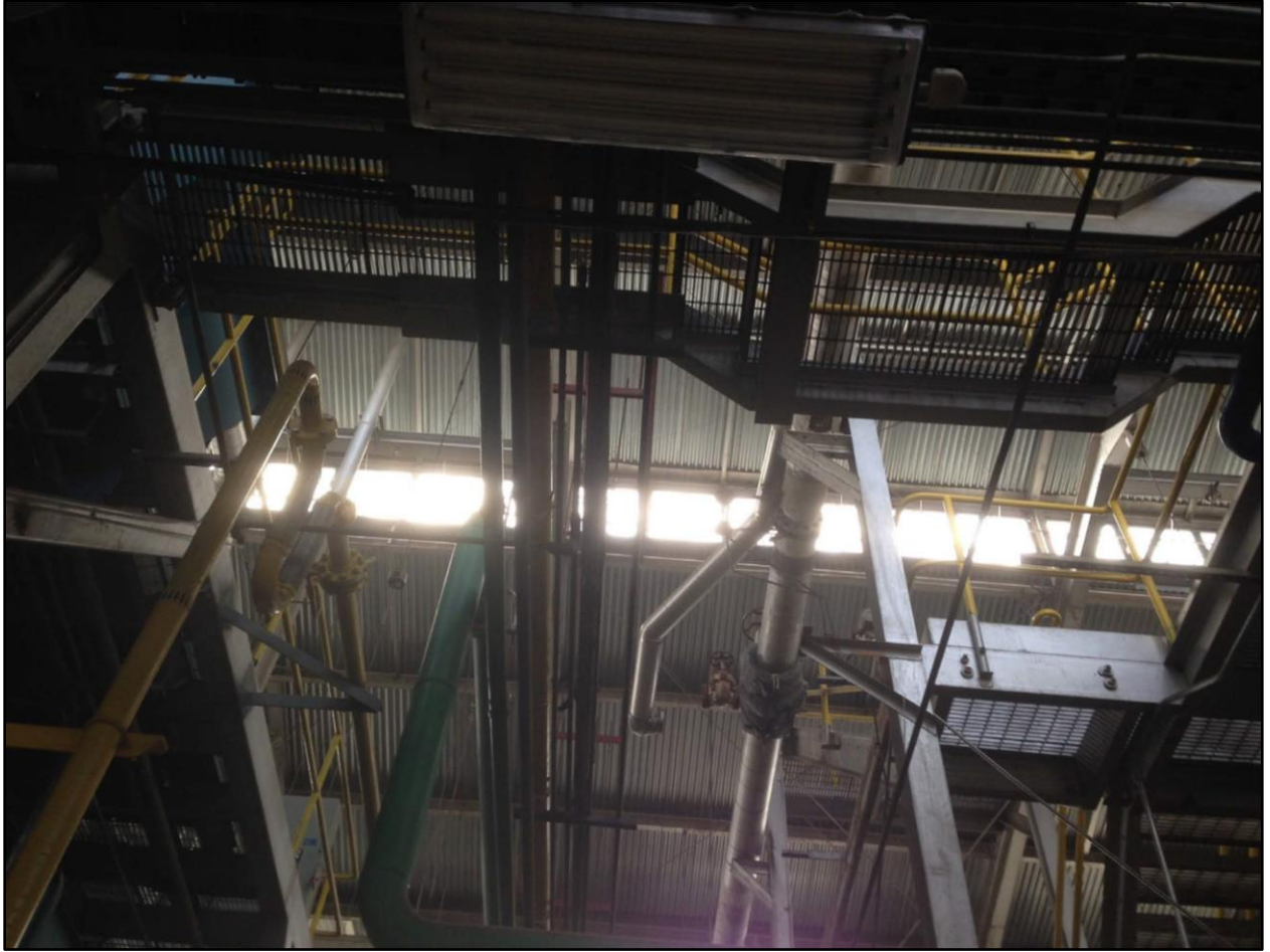
Figure 12-10. Ceiling Above Boiler