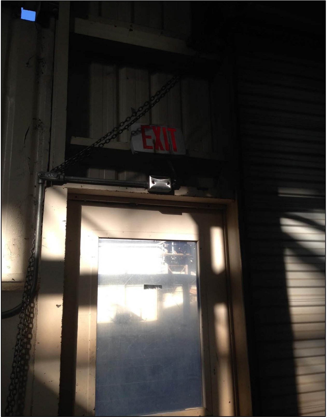
Figure 12-5. Inside Entry Door