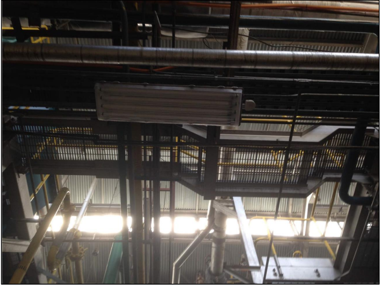
Figure 12-9. Ceiling Above Boiler IB