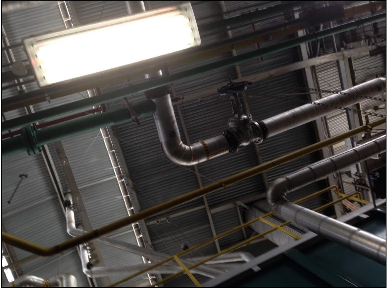
Figure 12-11. Ceiling Above Boiler IB