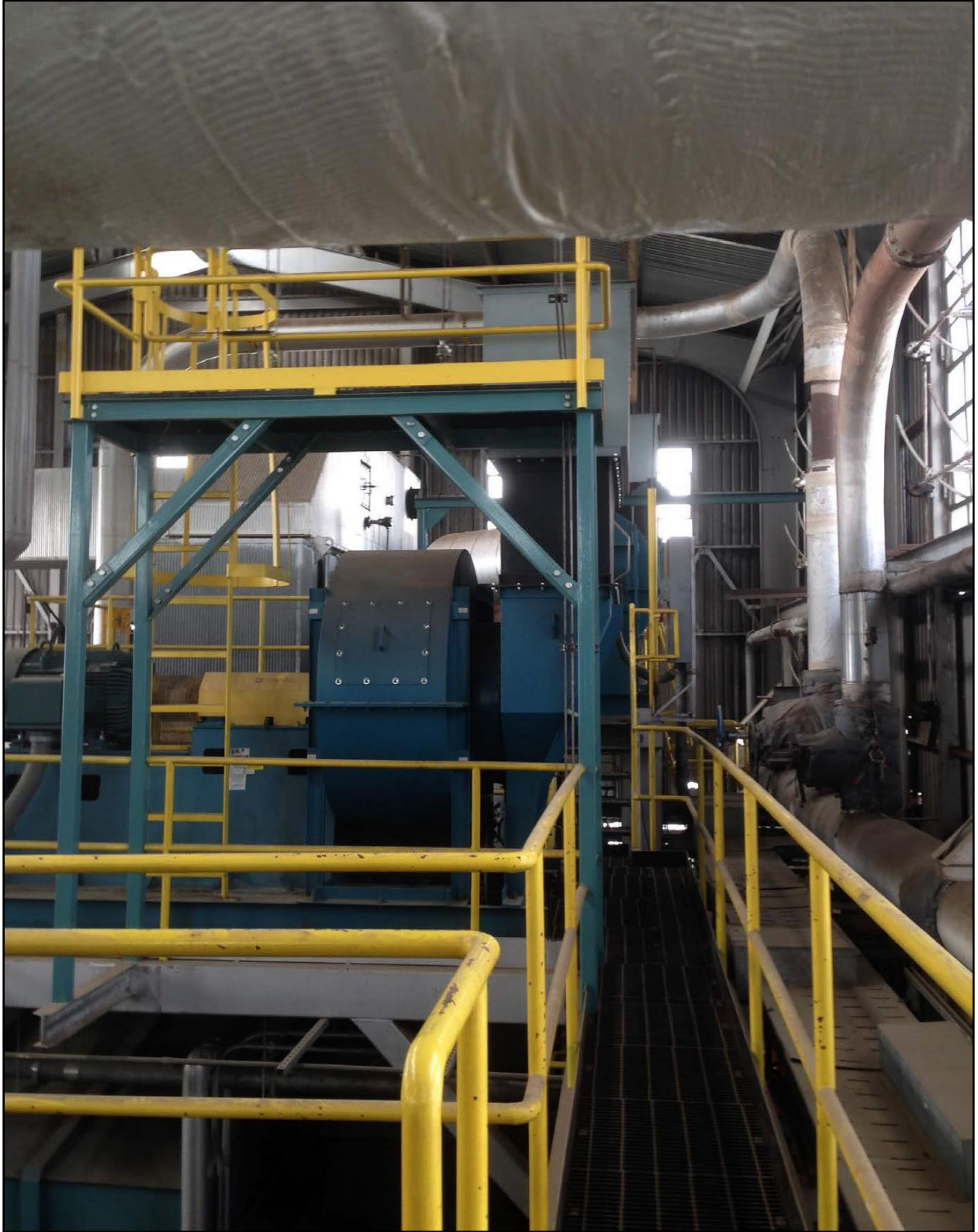
Figure 12-7. Boiler Work Area