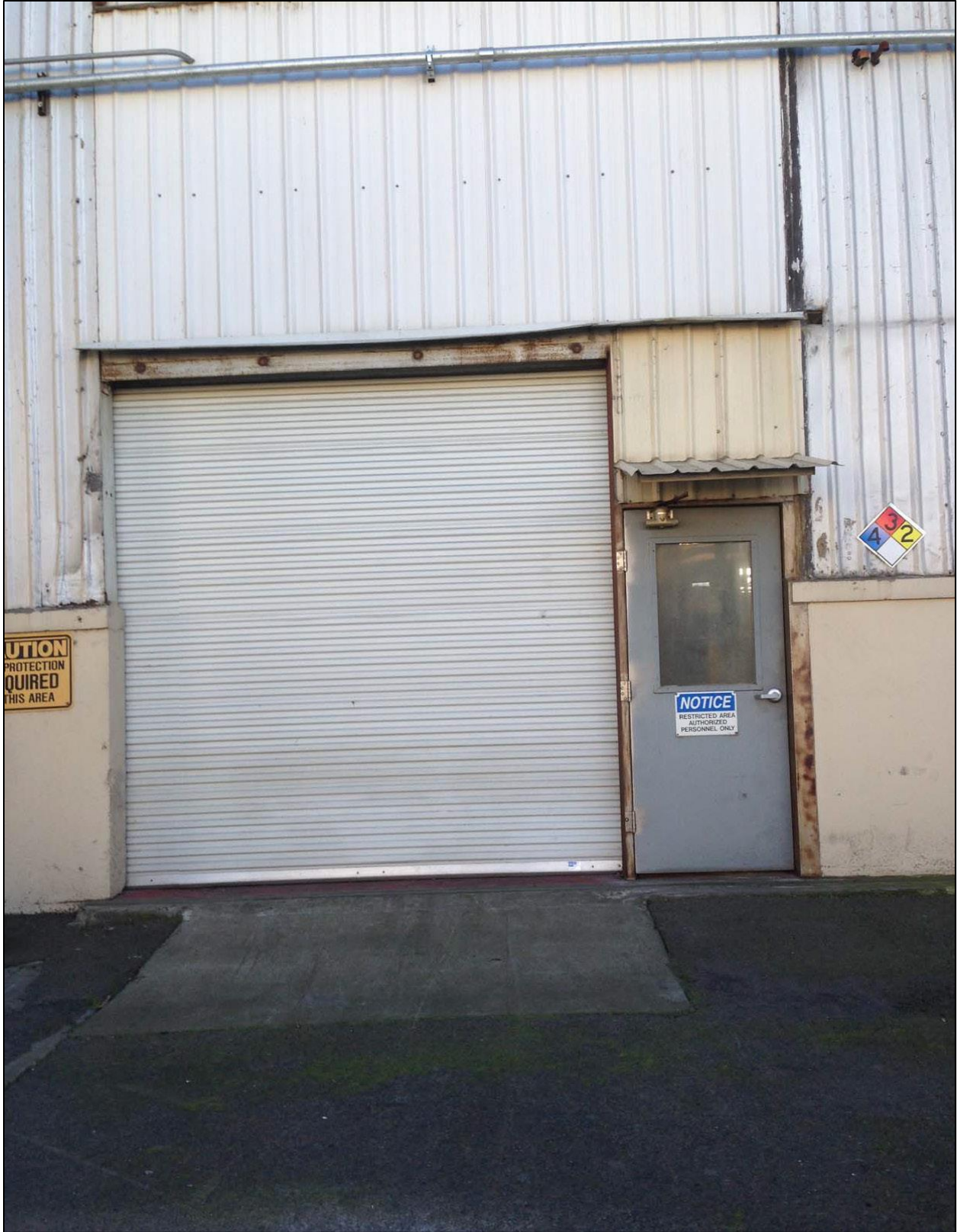
Figure 12-4. Roll-up Door to be Removed