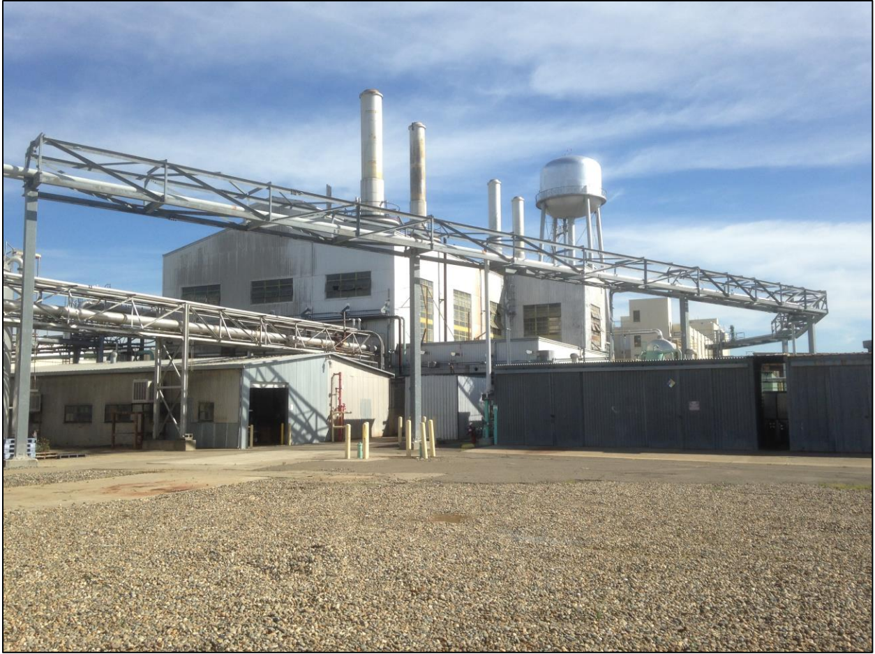
Figure 12-3W. Boiler Room - West Elevation