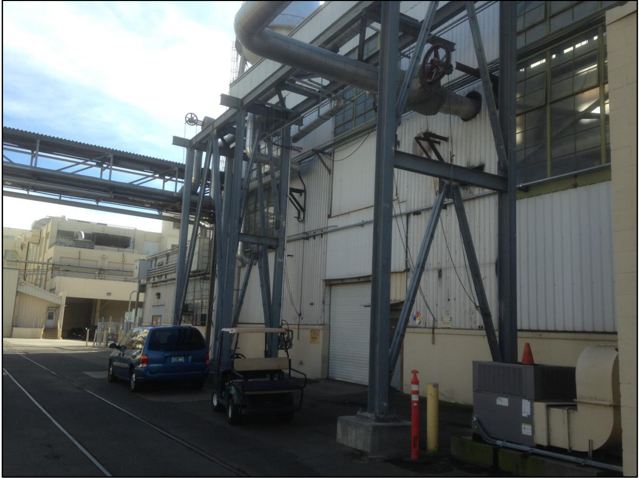
Figure 12-3N. Boiler Room - North Elevation