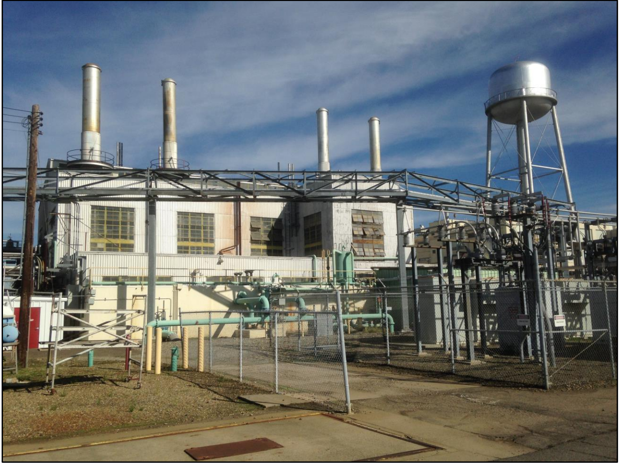
Figure 12-3S. Boiler Room - South Elevation