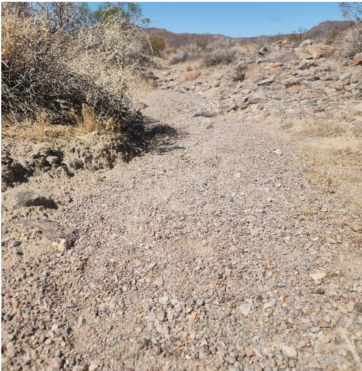
Photo Point S2-8-1 (South Array 2). East facing representative photograph of an downstream drainage feature exhibiting indicators of an OHWM, corresponding to the EK-001 Datasheet (see Figure 10 Page 37).