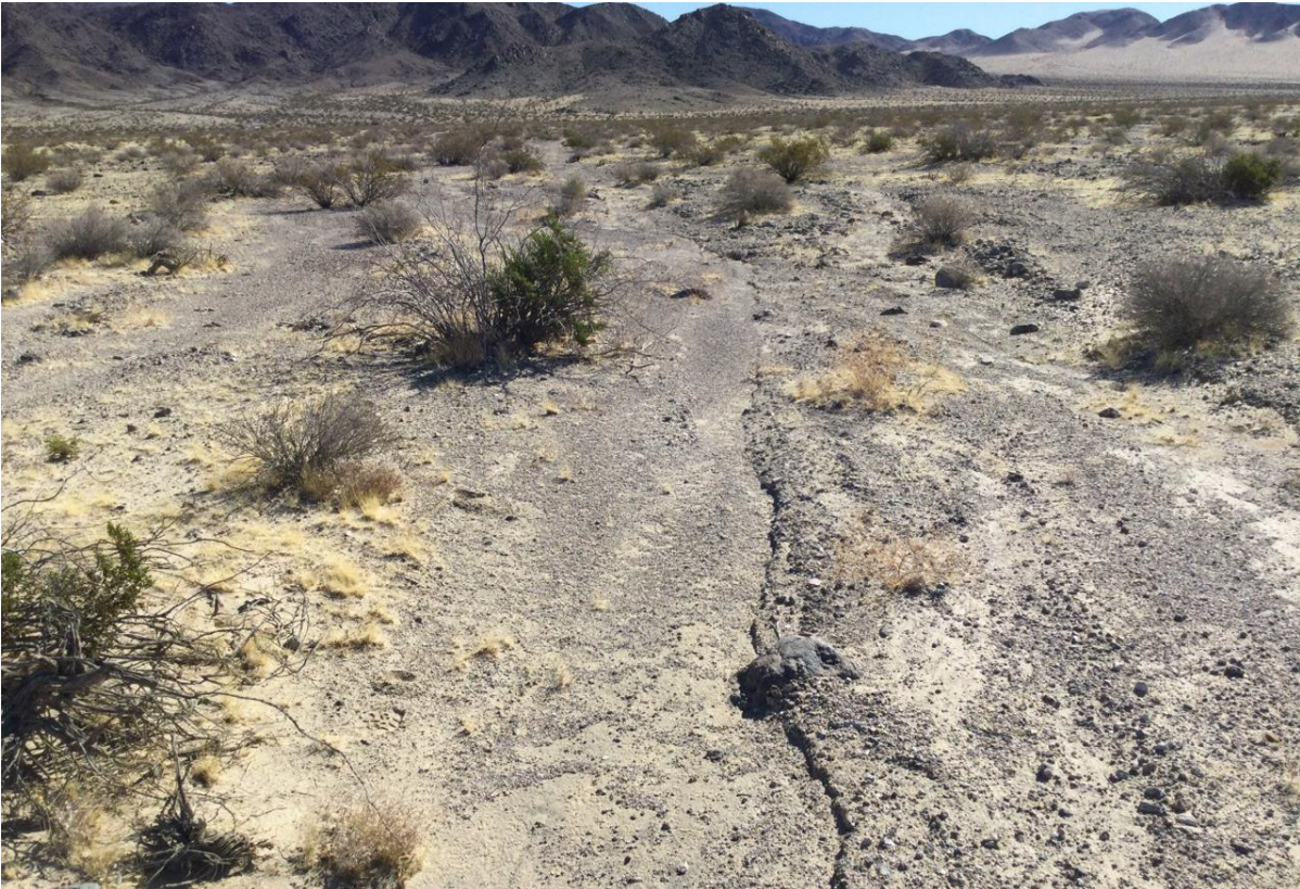
Photo Point S3-7-1 (South Array 3). East facing representative photograph of drainages in the Study Area exhibiting weak indicators of a bed and bank and change in substrate (see Figure 10 Page 51).