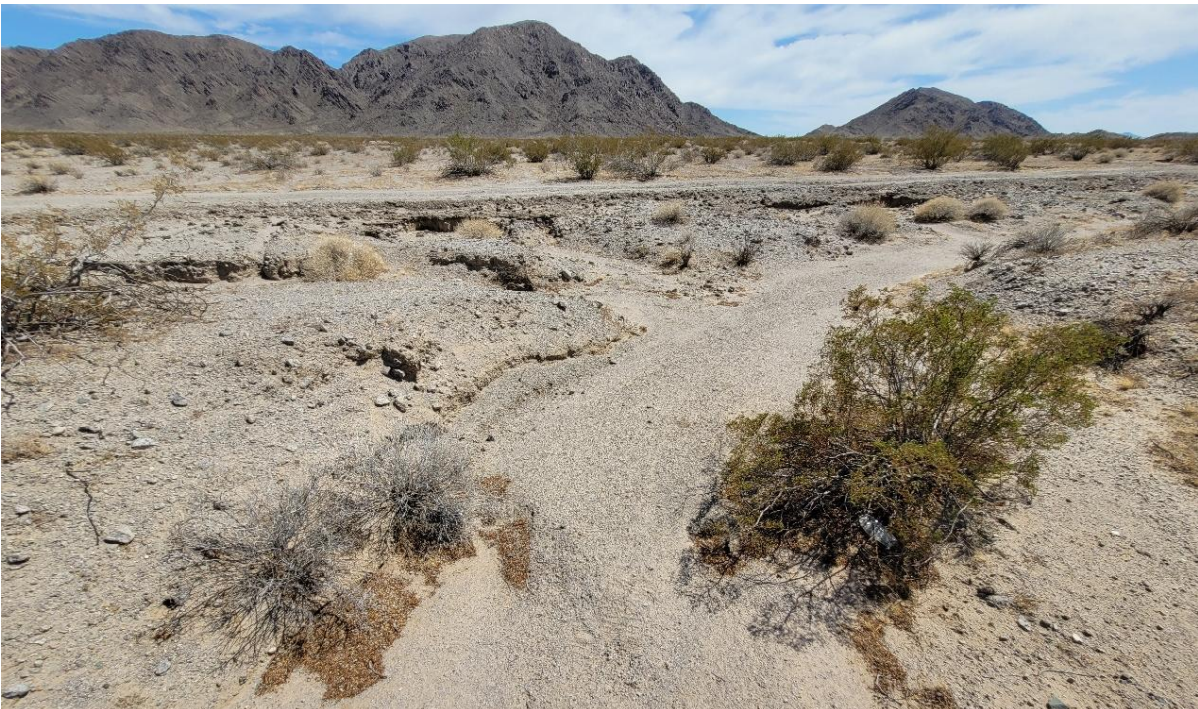
Photo Point E-6-3 (East Array). Southeast facing representative photograph of an upstream portion of a drainage exhibiting indicators of an OHWM (see Figure 10 Page 15).