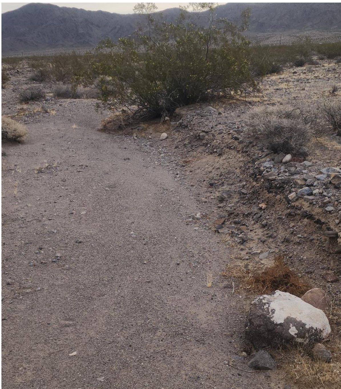
Photo Point T12 (Gen-Tie Corridor). East facing representative photograph illustrating indicators of an OHWM in a drainage feature, corresponding to ATG-005 Datasheet (see Figure 10 Page 21).