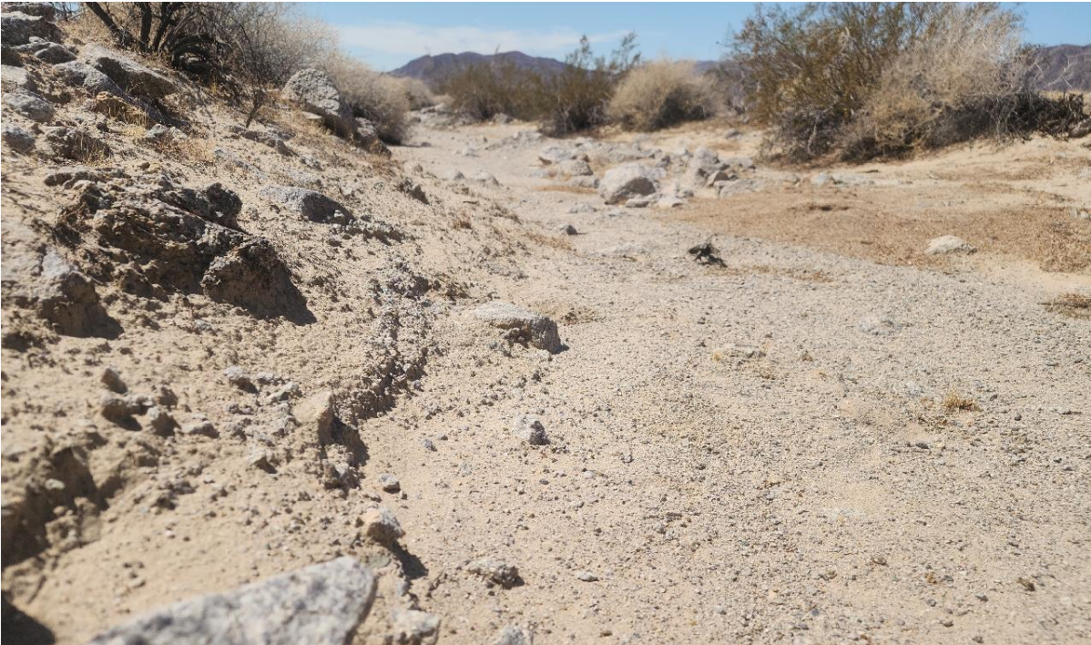
Photo Point E-7-3 (East Array). West facing representative photograph illustrating an OHWM and no riparian vegetation, corresponding to the ATG-004 Datasheet (see Figure 10 Page 16).