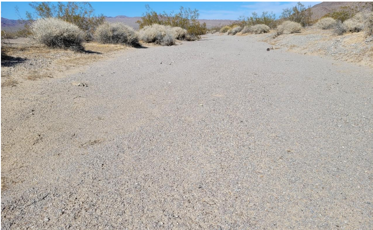
Photo Point E-5-3 (East Array). Northeast facing representative photograph illustrating indicators of an OHWM, corresponding to the KG-003 Datasheet (see Figure 10 Page 15).