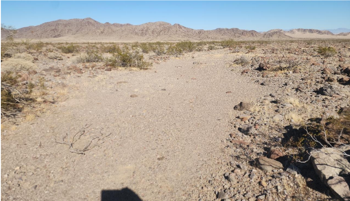
S2-13-2 (South Array 2). East facing view of a representative area exhibiting indicators of sheet flow and swales with no obvious indicators of an OHWM (see Figure 10 Page 37).