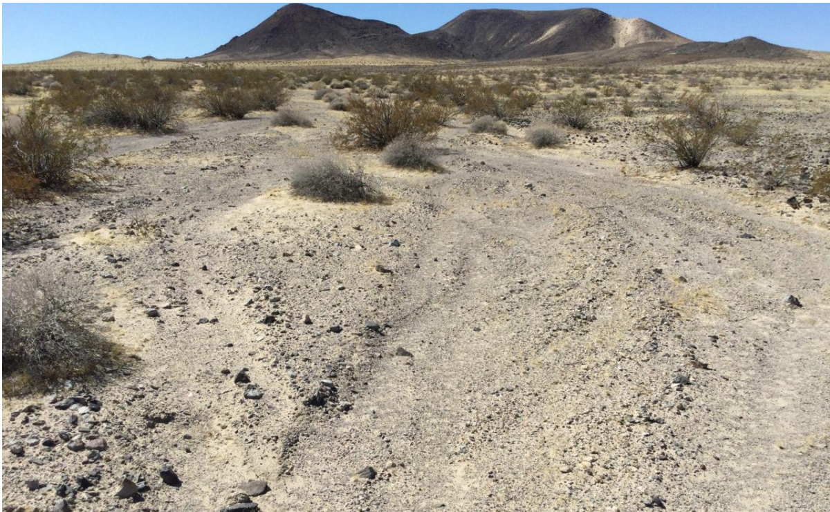
Photo Point S3-11-1 (South Array 3). West facing representative photograph of drainages in the Study Area exhibiting weak indicators of a bed and bank and change in substrate (see Figure 10).