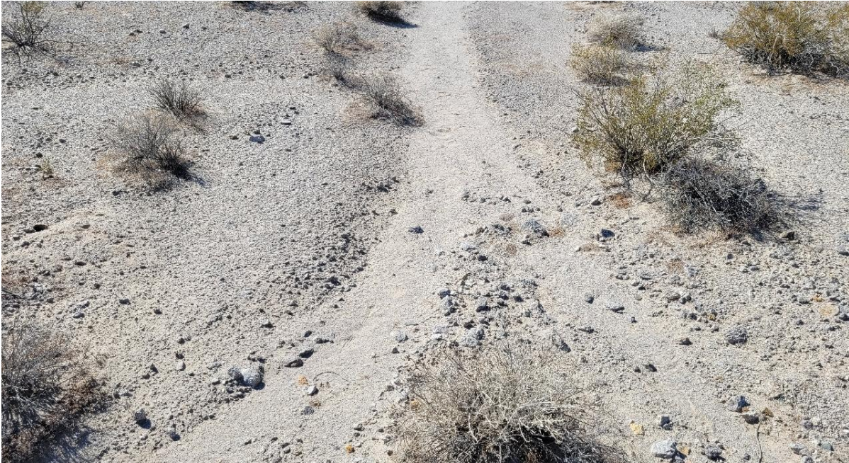
Photo Point E-4-1 (East Array). Northwestern facing representative photograph facing downstream of a small drainage exhibiting indicators of an OHWM (see Figure 10 Page 12).