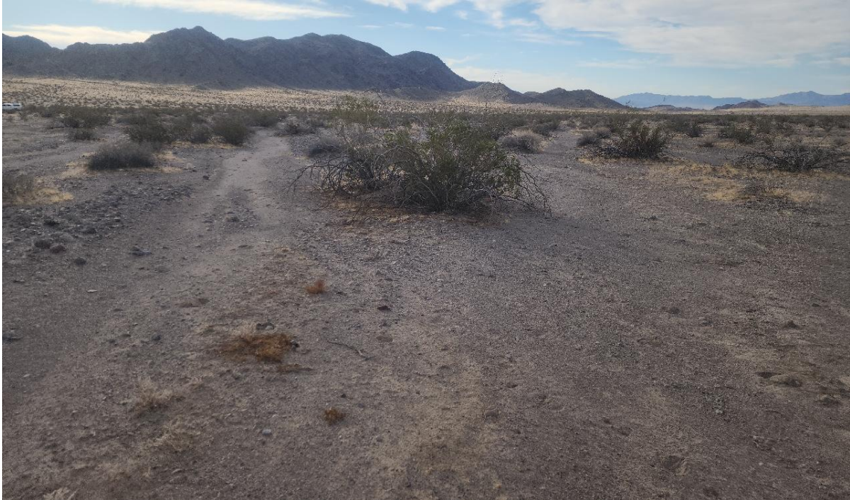
Photo Point S1-3-2 (South Array 1). East facing representative photograph illustrating an upstream portion of a drainage exhibiting an OHWM and no riparian vegetation, corresponding to the ATG-003 Datasheet (see Figure 10 Page 25).