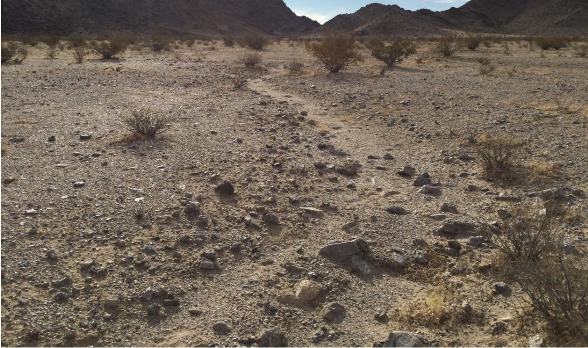
Photo Point E-11-3 (East Array). East facing representative photograph illustrating indicators of an OHWM, corresponding to the EK-003 Datasheet (see Figure 10 Page 26).