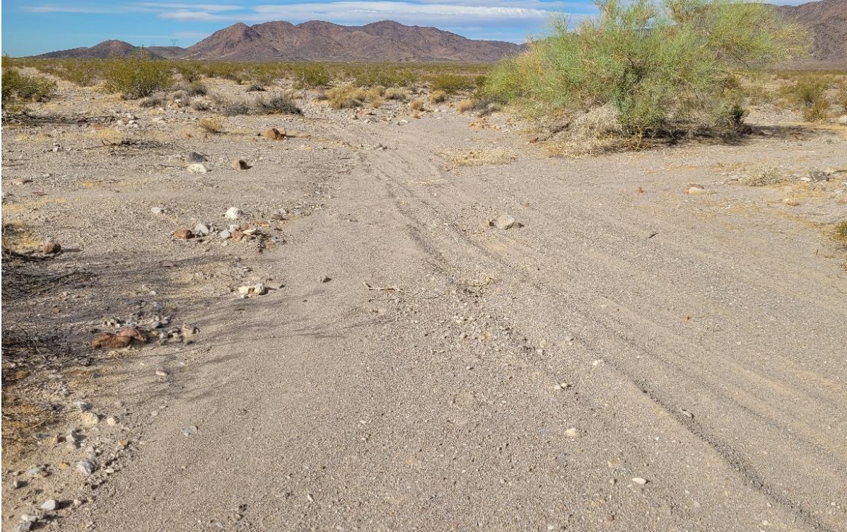
Photo Point T-5 (Gen-Tie Corridor). West facing view of drainage where indicators have been disturbed by vehicular activities (see Figure 10 Page 20).