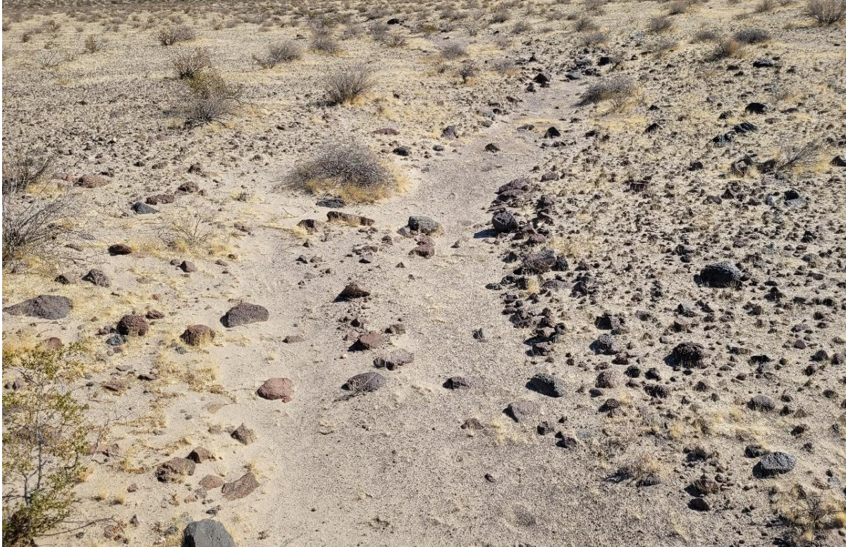
Photo Point S3-8-1 (South Array 3). Northeast facing representative photograph of drainages in the Study Area exhibiting weak indicators of a bed and bank and change in substrate (see Figure 10).