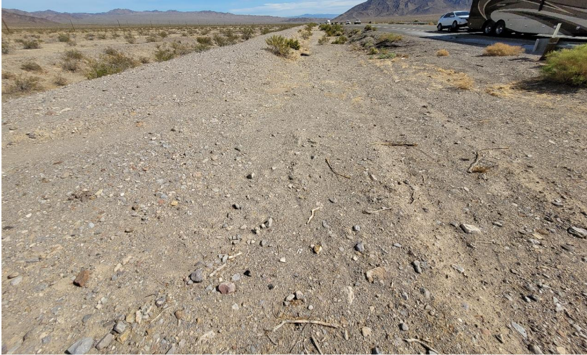
Photo Point T-1 (Gen-Tie Corridor). Northeast facing representative photograph illustrating a floodplain control ditch paralleling Interstate 15, facing downstream (see Figure 10 Page 19).