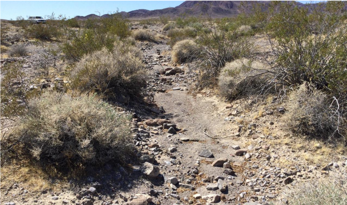
Photo Point S2-5-2 (South Array 2). East facing representative photograph of a downstream drainage feature exhibiting indicators of an OHWM, corresponding to the EK-001 Datasheet (see Figure 10 Page 39).