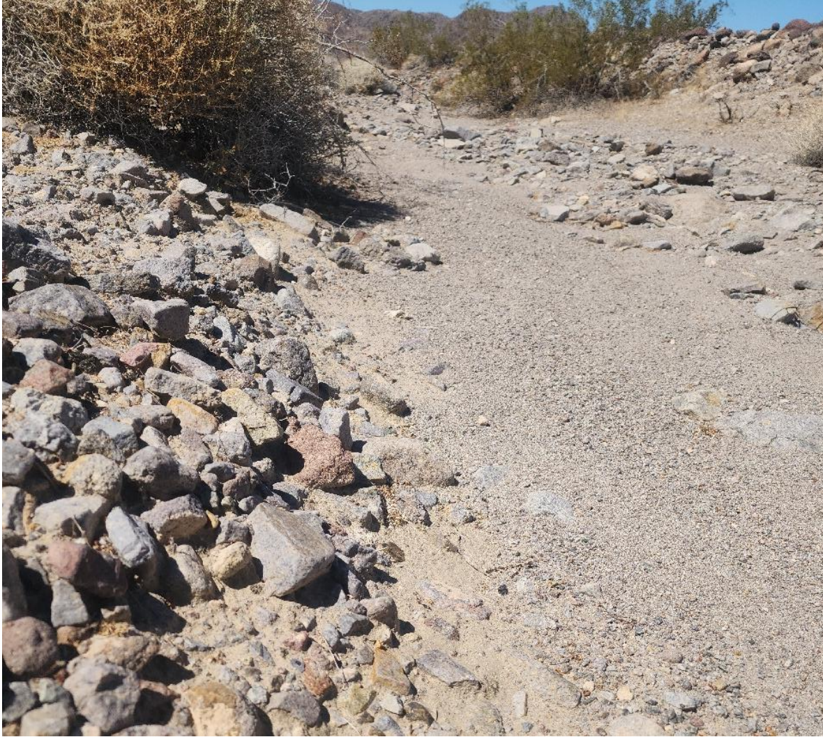
Photo Point S2-6-2 (South Array 2). West facing representative photograph of a drainage feature exhibiting indicators of an OHWM, corresponding to the ATG-002 Datasheet (see Figure 10 Page 37).