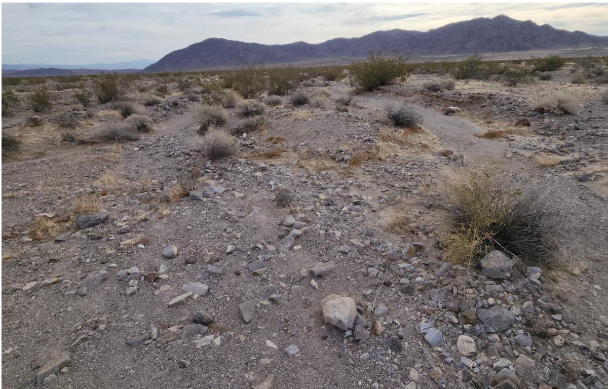
Photo Point T-11 (Gen-Tie Corridor). East facing representative photograph illustrating braided drainages, facing downstream (see Figure 10 Page 21).