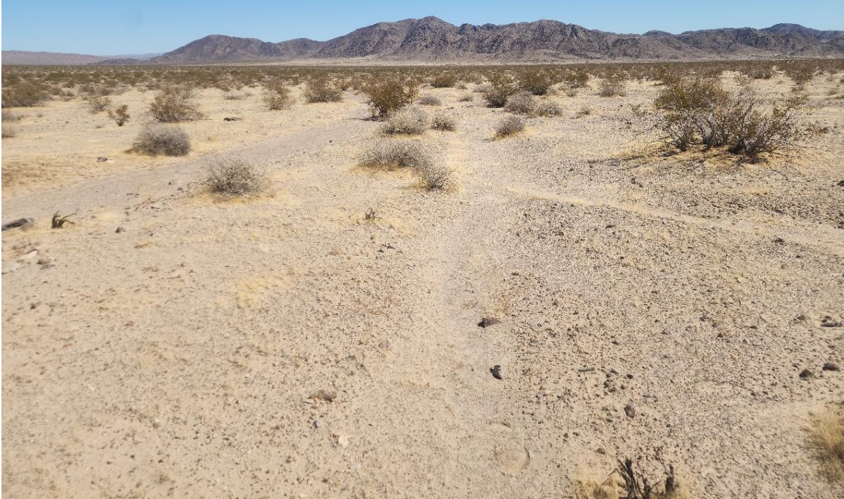
Photo Point S3-2-1 (South Array 3). Northeast facing representative photograph of drainages in the Study Area exhibiting weak indicators of a bed and bank and change in substrate (see Figure 10 page 46).