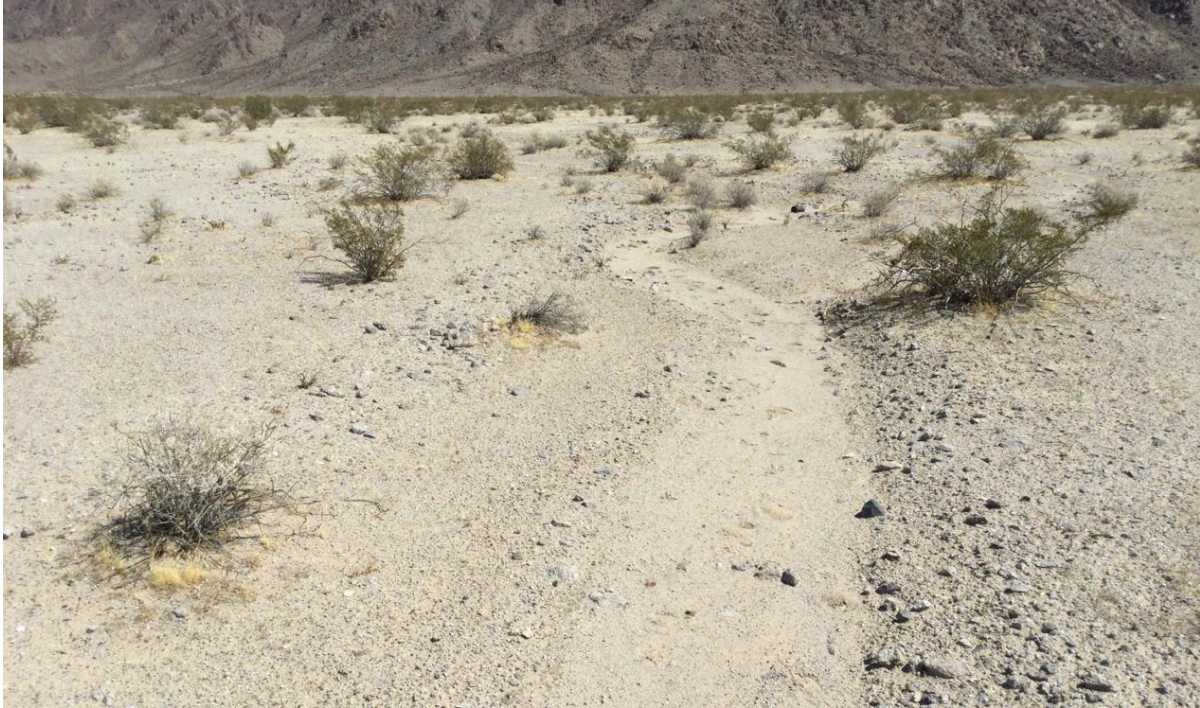
Photo Point E-9-2 (East Array). East facing representative photograph illustrating an upstream portion of a drainage exhibiting an OHWM and no riparian vegetation, corresponding to the EK-004 Datasheet (see Figure 10 Page 18).