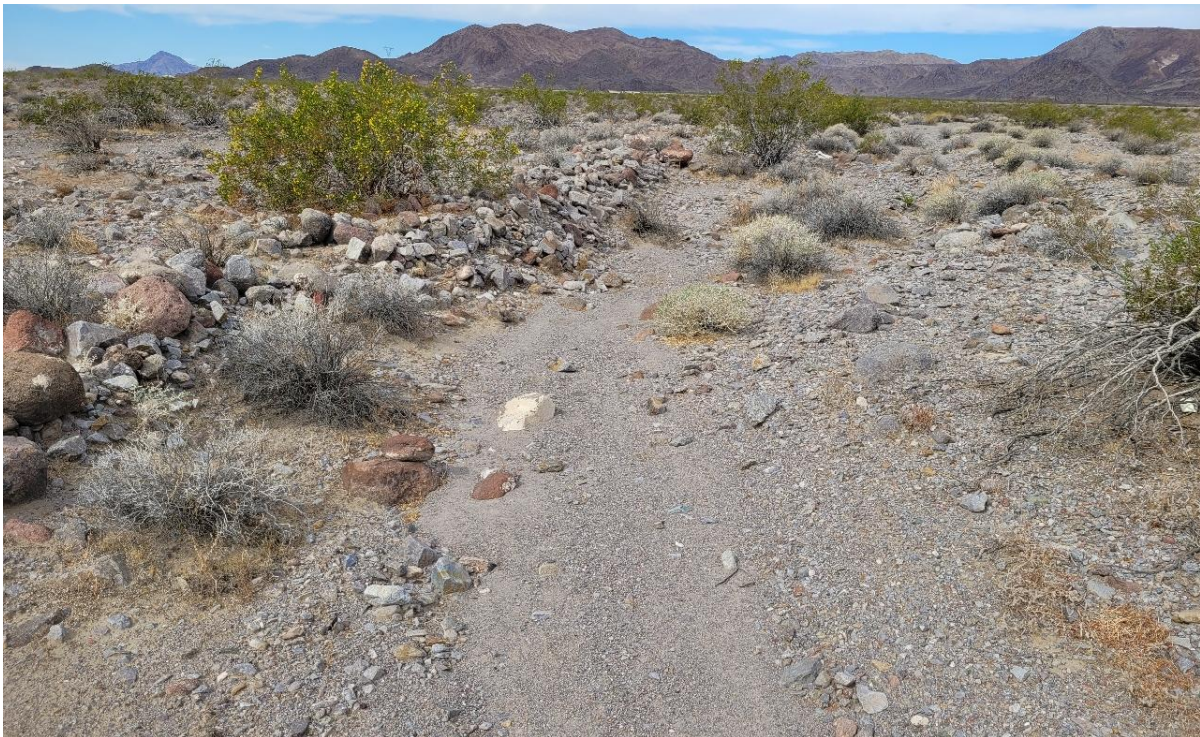
Photo Point S1-5-2 (South Array 1). Southwest facing representative photograph illustrating indicators of an OHWM, corresponding to the KG-001 Datasheet (see Figure 10 Page 30).