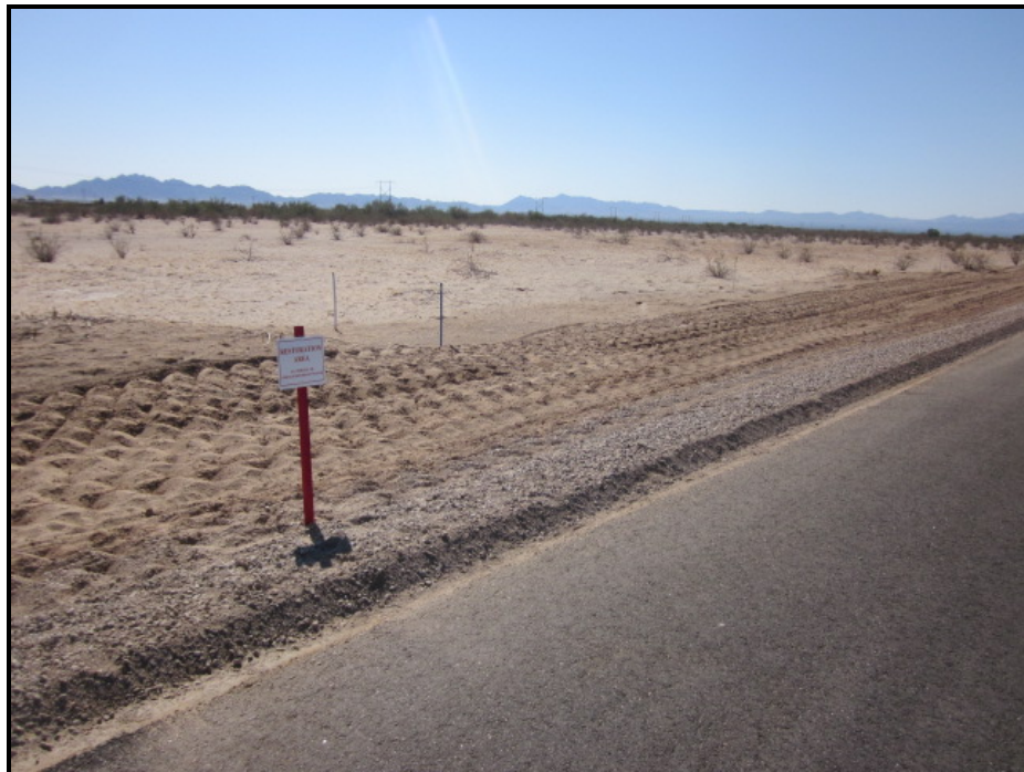
FIGURE 1. Sheep's foot imprinting on the southern road shoulder after seeding in Fall 2011.

Restoration areas were then signed with large, restoration-specific, metal signs.