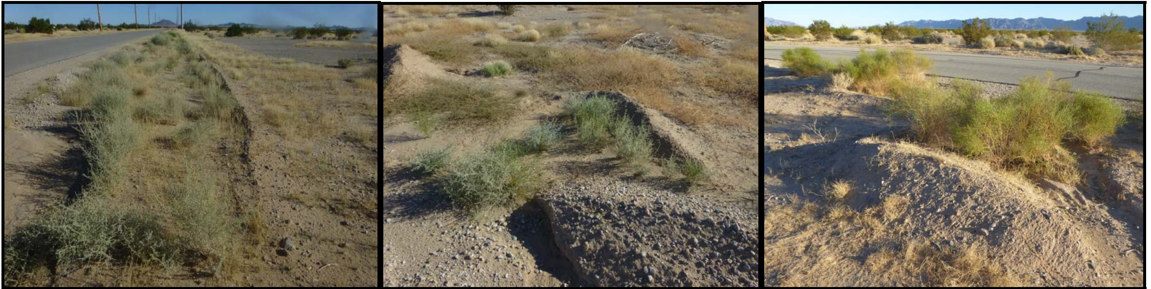
FIGURE 3. Examples of seedling growth in created swales, October 2014 (first two photos) and October 2015.