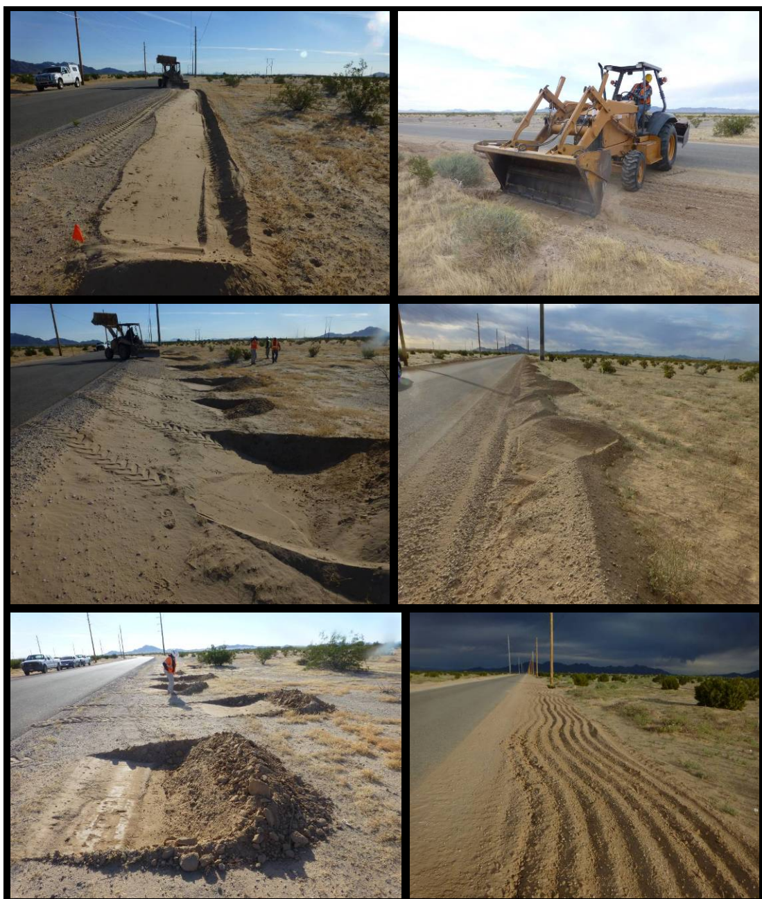
FIGURE 2. Different swale configurations created to capture moisture, sediment and seed. Techniques on the left were implemented experimentally on portions of the southern access road shoulder in Fall 2013. Those on the right were implemented in March 2014 on remaining areas on the southern road shoulder and on the northern road shoulder.