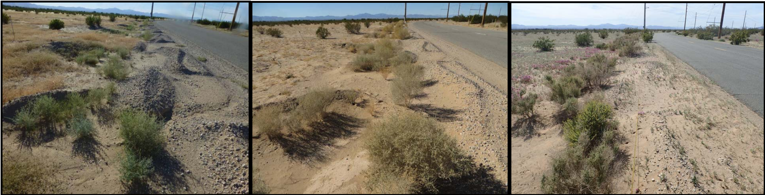
FIGURE 4. Transect BS2 - Example of high growth of seeded shrub species in created berms and swales through time. The upper photo is from October 2014, one year after restoration; the middle shows continued high survival and growth in November 2015; the lower is from 2024, the vegetation thriving.