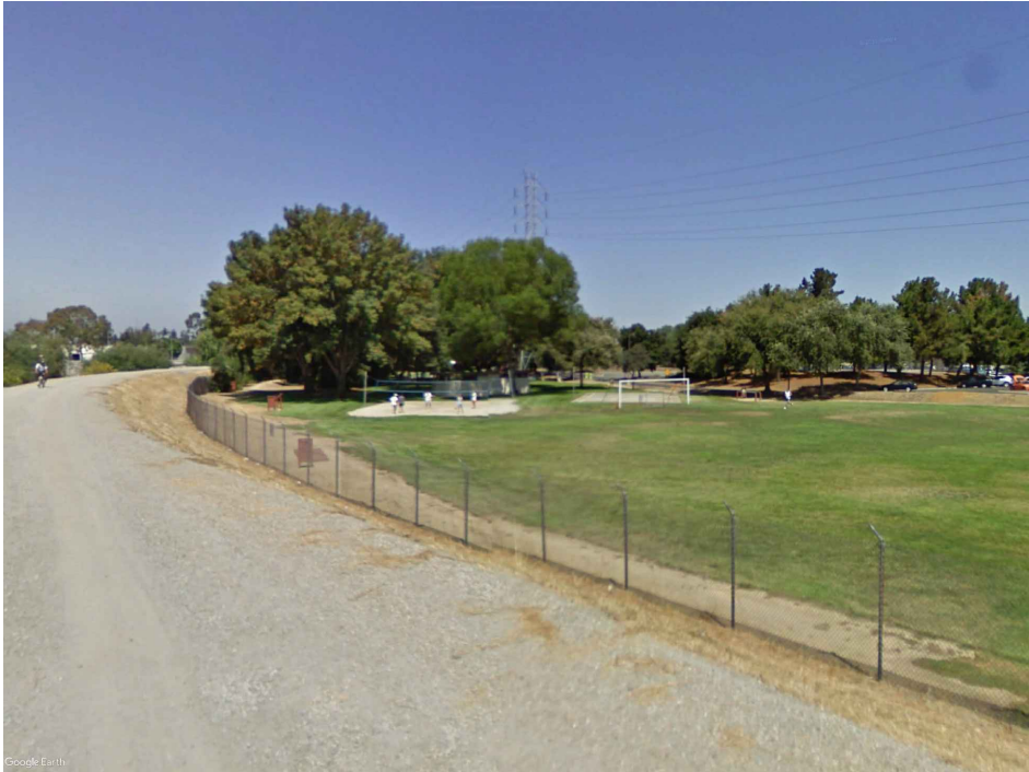
3 North at Guadalupe River Trail