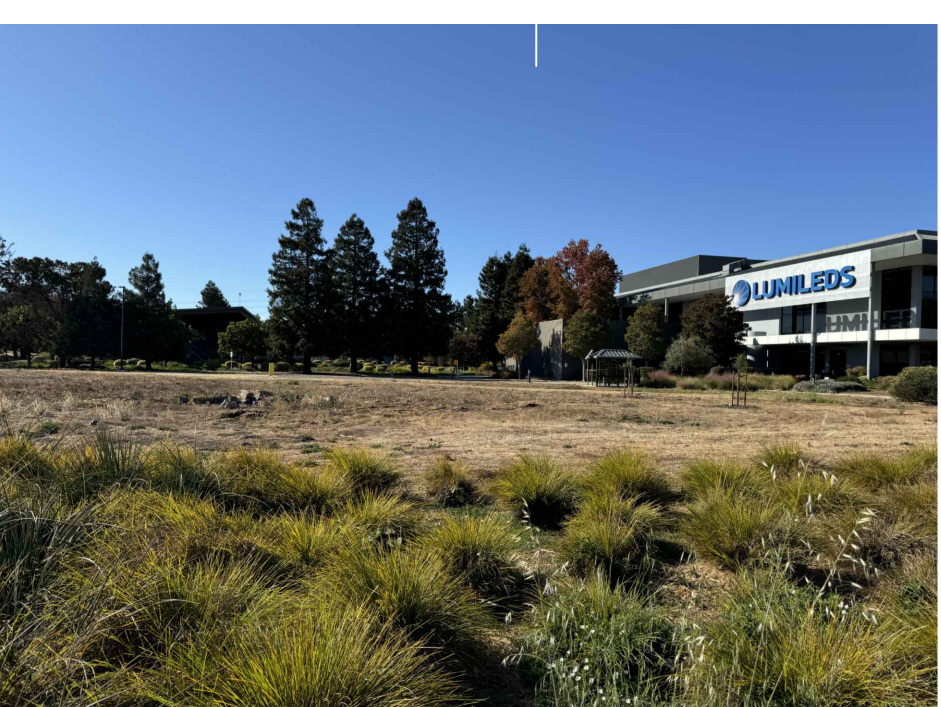
6 Northwest at Building South