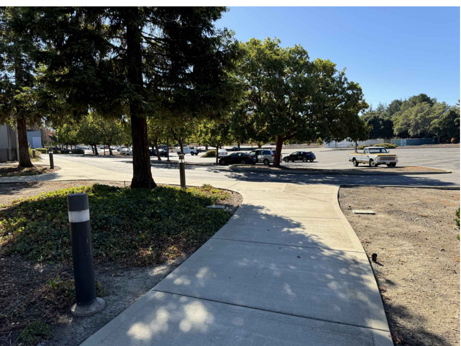
4 West at Interior Parking Lot