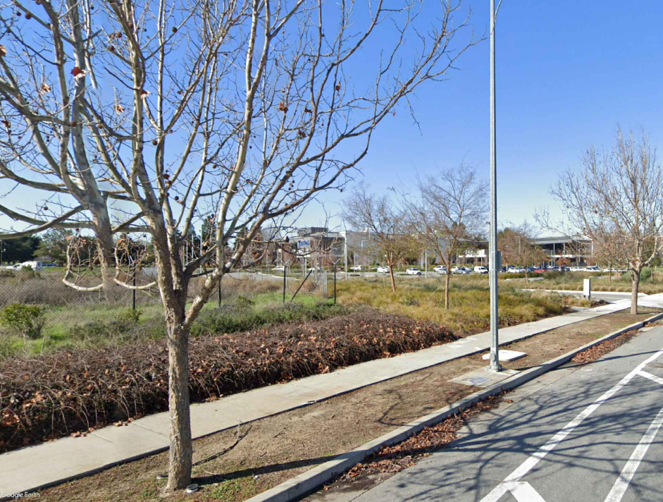
1 Northwest at Orchard Parkway