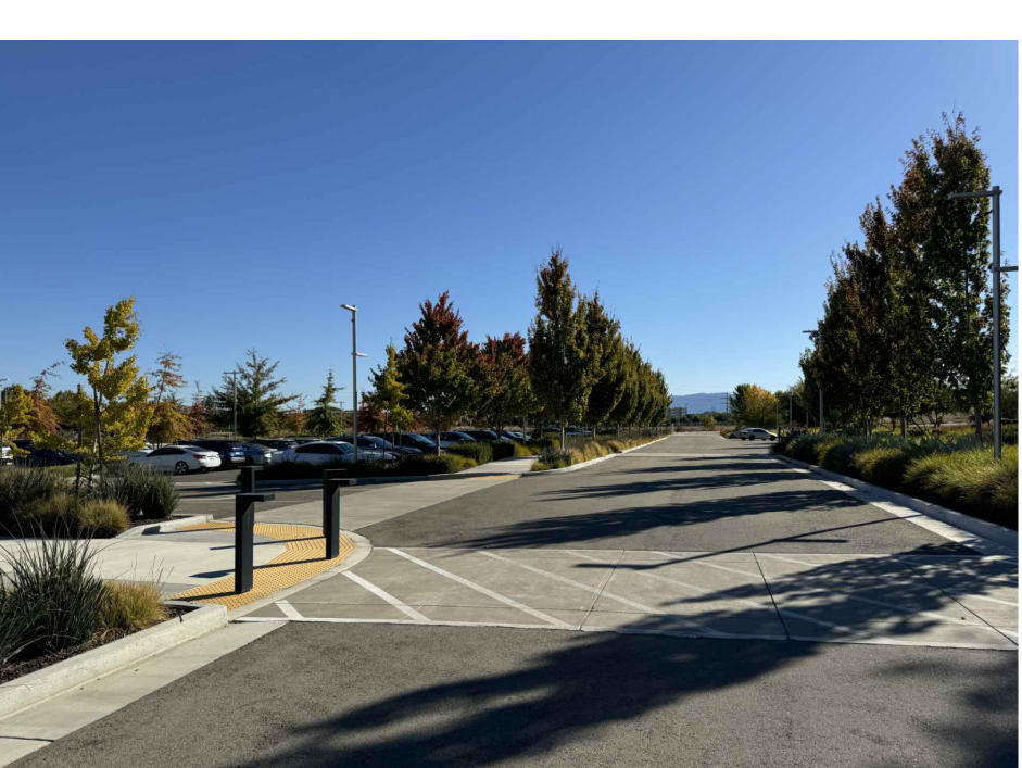
7 South at Interior Drive / Parking Lot