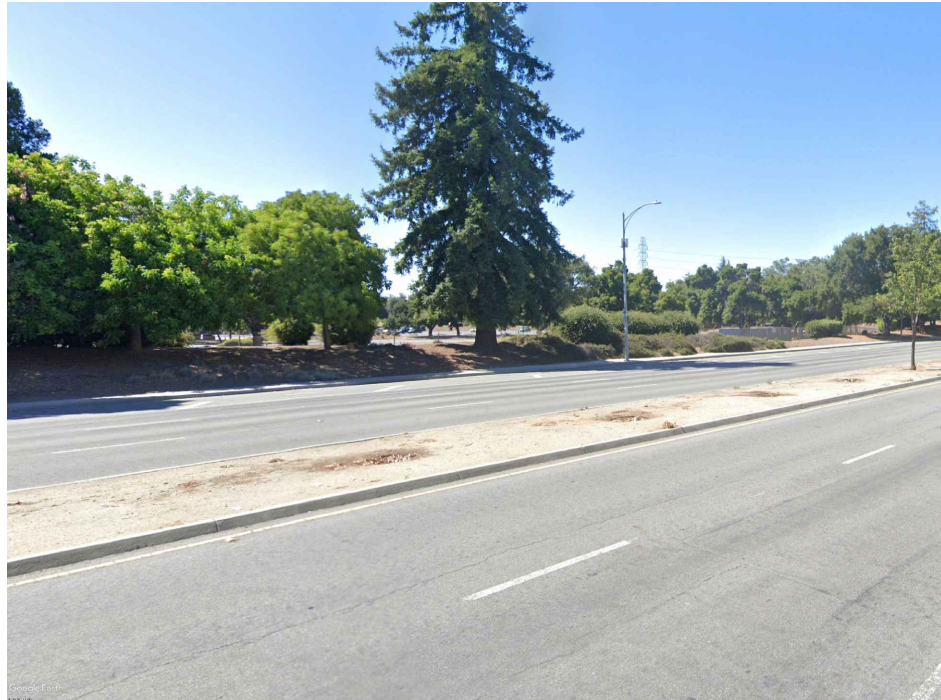
2 South at West Trimble Road