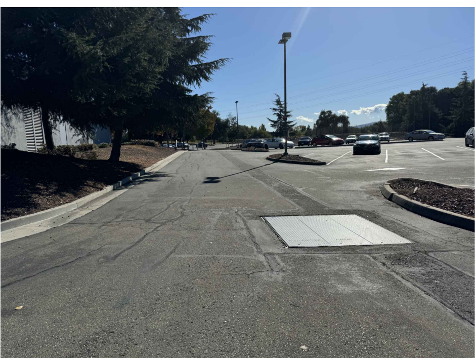
5 South at Interior Parking Lot